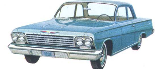
Biscayne 2-Door Sedan—this (would you believe it?) is the thriftiest full-size Chevrolet.