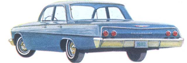
Bel Air 4-Door Sedan—all '62 Chevrolet sedans bring you this classic slim-roof look.