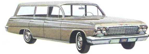
Impala 6-Passenger Station Wagon—who could ask for a classier cargo carrier than this?