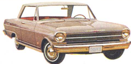
Chevy II Nova 400 Sport Coupe—and you can have it with bucket seats if you like, optional at extra cost.