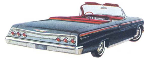
Impala Convertible—fresh-as-a-breeze styling extends back to new aluminum taillight cove.