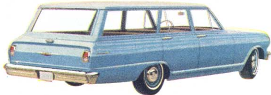
Chevy II 100 4-Door Station Wagon—available with a full range of power assists, optional at extra cost.