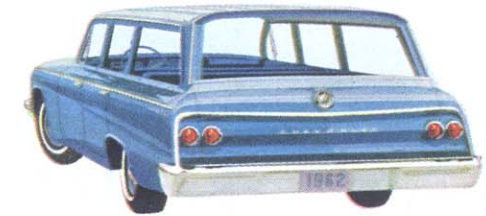
Bel Air 6-Passenger Station Wagon—with up to a whopping 97.5 cubic feet of cargo area.