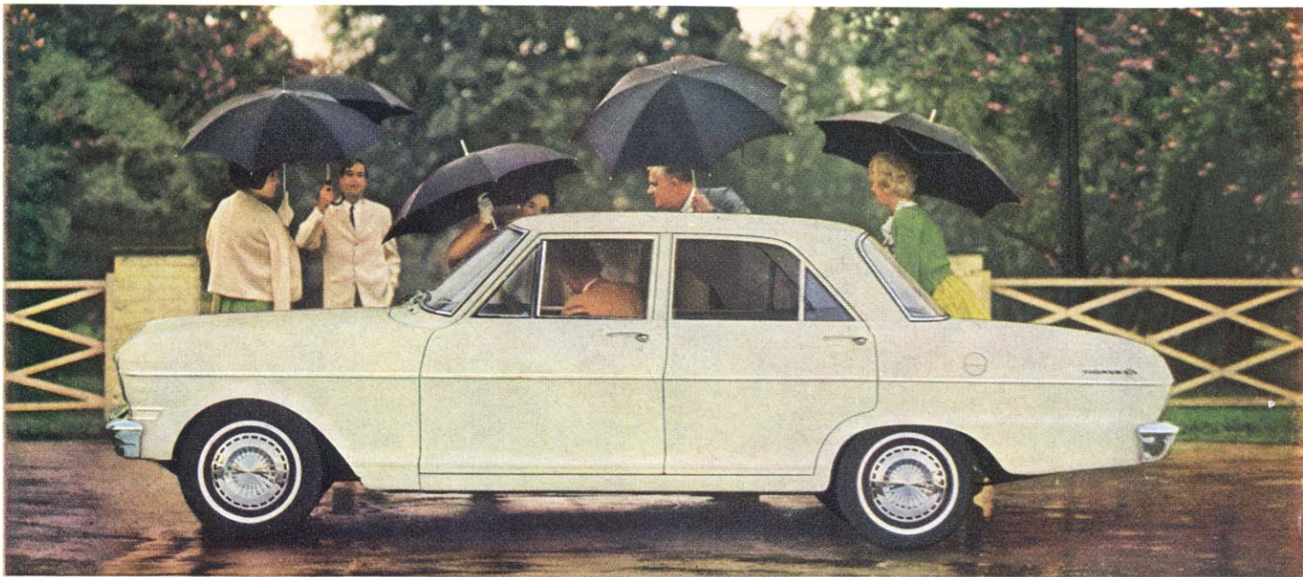
Chevy II 300 4-Door Sedan—all the II's have standard-equipment heater and defroster.

Sensibly sized as this Chevy II is, it's amazingly generous with room. All sedans and 2-seat wagons (thanks to Body by Fisher finesse) tote six well-fed adults and just about anything they want to take along in the way of baggage. Beginning to sound good? Well, it'll sound even better when your dealer gives you the low-down on the price.