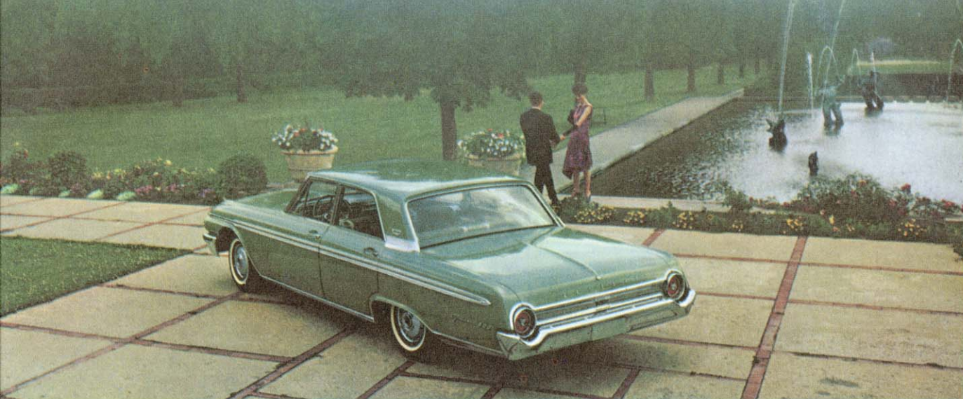
Galaxie/500 Town Sedan