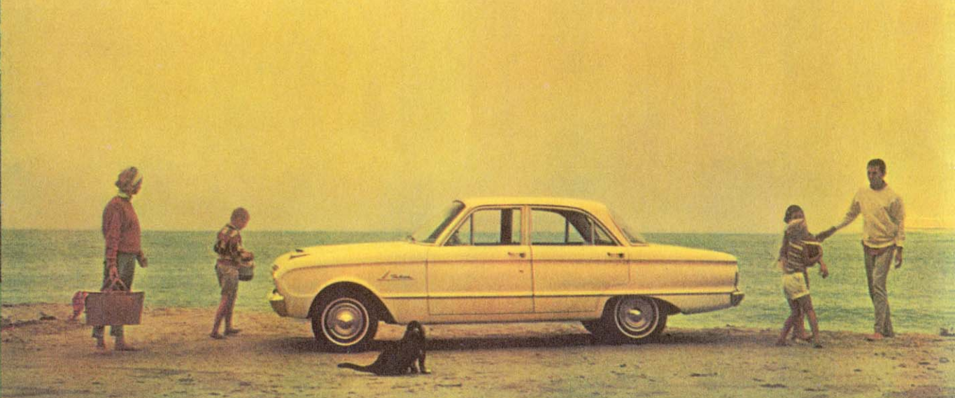
Falcon Fordor Sedan

Choose from a rainbow of colors . . . a treasure chest of new features . . . a rich variety of special models. Never before have you seen a line of Fords so long, so varied, so beautifully built to serve your needs. On this page are a few variations of the basic models . . . and there are many more which your dealer will be pleased to show you. Words