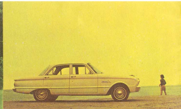
Falcon Fordor Sedan

sized and priced right between Galaxie & Falcon