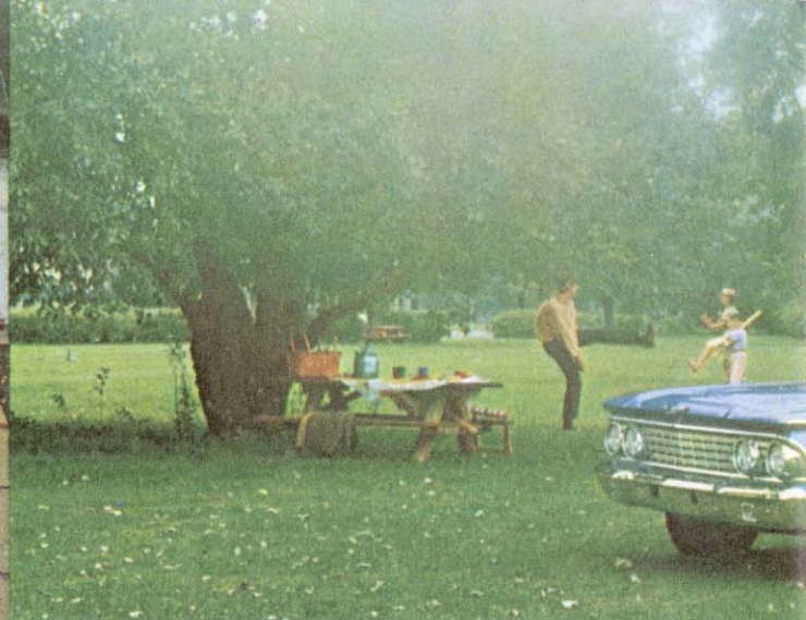
Fairlane Club Sedan

Whatever you're looking for in a new car... look to the long Ford line