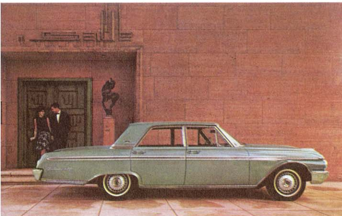
Galaxie/500 Town Sedan