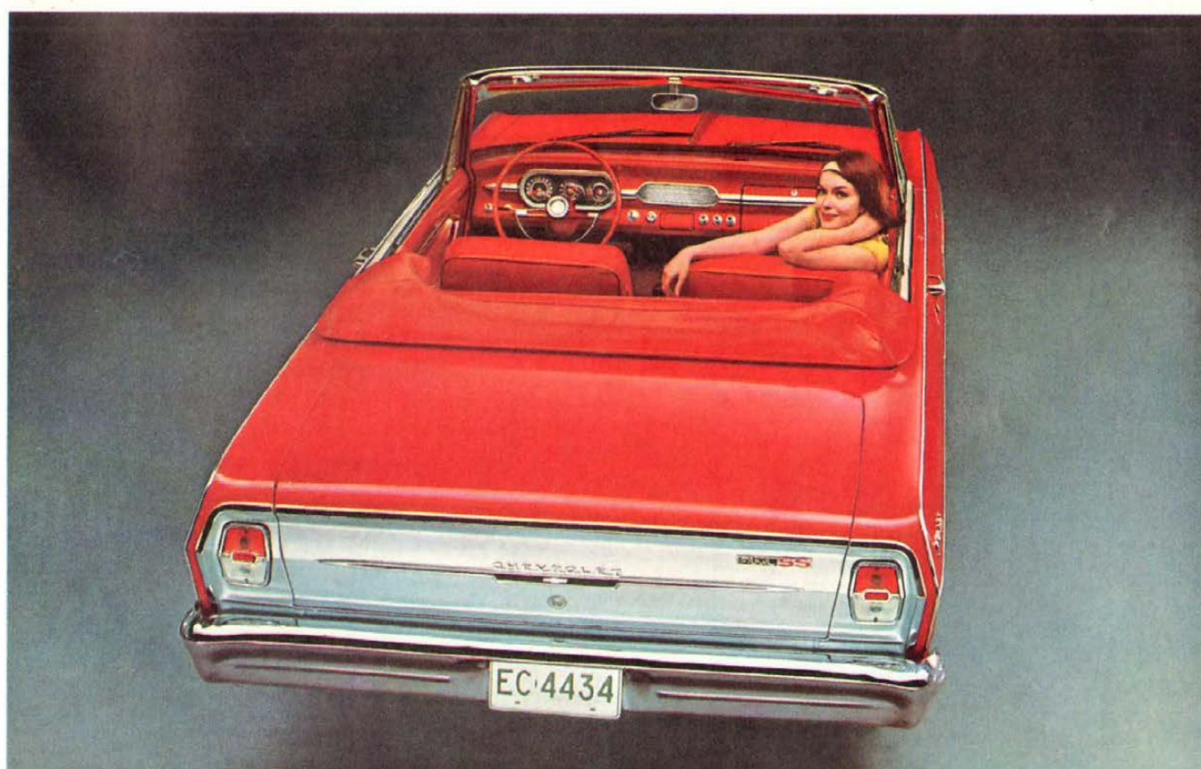
Chevy II Nova Super Sport Convertible