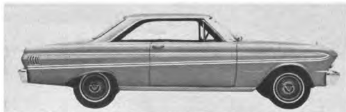
FALCON SPRINT will be available only as fastback or convertible. Distinctive wheel covers, special emblems identify it.