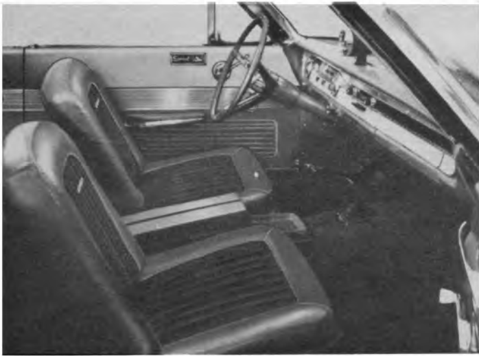
BUCKET SEAT option with floor shift and dash-top tachometer dress up interior of Sprint. Wheel is simulated wood grain.

tional bright metal trim dresses up all models of the Falcon.