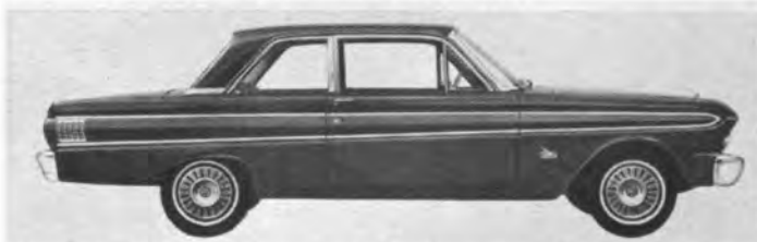
BRIGHT METAL molding follows outline of sculptured spear to identify Futura sedan. Bright trim disguises window pillars.