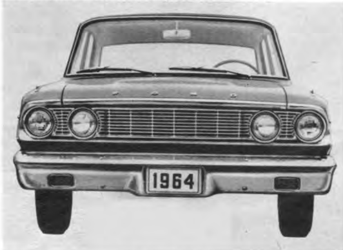
RECESSED grille bars on full-size Fords jut forward in three waves to give a three-dimensional appearance to the unit.