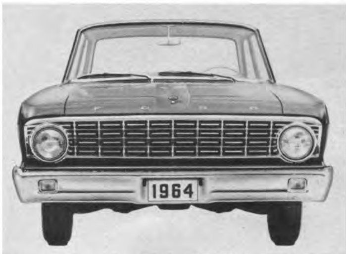
FALCON'S NEW grille is a bold rectangular design that is angularly recessed. Full-depth bumper provides an integral over-ride feature.