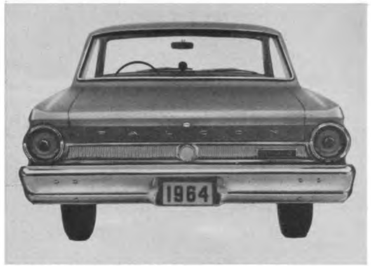
SPRINT EMBLEM at right end of bright metal applique identifies liveliest of the Falcons. Big "pie plate" taillights continue.

hardtop models, both 2- and 4-door, have been discontinued. New grilles, new rears and new side trim are markedly evident throughout the big line.