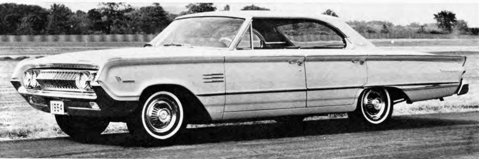
MARAUDER 4-DOOR hardtop is big Mercury's top model, has slantback roofline popularized by 2-door version and can be fitted with the 427-cu. in. engine.