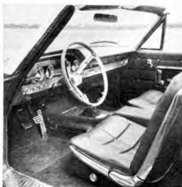
PARK LANE convertible has new thin shell bucket seats with power options.

bhp ratings and the Marauder 427-cu. in. engines with mechanical lifters, developing 410 bhp with single 4-barrel and 425 bhp with dual 4-barrel carburetors.