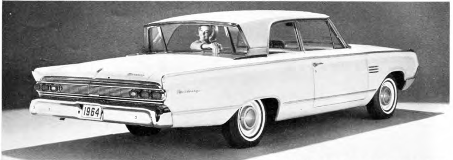
MERCURY'S NOTCHBACK roofline is retained for '64, is available in 2-door (above) or 4-door models.

MACHINED HUB of drum pilots wheel to concentricity.