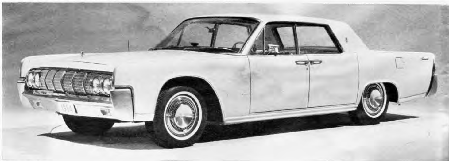
LINCOLN CONTINENTAL for '64 has been stretched 3 in. through the rear door area to 126-in. wheelbase and 216-in. overall length. Rear-seat passengers benefit from increase.

The casual observer will be unable to detect much difference in the Lincoln Continental, which is as it should be with such a latter-day classic. Stretched out 3 in. through the rear