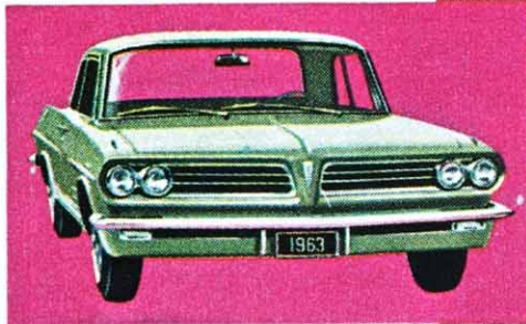
TEMPEST LE MANS 2-DOOR COUPE