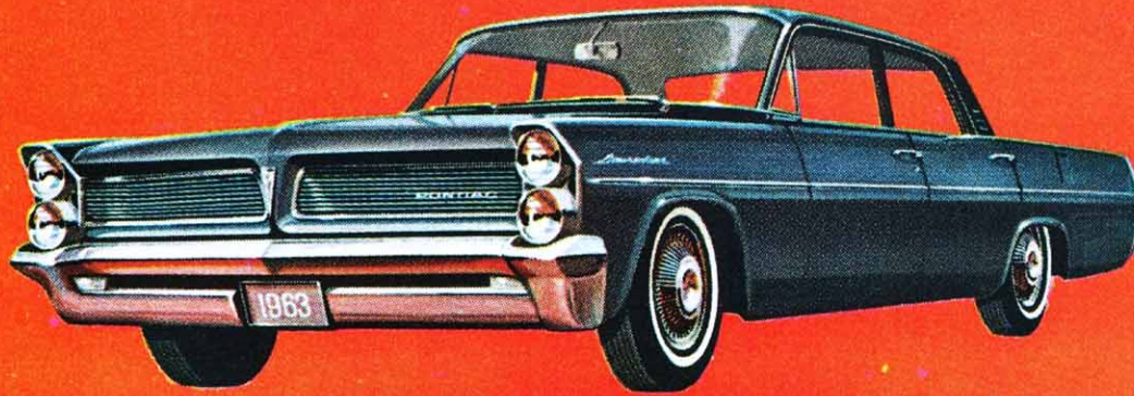
LAURENTIAN 4-DOOR SEDAN