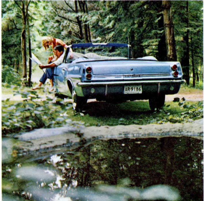
Everybody's entitled to at least one convertible. A Tempest