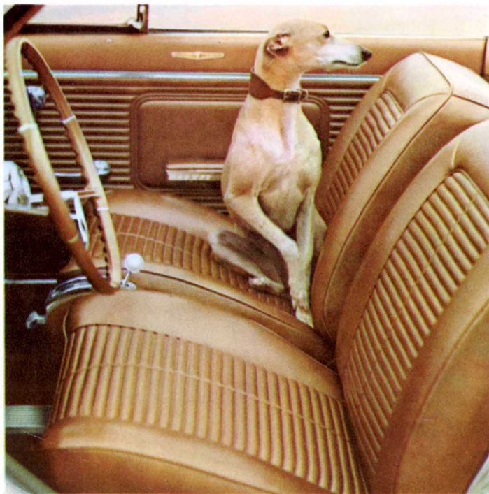
All-vinyl (except for rugs, of course) and five color schemes

What's new with Tempest this year? Not enough to change the superb driving qualities of the car. Just enough to make it thoroughly desirable. To start with, Tempest is still America's only front-engine, rear-transmission car—so it's beautifully balanced. The spunky 4-cylinder engine is still with us. So are 15-inch wheels. As for changes, the big one's in the styling. You'll see what we're talking about as you go through this book. You'll like it, we're sure. The suspension's been redesigned to give you a smoother, more comfortable ride. We've added a rousing 260-hp V-8 to our extra-cost-option list, too. Self-adjusting brakes, a Delcotron a.c. generator, a bigger fuel tank and a wider track are standard. How's that for exploding the myth that cars have to be expensive to act it—and look it?