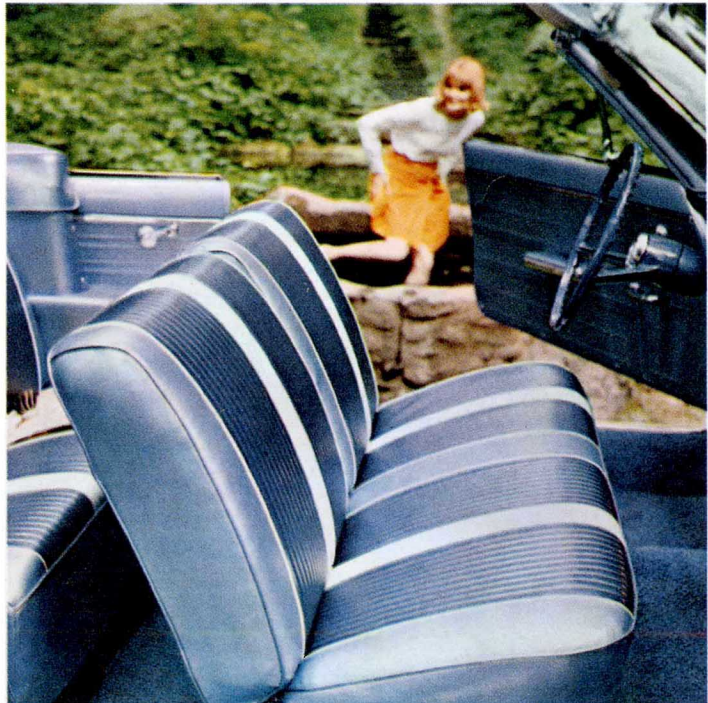
Rich fabrics, vinyl, carpeting—in 4 color teams. Beautiful