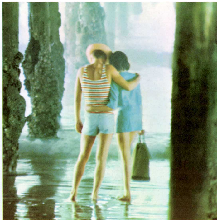
"Can't you stop talking about that Tempest for a minute?"