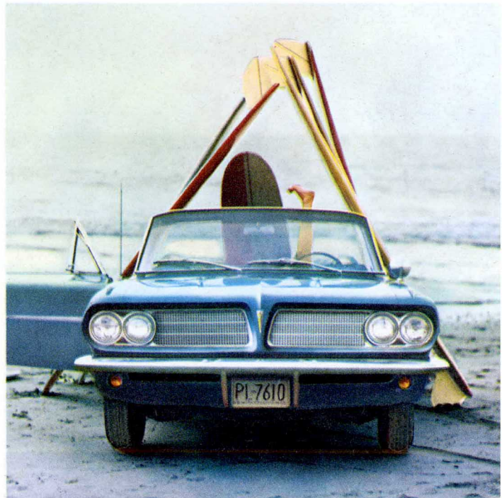
We put all that legroom in Tempest and look what happens