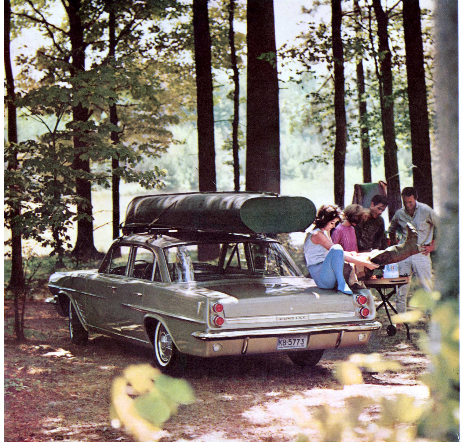
Some people swear by 4-Doors—and with a car like this, it's no wonder. Tempest 4-Door Sedan