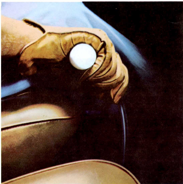
Floor-mounted gearshift is standard. Naturally