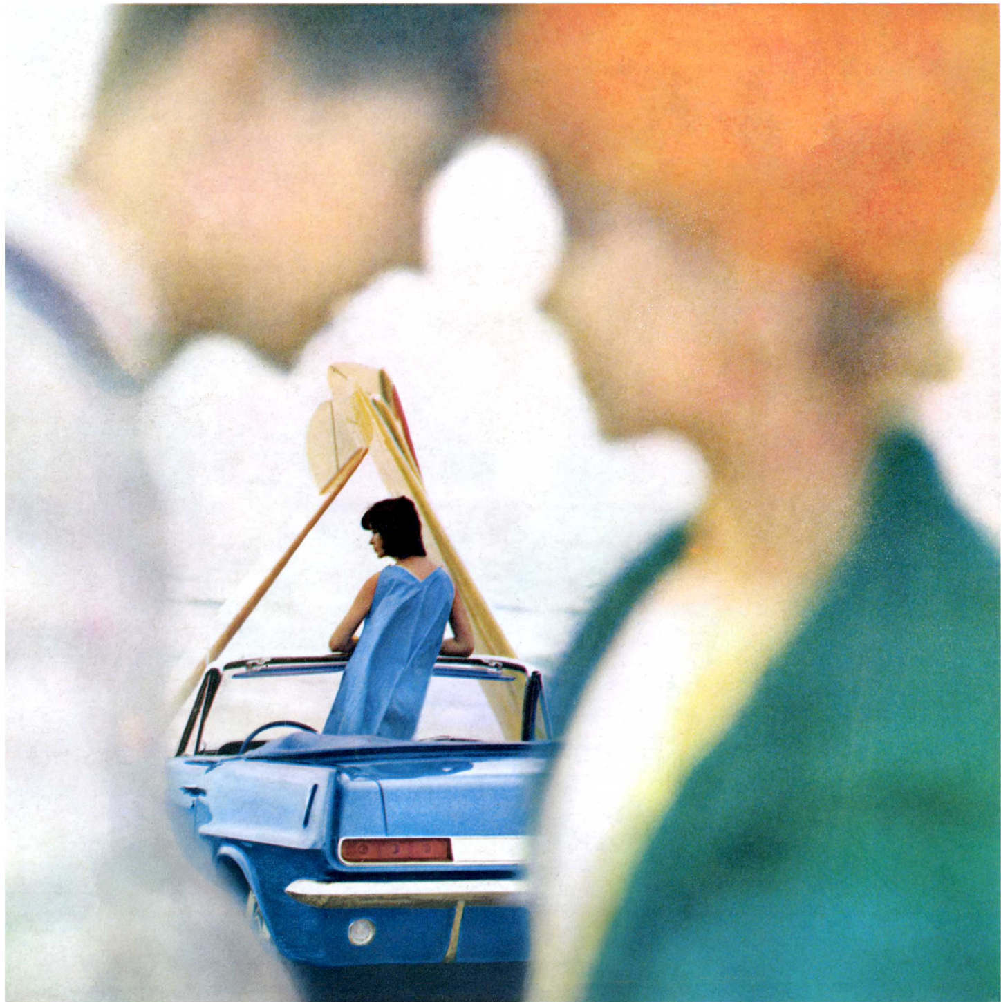
Litho in U.S.A. by Tempest-lovers. Isn't everybody?