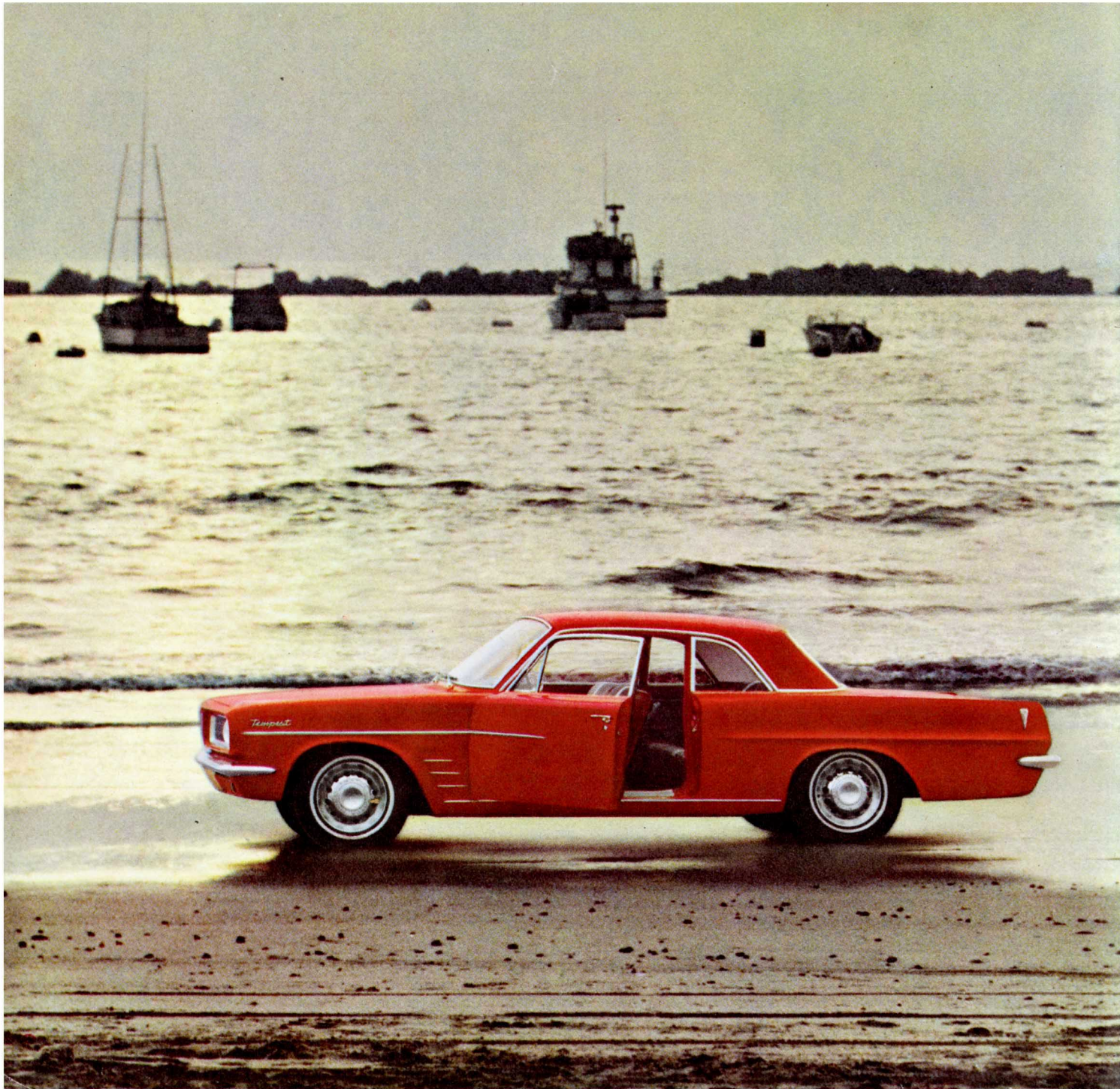
Sports Coupe—If this one were yours, we bet you wouldn't leave it sitting on a beach. It's too much fun to drive