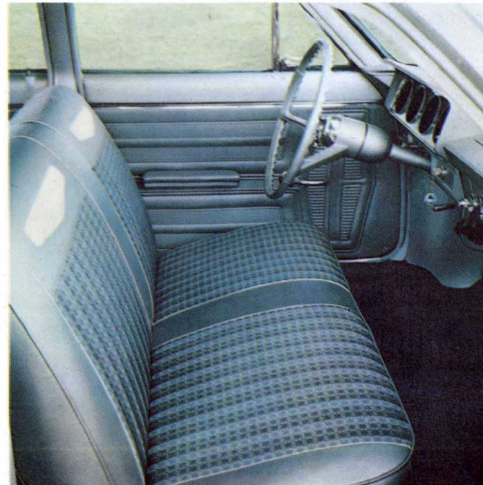
Lots of nice color schemes inside, and every one a beauty