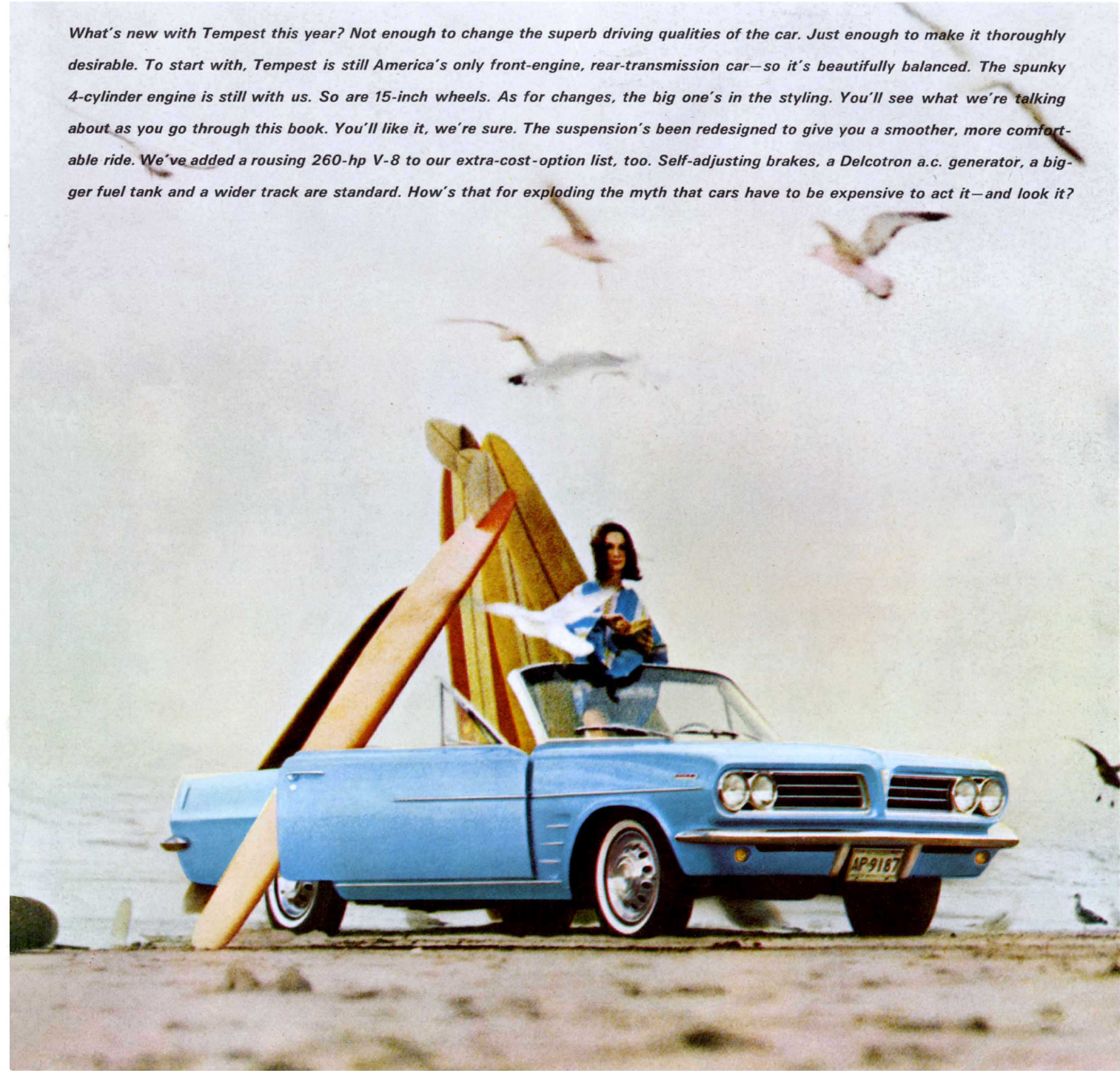
Le Mans Convertible—bucket seats, power top. It would be a sports car, except it has a full rear seat and great expanses of luggage space