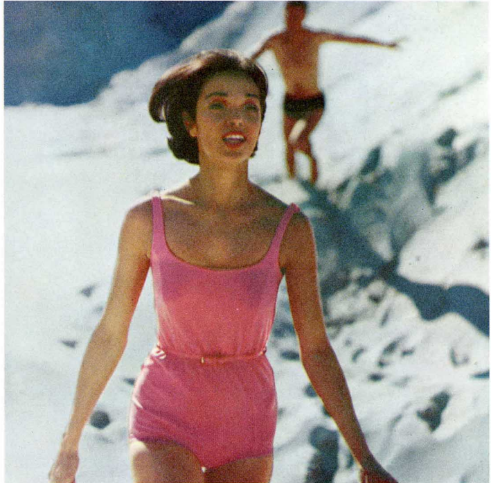
"So walking is cheaper. I'd still rather travel by Tempest"