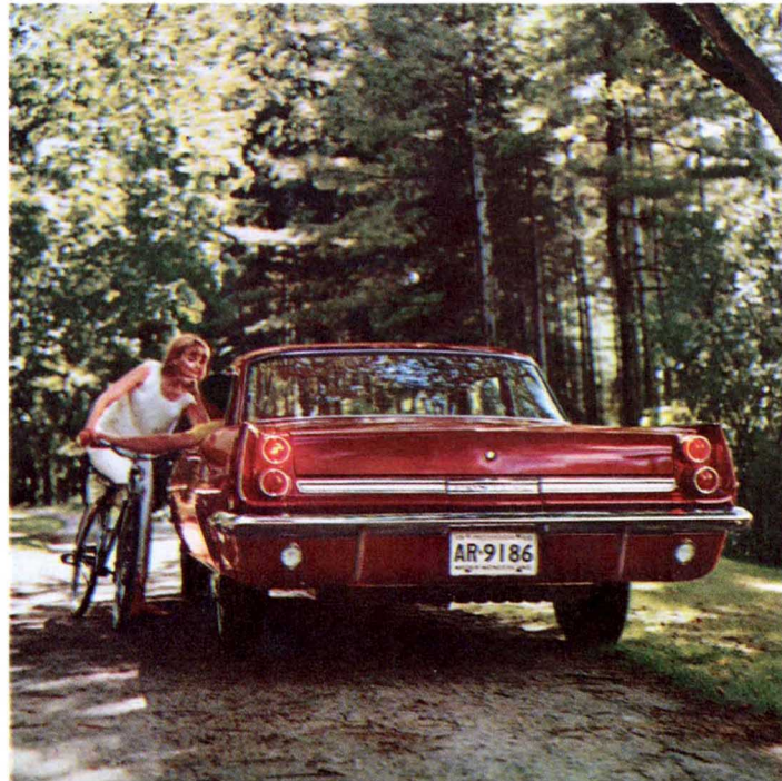
Tempest Coupe—about as sensible as they come. That's our plan