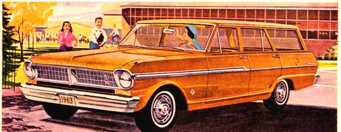
Beaumont Station Wagon