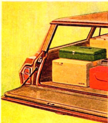
Whitewall tires optional at extra cost

Acadian performance: Some people say Acadian's 4 cylinder engine is better than the 6. Others argue the other way. We like them both, so we'll leave the choice up to you. One thing for certain, they'll both save you money (on gas and now with 60 day or 6,000 mile oil change). They'll both do anything you ask of them. The '63 Acadian virtually hums over the road with a perfect combination of front coil springs and Mono-Plate rear springs. Try it. You'll be more than pleased.