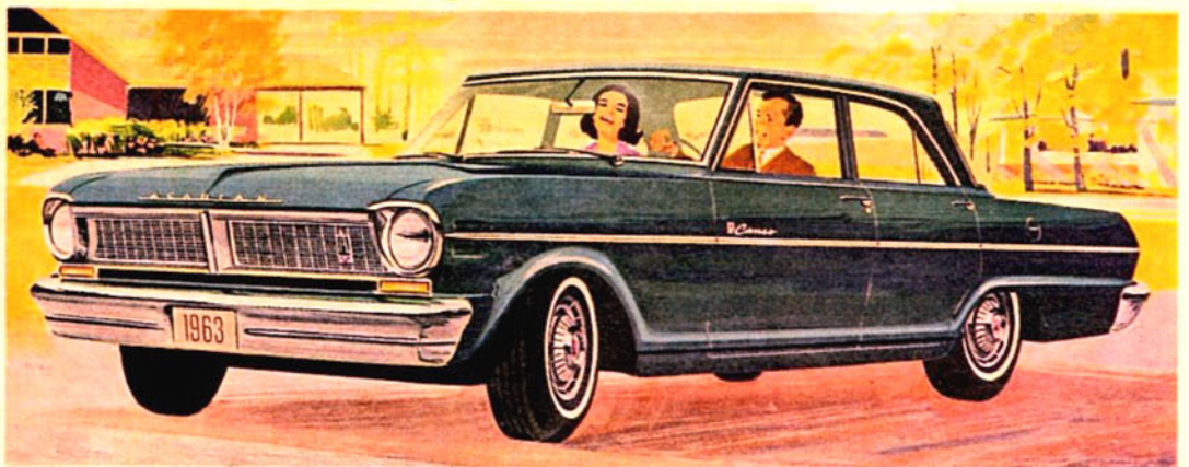
Canso 4-door Sedan

Acadian design: Clean, sensible, uncluttered—words that tell all about the '63 Acadian's style. See that interior on the left? It's another facet of Acadian's fresh design. Colors abound. Fabrics, appointments and standard extras are plentiful. Enough said? Acadian is as fresh as it looks (and that's pretty fresh).