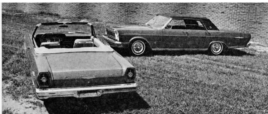
SQUARED OVAL taillights identify the '65 big Ford line. Galaxie LTD (right) is new luxury hardtop sedan model, has vinyl top panel.