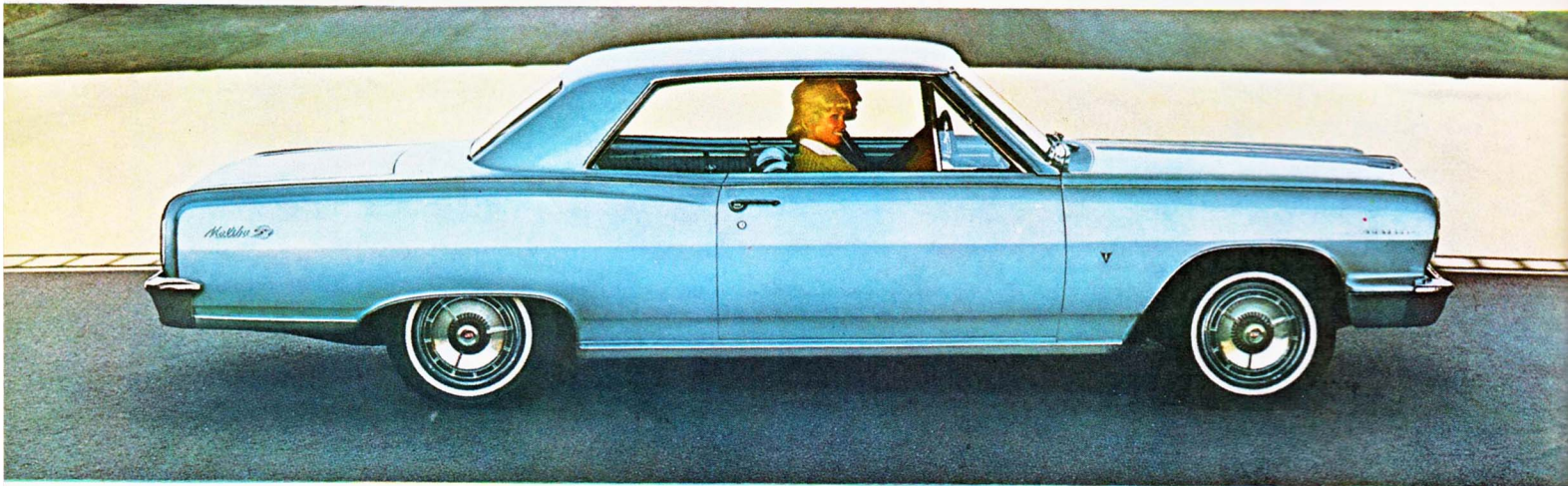
Chevelle Malibu Super Sport Coupe—one of 11 models in three series