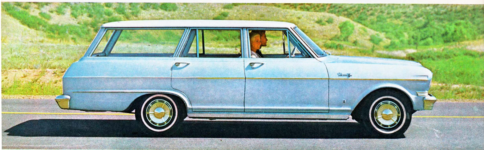
Chevy II Nova 4-Door Six-Passenger Wagon