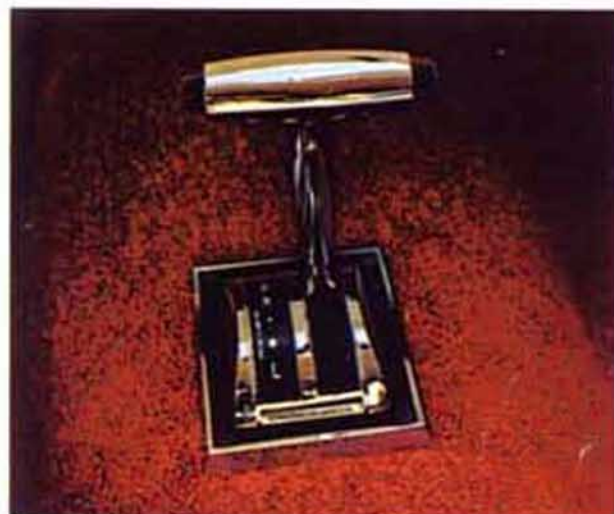
T-Bar Cruise-O-Matic Drive