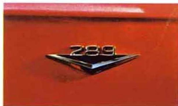
Three sports-blooded V-8's

*Available June, 1964. †Includes Handling Package. §Only with Handling Package.