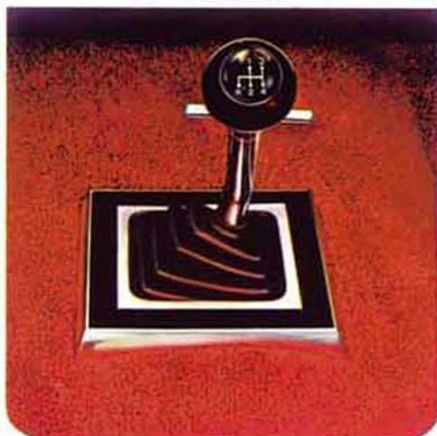
4-Speed Stick Shift