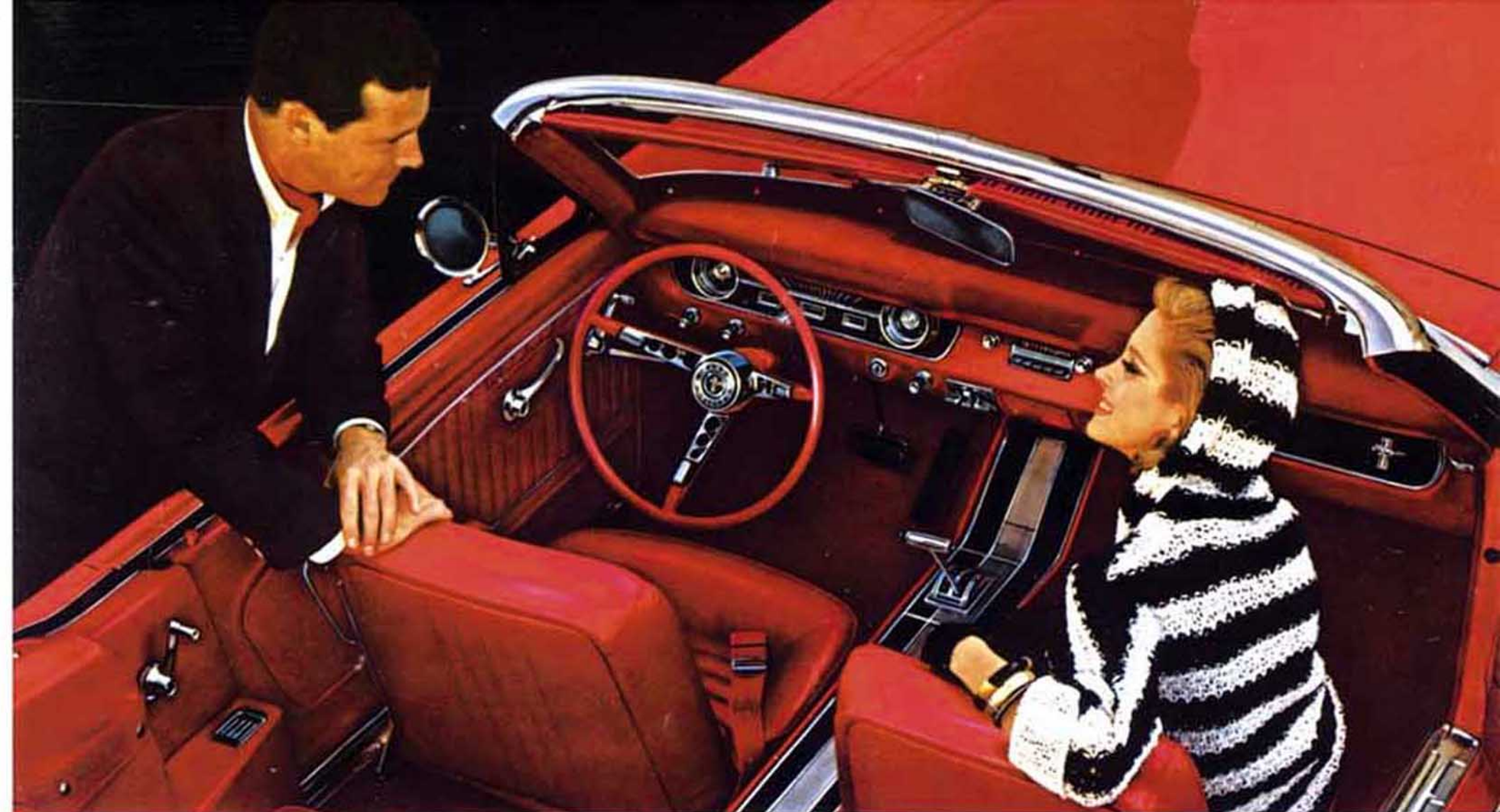
Rally Pac (tachometer and electric clock)