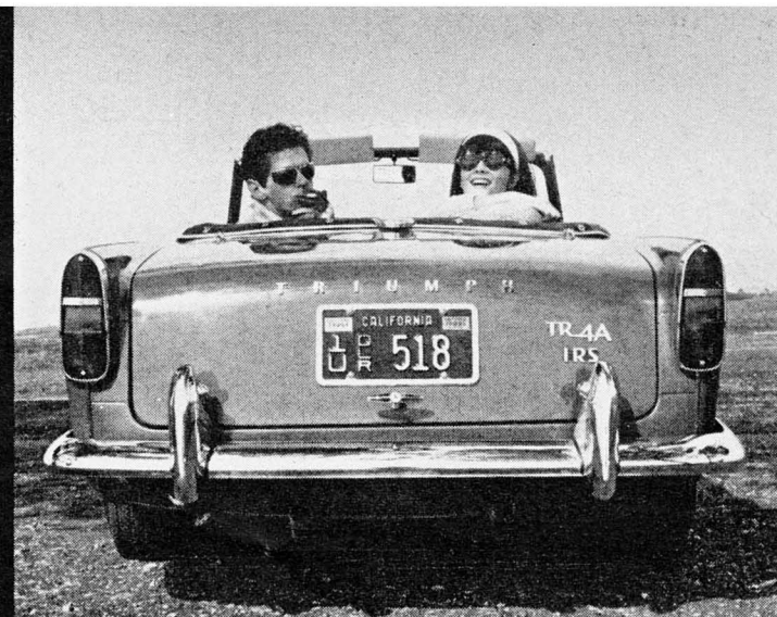
Newcomers: one from the Shelby stable of high-speed pets (see page 62) and another from Merry Old England (see page 39)