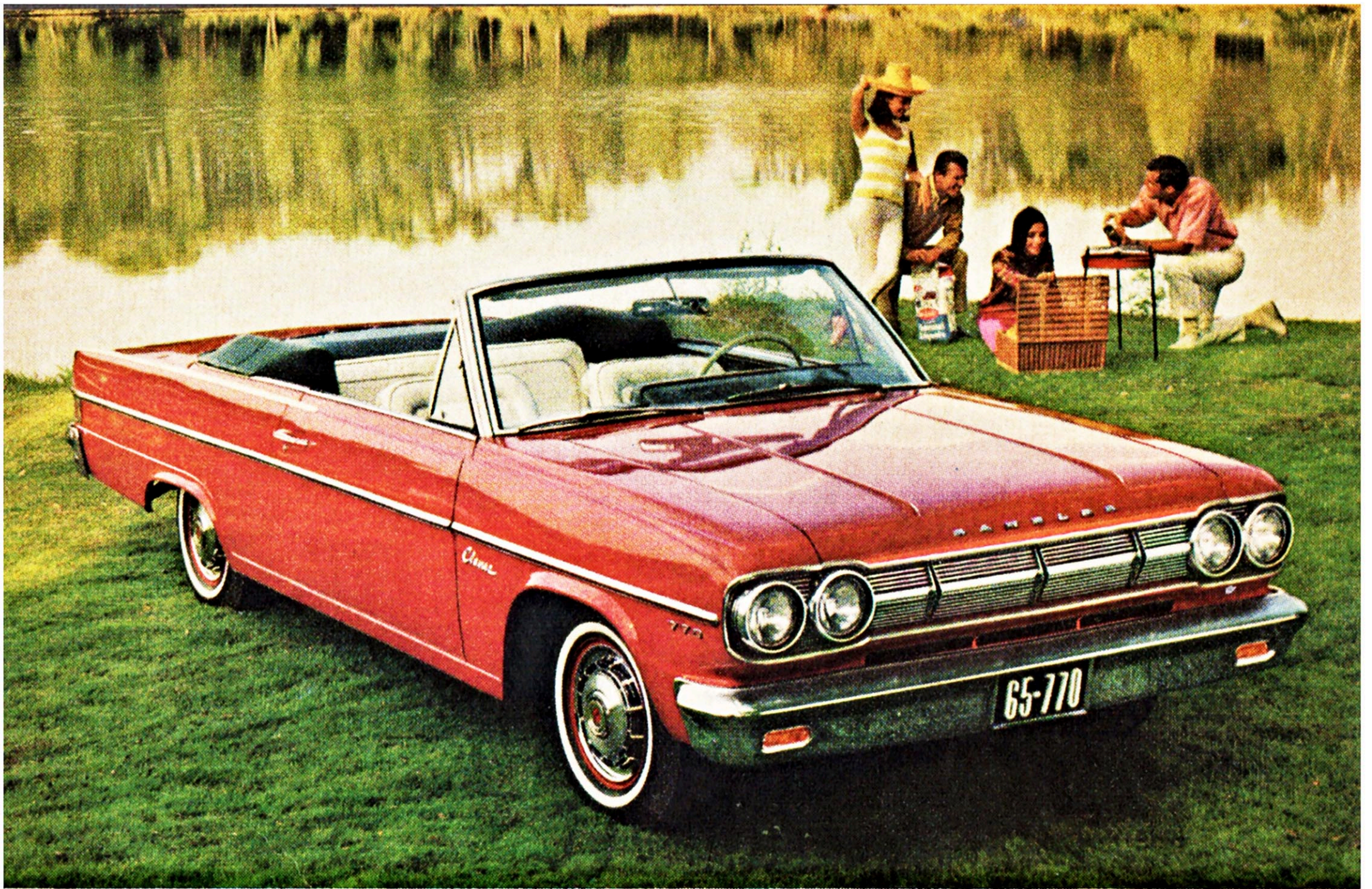
1965 Rambler Classic. New power, new space, all-new Convertible. 10 other models.