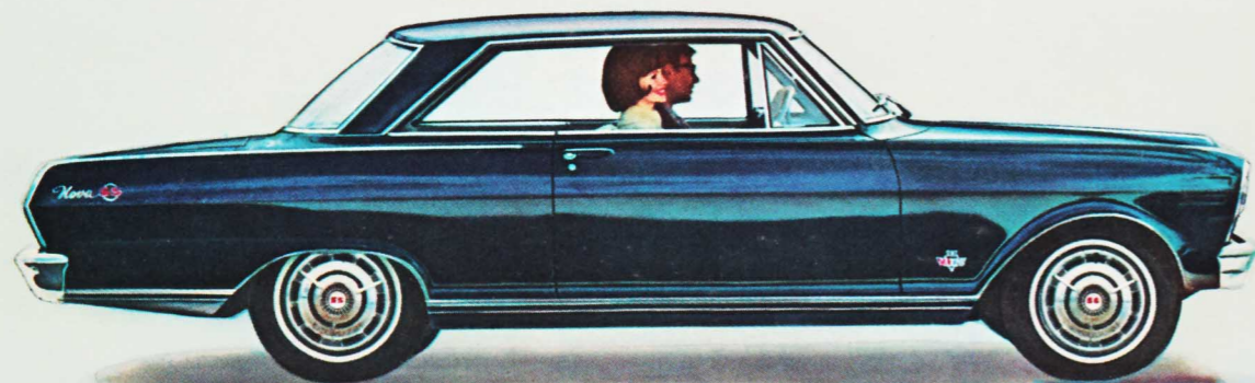
'65 Chevy II Nova SS Coupe