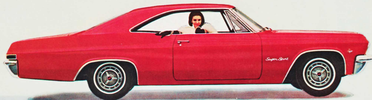
'65 Chevrolet Impala SS Coupe