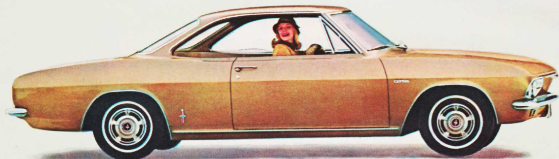
'65 Corvair Corsa Sport Coupe