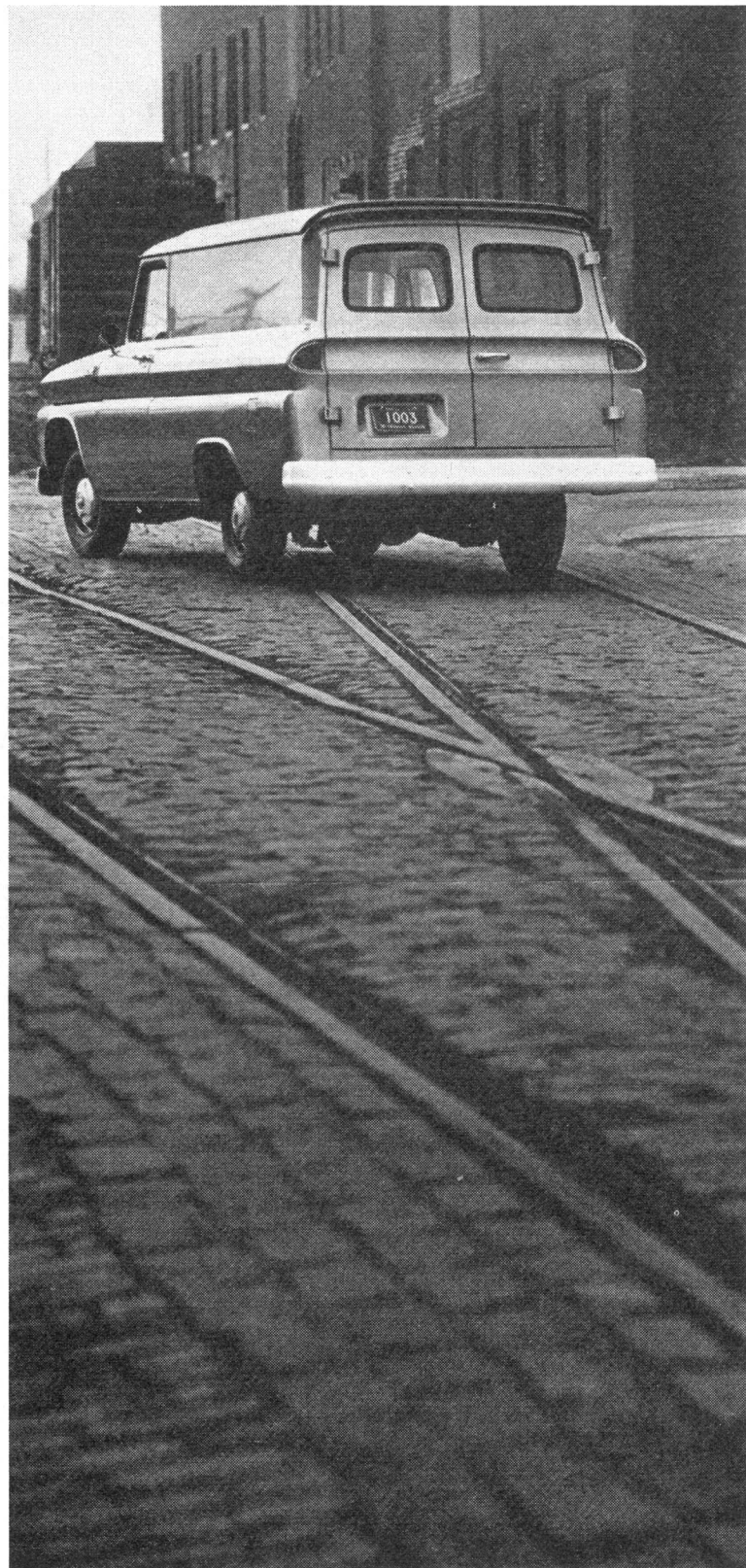
Chevrolet 1/2-ton panel delivery