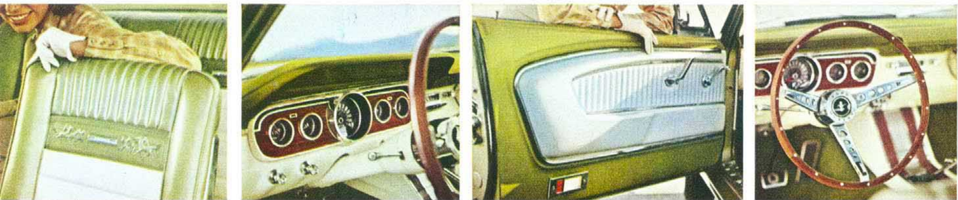
Handsome inserts of embossed vinyl New luxury instrument panel New integral arm rests—courtesy lights New sports steering wheel

Make any Mustang as luxurious as you want —with special new interior options!