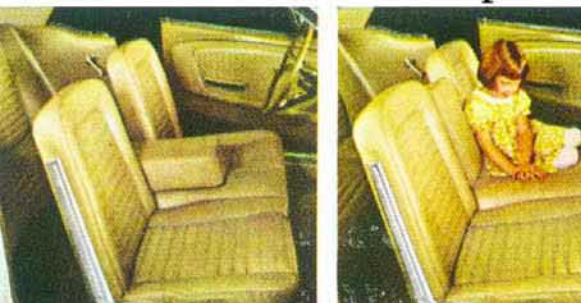
Fold it down! You get a big, wide arm rest Fold it up! And you get a full-width front seat