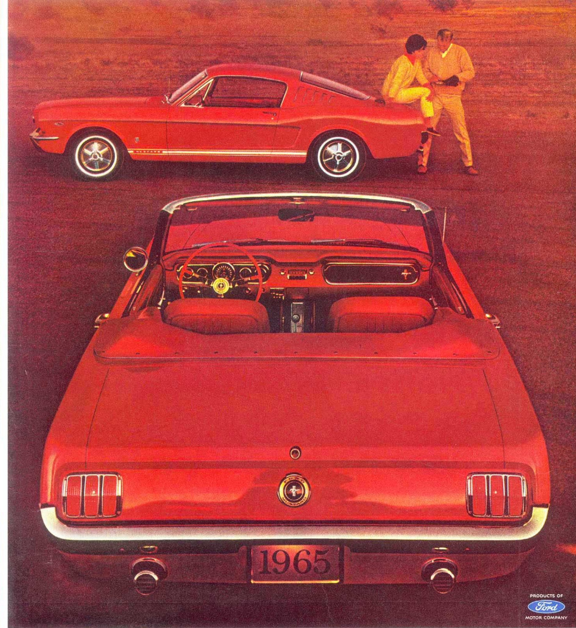
PRODUCTS OF Ford MOTOR COMPANY