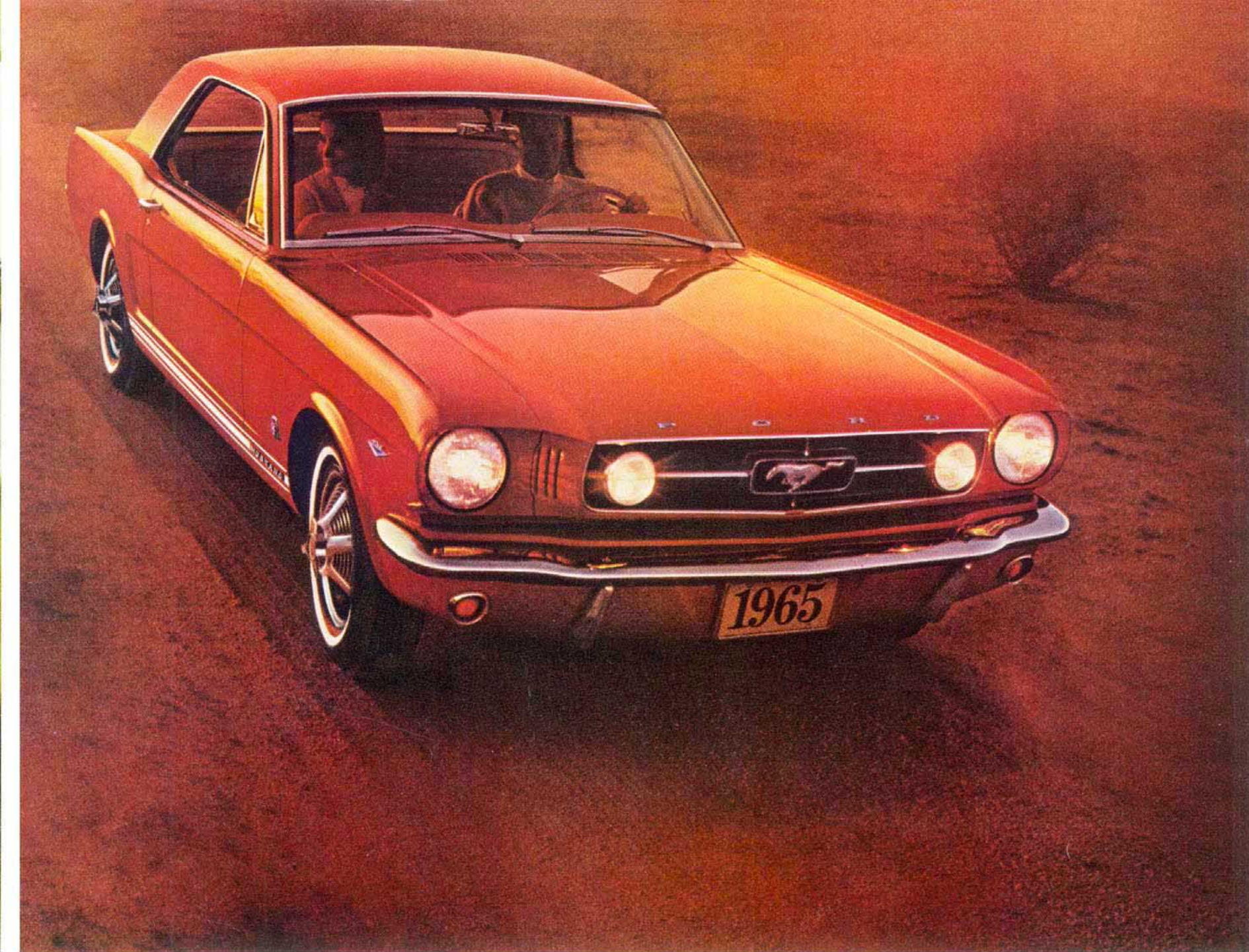
Mustang hardtop with fog lamps built into new grille

New GT performance package for the Mustang of your choice: hardtop, convertible, or 2+2!