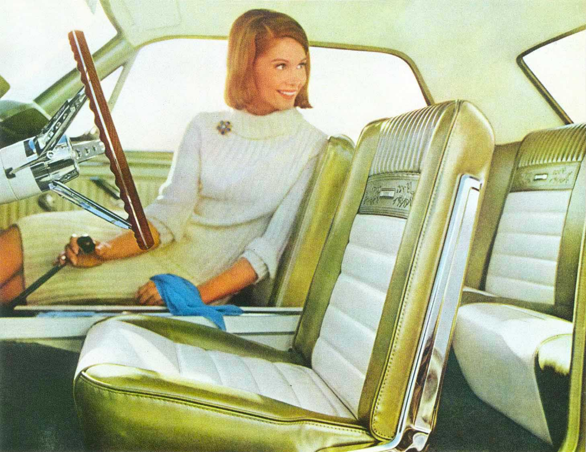
New luxury interior for Mustang

Make any Mustang as luxurious as you want —with special new interior options!