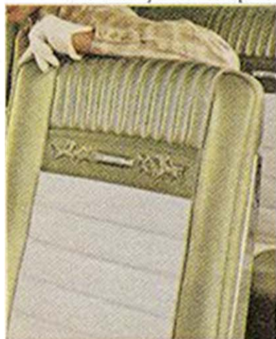
Handsome inserts of embossed vinyl