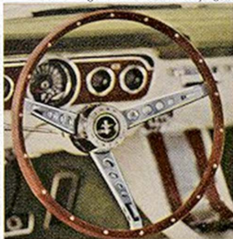
New sports steering wheel