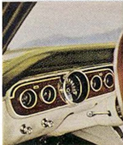
New luxury instrument panel

RIDE WALT DISNEY'S MAGIC SKYWAY AT THE FORD MOTOR COMPANY PAVILION, NEW YORK WORLD'S FAIR