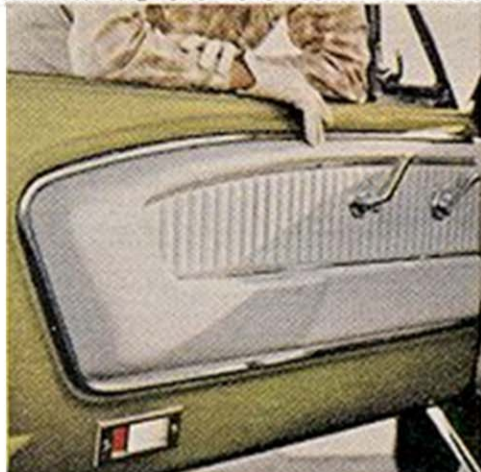
New integral arm rests—courtesy lights