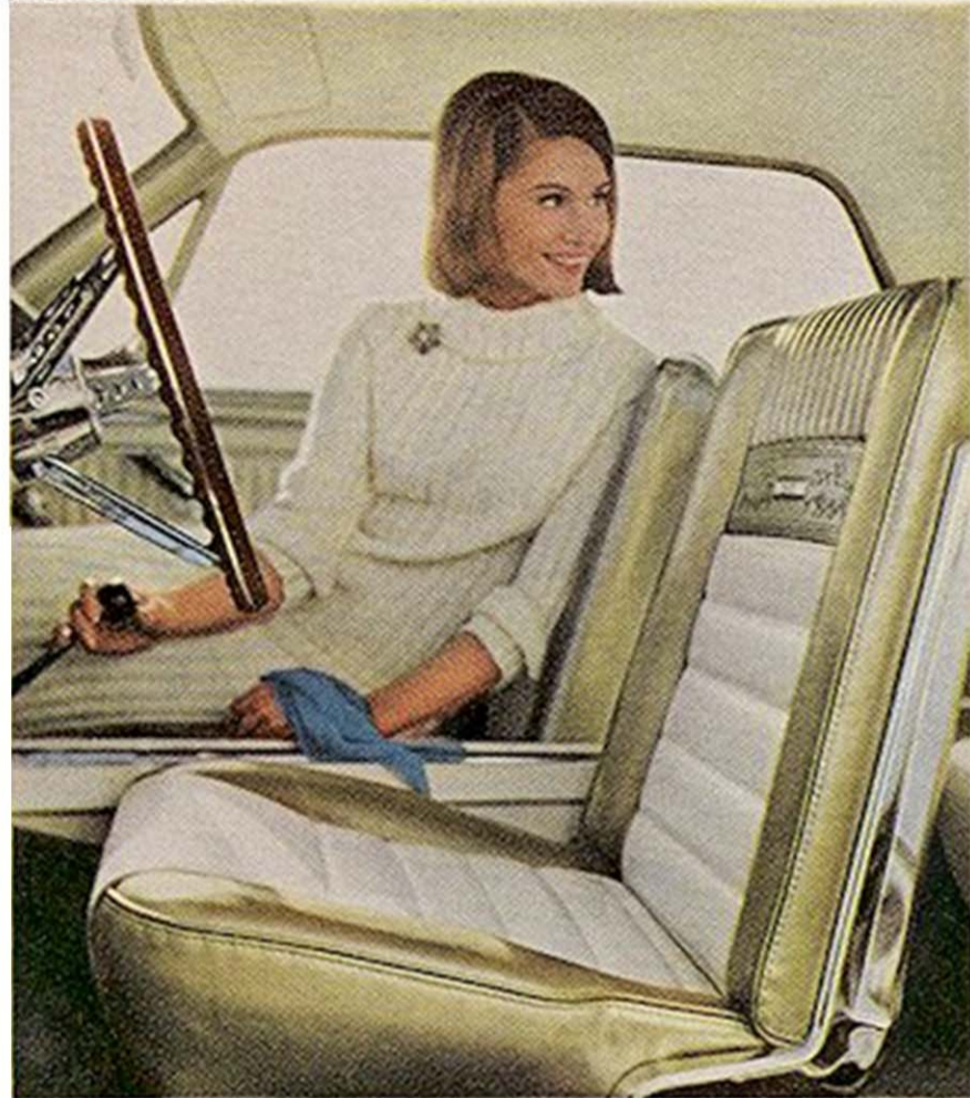
New luxury interior for Mustang