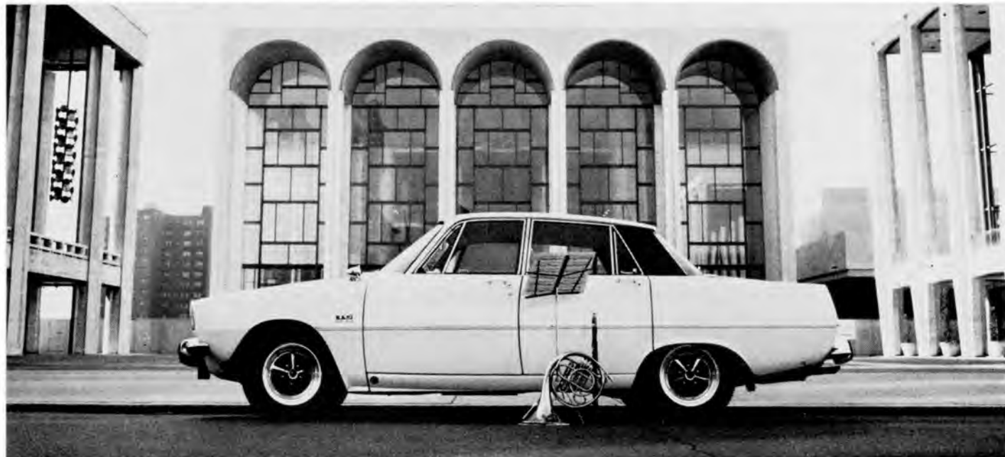
Ultra-modern Lincoln Center, ultra-modern Rover 2000 TC. We like Lincoln Center, love the Rover. See why on page 28.