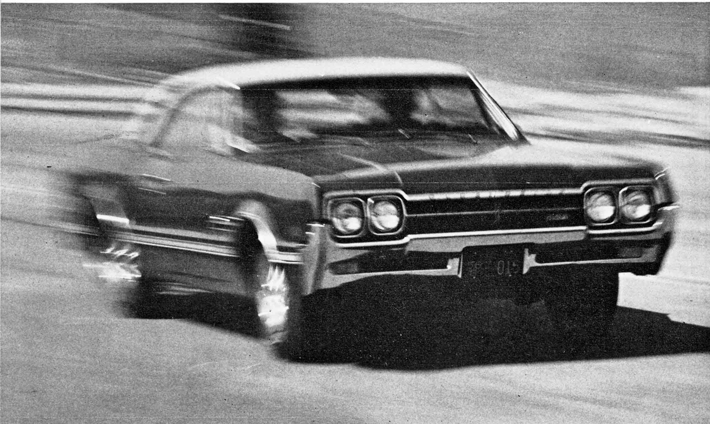
UNCORKING PERFORMANCE-PACKAGED 4-4-2 BRINGS INSTANT ACCELERATION AT ANY SPEED — VERY HANDY FOR PASSING ON 2-LANE ROADS.

Probably as a result of collusion between the marketing and fiscal members of the committee, the car is to be full-sized, competitively priced, and as far as possible, be all things to all people. The fiscal man, who doesn't know beans about engineering and couldn't care less about any form of racing, had insisted that the car be quiet, not temperamental, and under no circumstances was it to