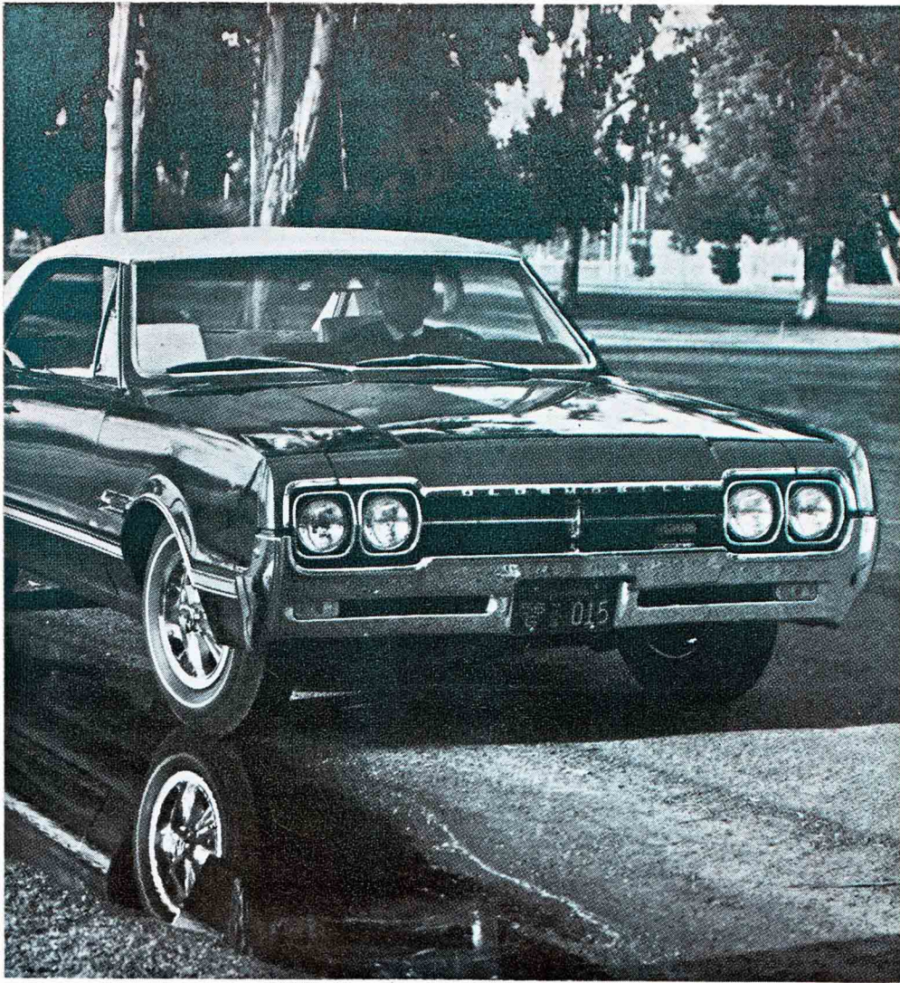
Custom wheels mirrored in pool come from Hurst, go especially well with 4-4-2.

Other than carbs, intake manifold and brakes, the rest of our test car was pretty much standard 4-4-2, including the rear anti-sway bar. Attached to the trailing arms and passing under the differential,