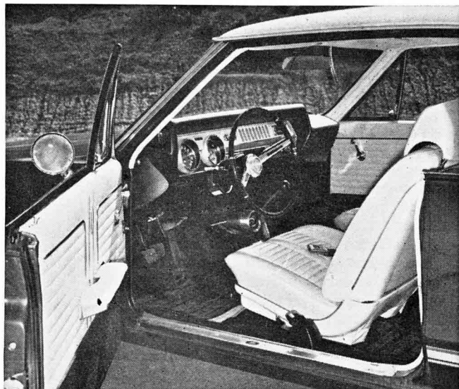
Test car had two comfortable bucket seats with head rests plus host of comfort and convenience items to make it very livable.