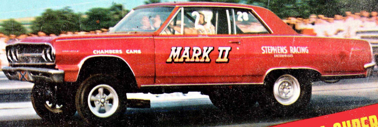
Stephens Racing Chevelle