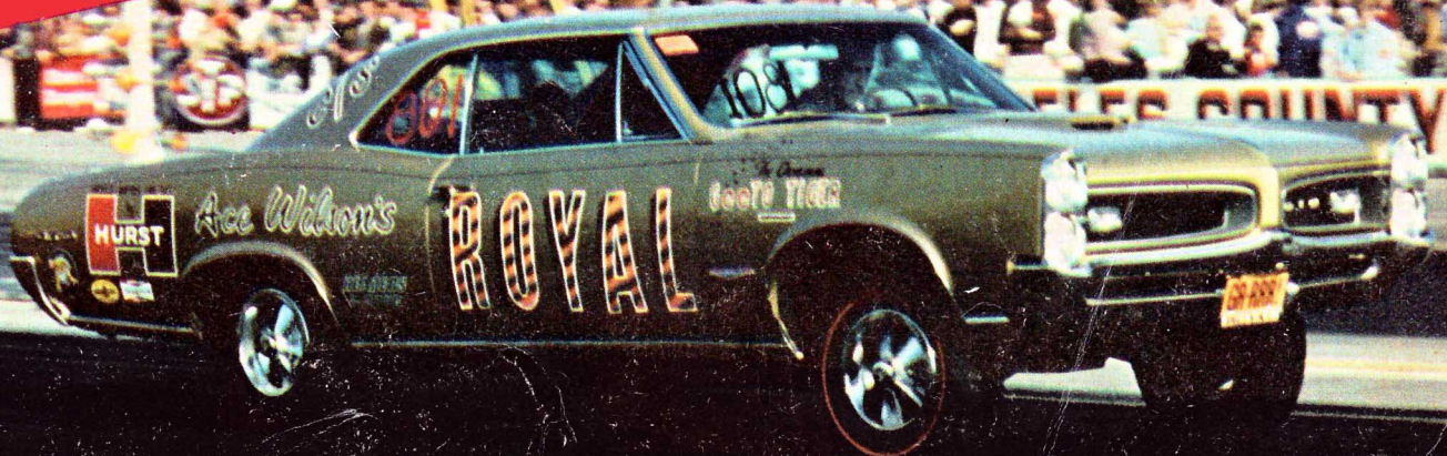
Royal Pontiac GTO

HUNTINGTON TELLS: LOW $ DRAGGING * HOW TO BUY A SUPERCAR!