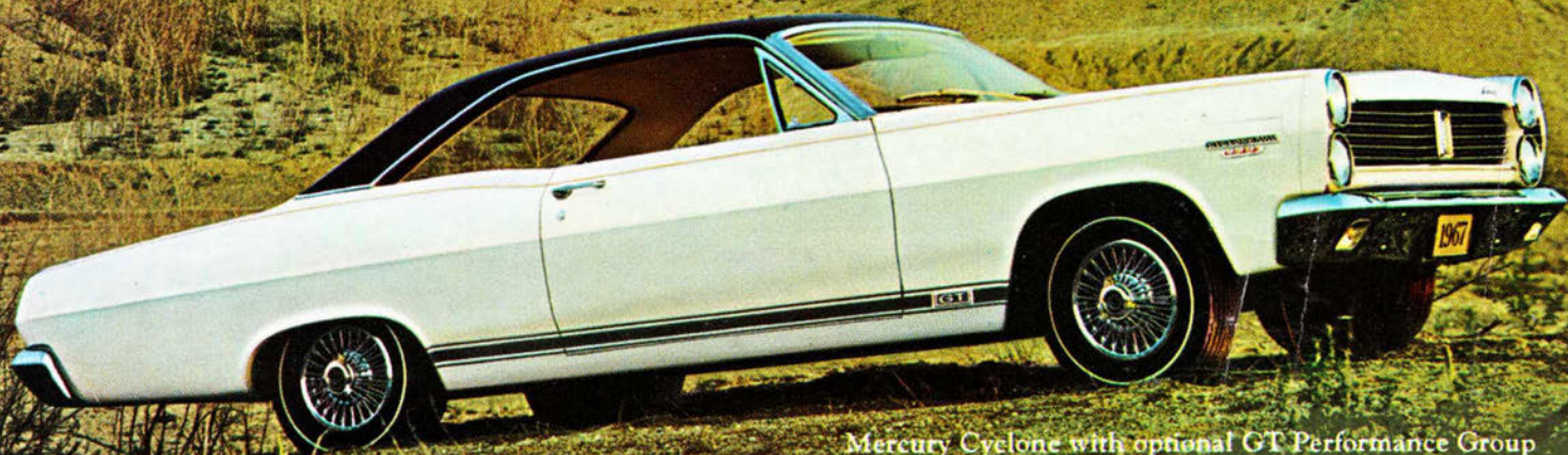
Mercury Cyclone with optional GT Performance Group