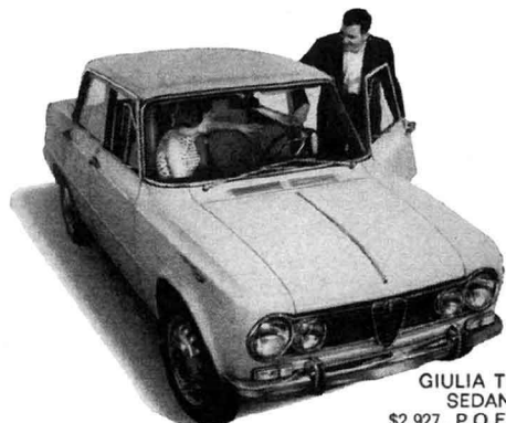
GIULIA TI SEDAN $2,927. P.O.E.

Winning races has been a steady diet at Alfa since 1911. You can see it reflected in the new Giulia TI. A 4-door, 5-passenger sports car with five-forward-speeds (fully synchronized), all aluminum engine and double overhead cams. It's easily capable of over 105 m.p.h. and 31 miles to the gallon. At 80 m.p.h. you're using only half the engine's power.