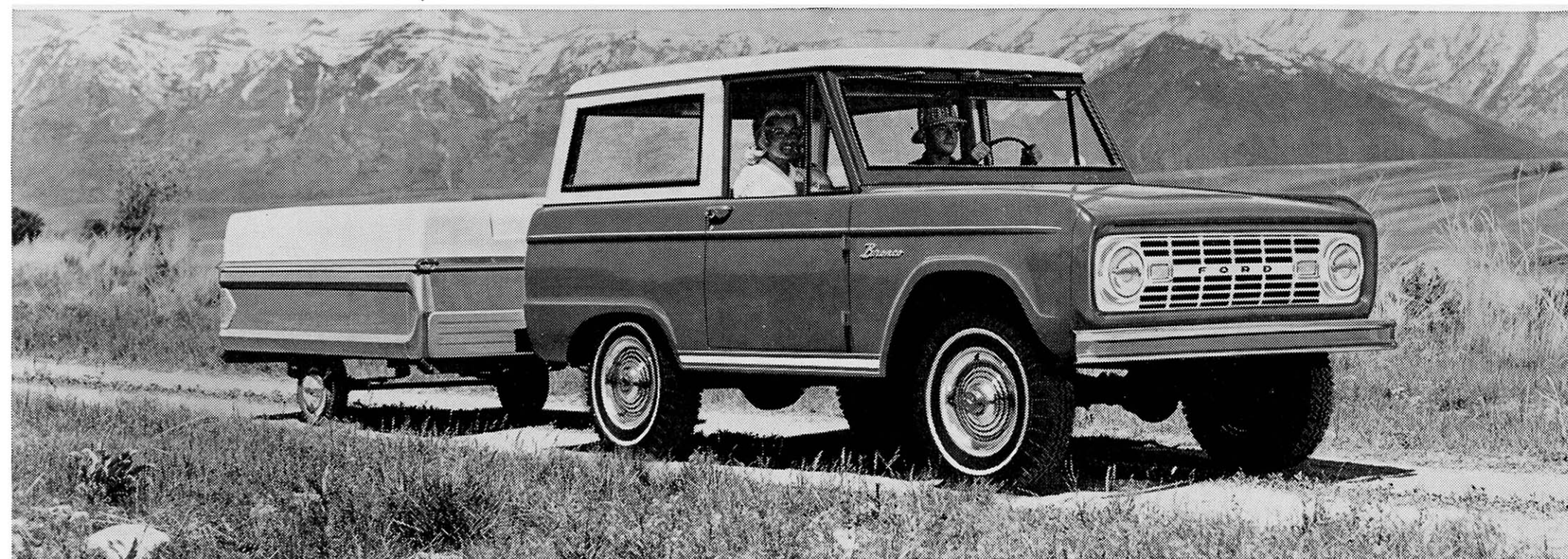
BRONCO WAGON . . . Fully enclosed wagon provides 68.3 cu. ft. of space for camping gear and luggage. Front bucket seats and rear bench seat are optional. Short-roof Sports Utility model available. Powerful heater and defroster also available.