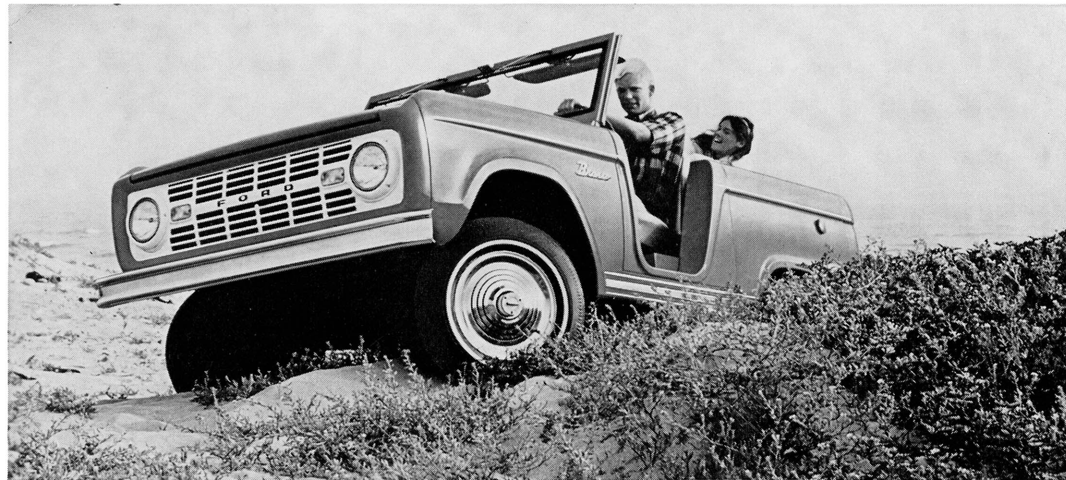
BRONCO ROADSTER . . . Fun-loving open sports model with a windshield that can be folded flat and secured to hood. A convertible vinyl top with metal or vinyl doors is available. All Bronco models have 92-in. wheelbase, wide one-hand-operated tailgate, and big 14.5-gallon fuel tank.