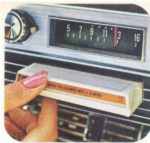
The multi-speaker Stereo Tape/AM Radio System comes as integrated unit, built into the instrument panel. Plays over 70 minutes of uninterrupted music.