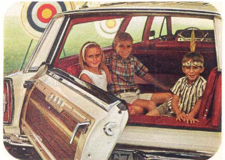
The dual-action Magic Doorgate swings out for people, swings down for cargo... and these dual-facing rear seats let the big Ford wagon seat a family of ten comfortably.