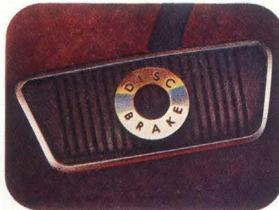
Front power disc brakes are available. They provide surer stops, also run cooler and resist fading.