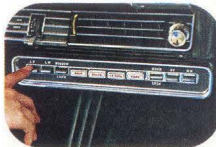
Convenience Control Panel option warns you of low fuel, door ajar. Locks all doors automatically at 8 m.p.h. Reminds you to fasten seat belts.