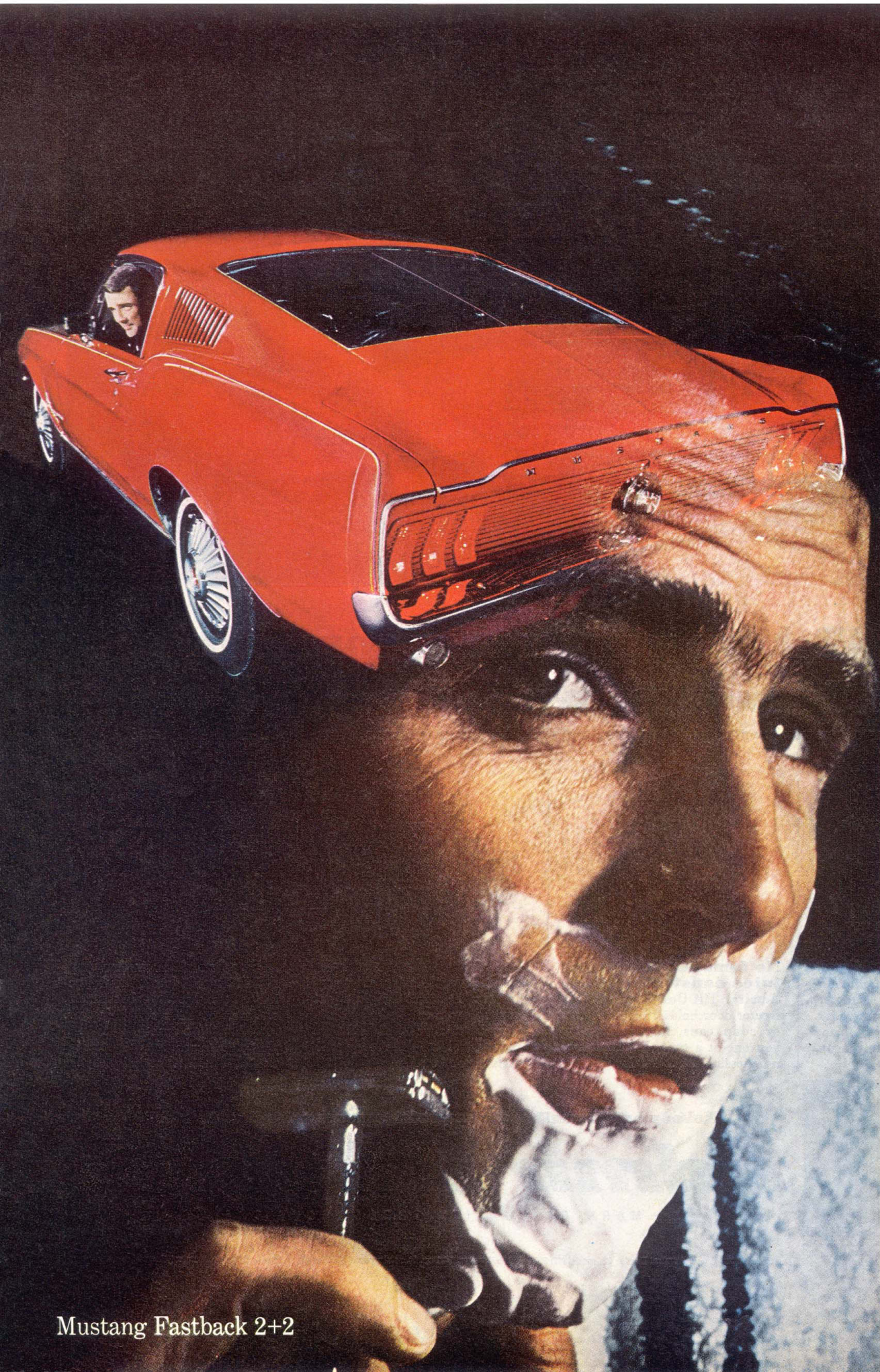
Mustang Fastback 2+2

Mustang. Thunderbird. Lincoln Continental Coupé. And the new Cougar. The 1/2 cars. Look 'em over...all of 'em. You'll recognize yourself in one of 'em. Slide behind the wheel and you'll say: "This is me! " Drive one and they'll say: "That's him." Look...you've lived this long...worked that hard...isn't it about time you had something you can call your very own? Something you can build yourself into? Something with features, engines and bodies...options that make your car you...on wheels. You've come to the right cars. The 1/2 cars. Made by us. And only us. Ford Motor Company. Ford has a better idea...the 1/2 cars, cars that are 1/2 car...1/2 you.