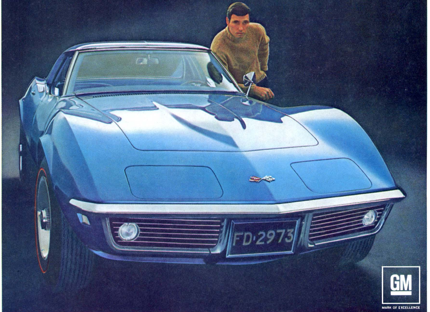
Corvette Sting Ray Coupe, Sports Class winner of Motor Trend's 1968 Achievement Award