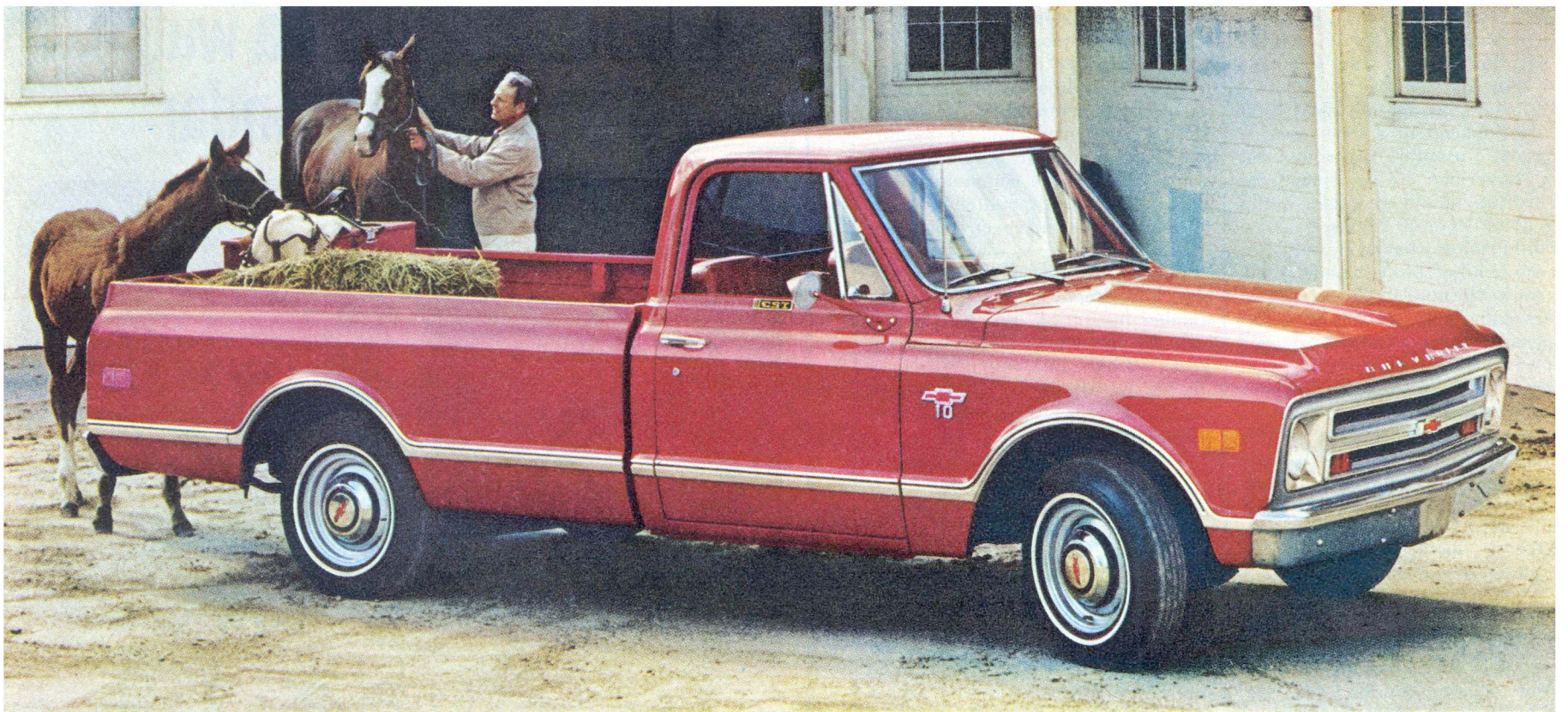
Half-ton CST Fleetside pickup