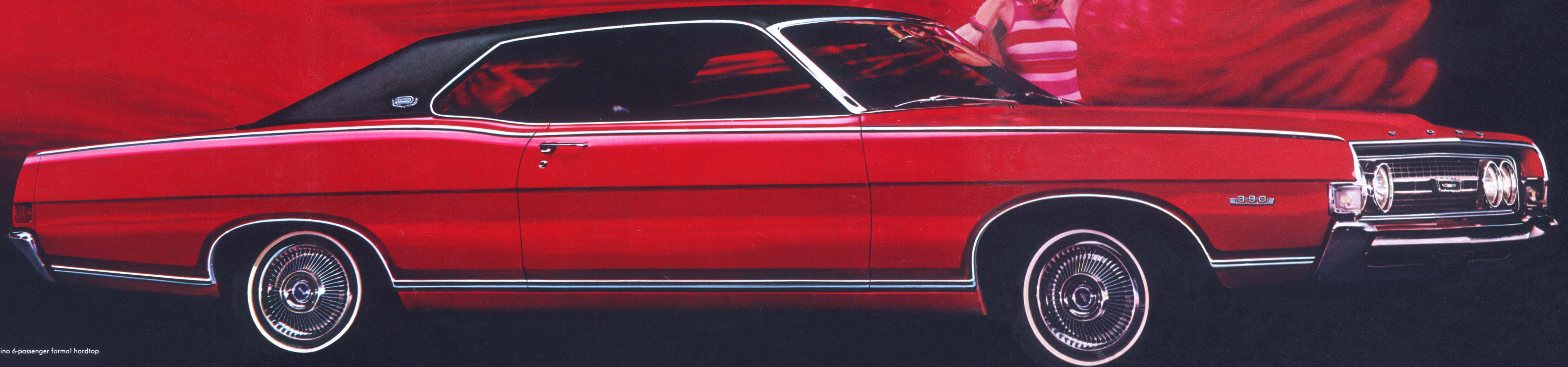
Torino 6-passenger formal hardtop