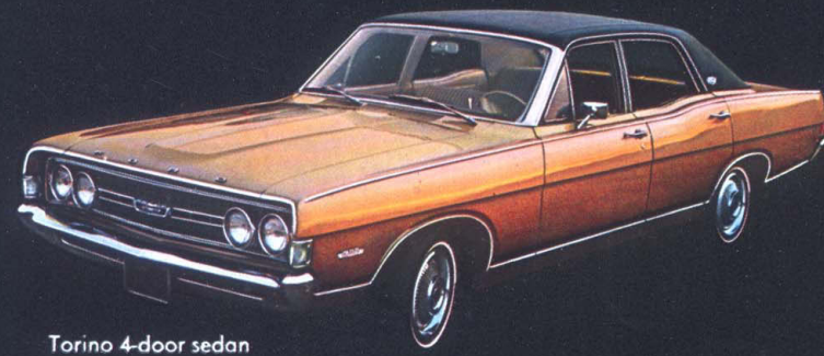
Torino 4-door sedan

Six beautiful models! Six-passenger size! Exciting style! Surprising low price!