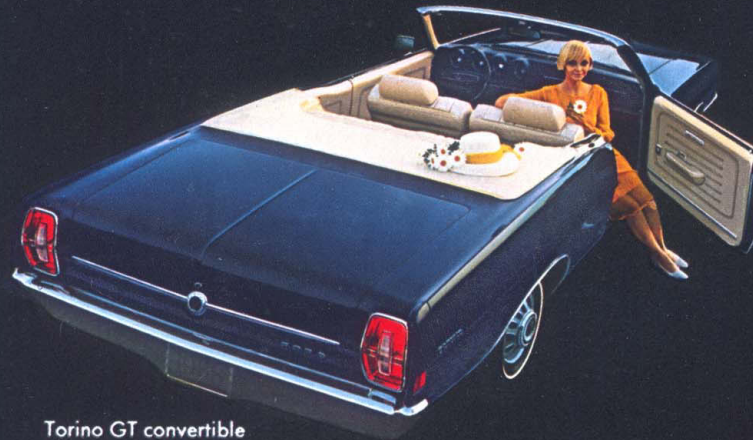
Torino GT convertible