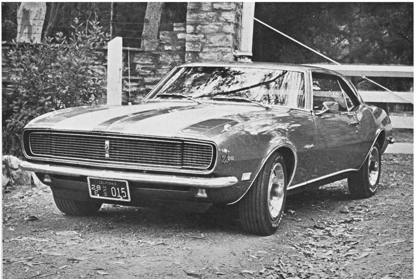
The road-hugging suspension gives good road-holding and very little body roll.