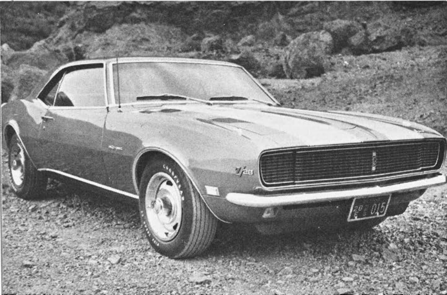
Even subdued, the big Z looks like a sleeping lion.

We'd like to see more of this type of machinery from Chevrolet.