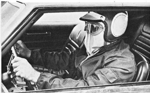
Sure we're kidding, but the Camaro's performance is outstanding.