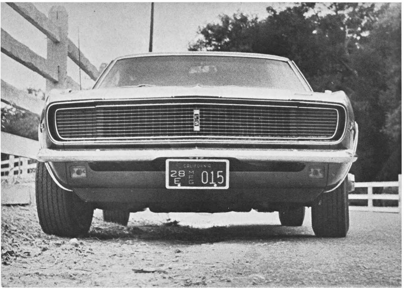
Camaro's basic kinship to a sports car is shown by its wide stance stability.