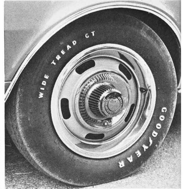
Disc brakes up front, along with Goodyear wide tread, add to the Z-28's handling.