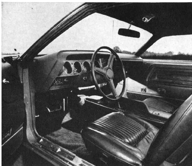
Interior design of the SE version is plush and well planned. Leather seats add distinctive touch. Instrumentation's good.