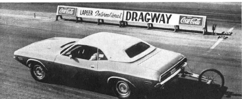
At Lapeer Dragway, 383 performed well, despite air conditioning and numerous power options. The 340 proved better.