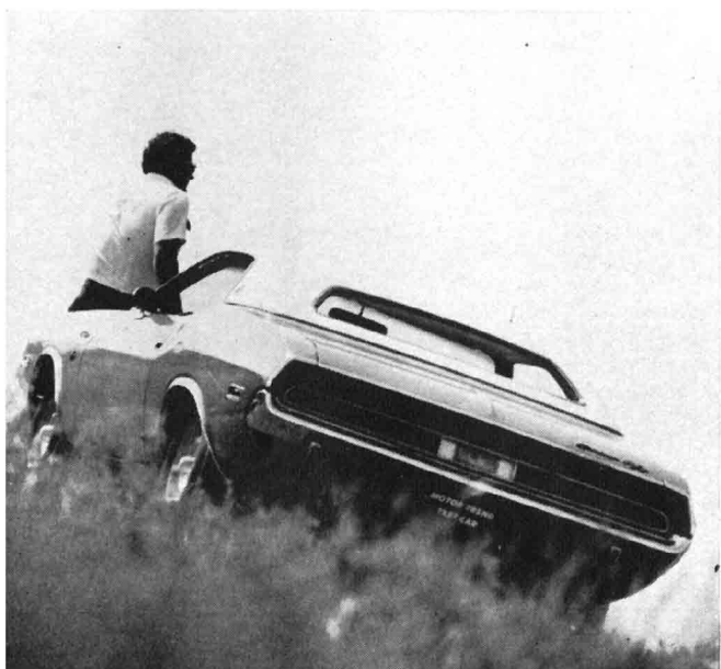
1970 Challenger R/T - SE: Optional equipment as tested - prices not available at time of test. 1. Leather bucket seats 2. Light group 3. Power brakes - front disc 4. Center console 5. Left side 6-way manual seat adjustment 6. Automatic transmission 7. Sure-Grip differential 8. 383 4-bbl. V8 engine 9. Tinted glass 10. Left remote-control mirror 11. Rear window defogger 12. Air conditioning 13. Bumper guards 14. Automatic speed control 15. Power windows 16. Rear speaker with stereo 17. Radio-multiplex AM-FM stereo 18. Power steering 19. White vinyl roof 20. Rallye wheels.

range. It isn't happening. Performance wasn't terrible with the car we tested, even considering it had the standard axle ratio of 3.23:1. Step up axle options are 3.55:1 and 3.91:1, either one of which would help the 383.