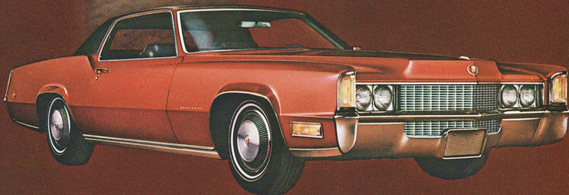
1969 Fleetwood Eldorado. Cadillac Motor Car Division

This is the 1969 Cadillac Fleetwood Eldorado with front-wheel drive. Its unique combination of beauty, performance and handling qualities has earned it recognition as the world's finest personal car. Once you drive it, you'll know why.