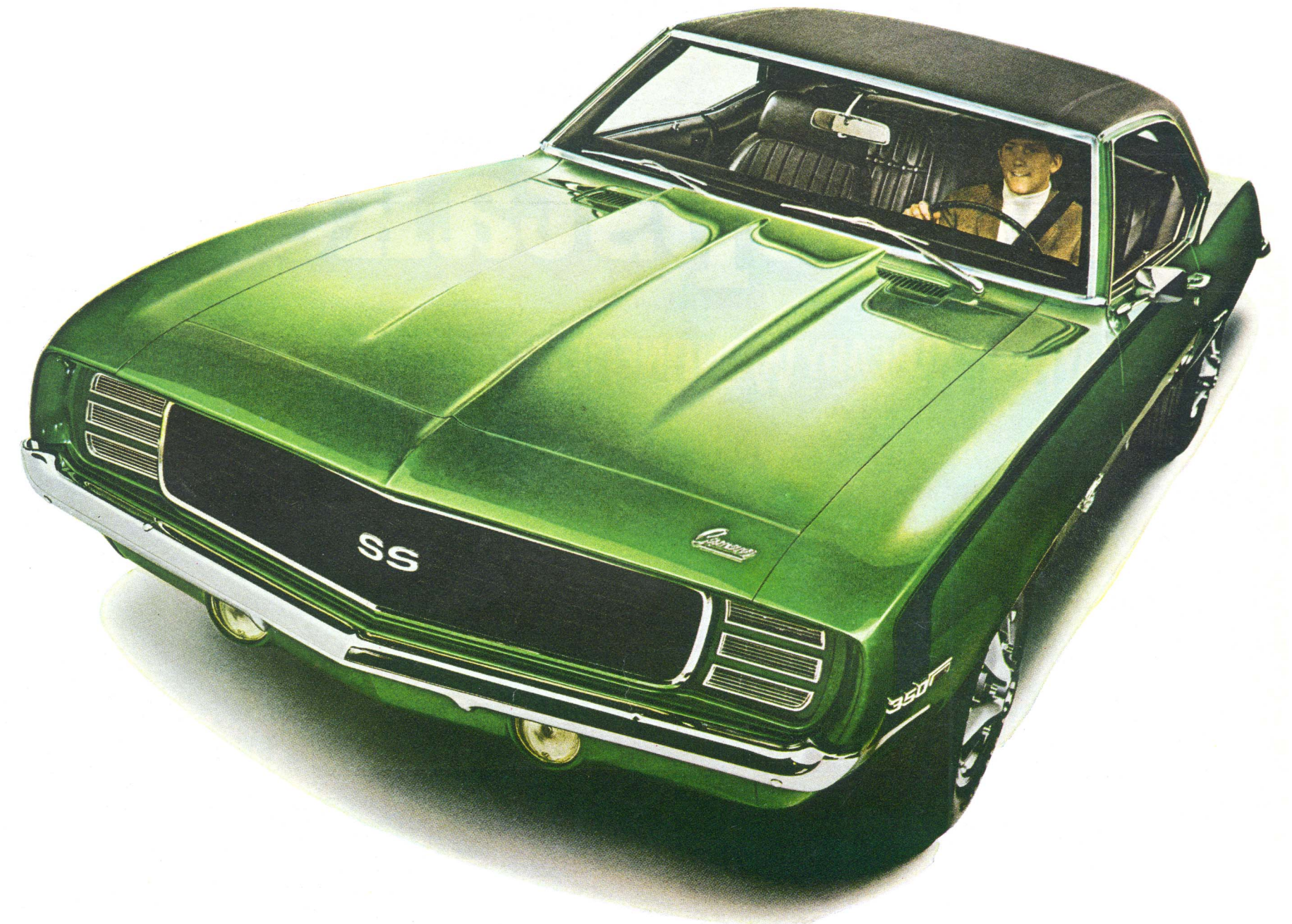
Camaro SS Sport Coupe with Rally Sport equipment and Super Scoop hood.