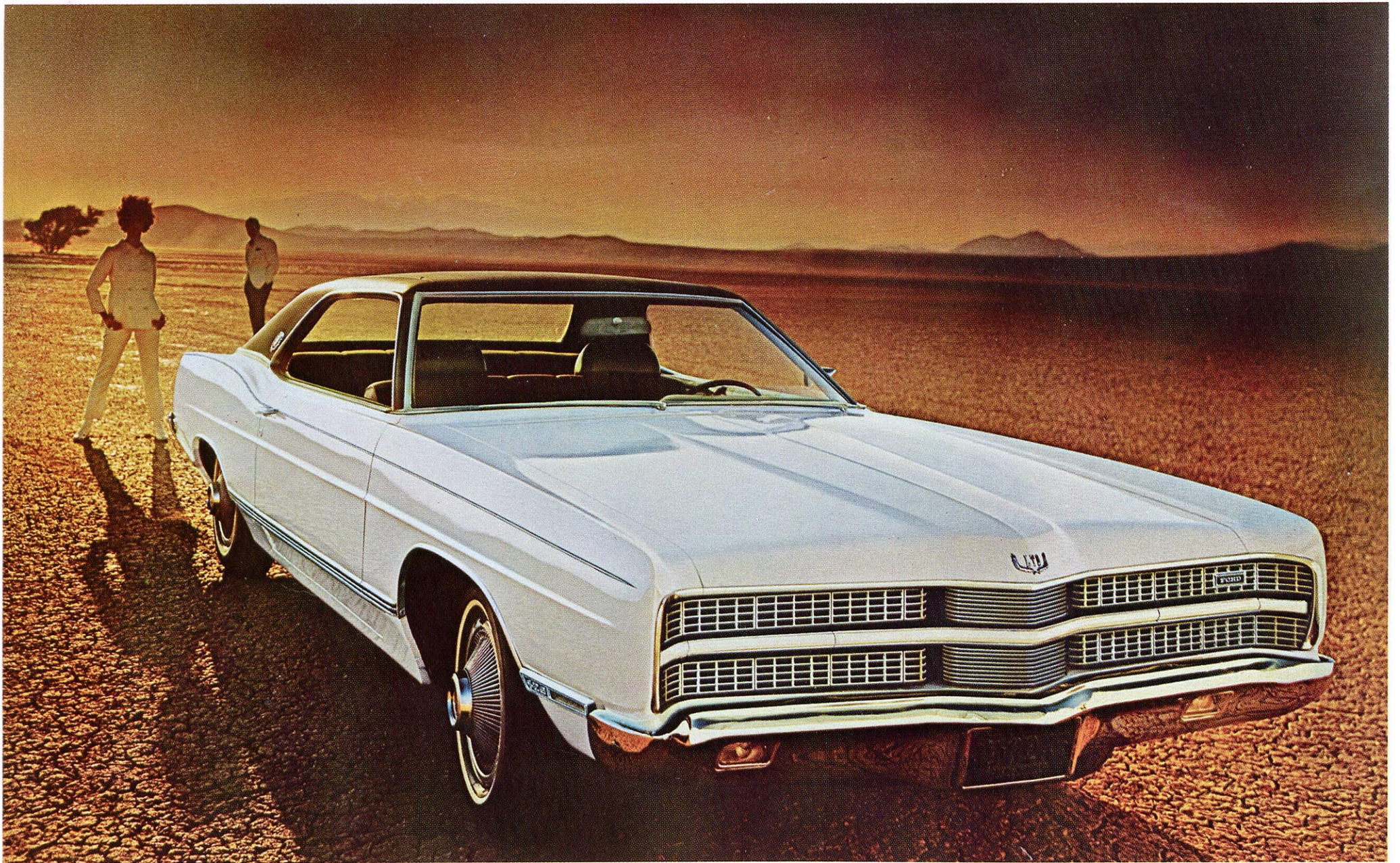
LTD by Ford—2-Door Hardtop

The 1969 Ford hugs the road with as wide a track as a Cadillac.