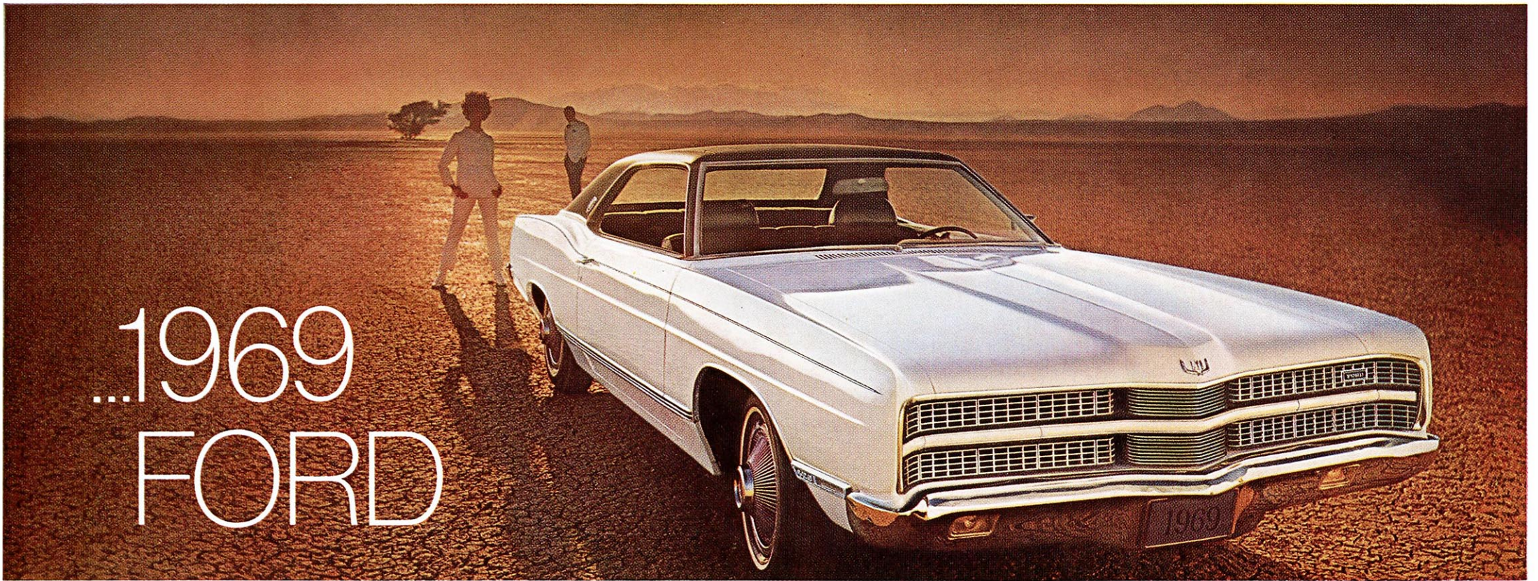
1969 LTD by Ford. 2-door Hardtop. See your Ford dealer for all the facts about the 1969 Ford, Mustang, Torino/Fairlane, Thunderbird, Falcon.

Did you mistake it for one of America's most expensive cars? Lots of people are doing that. And with good reason: