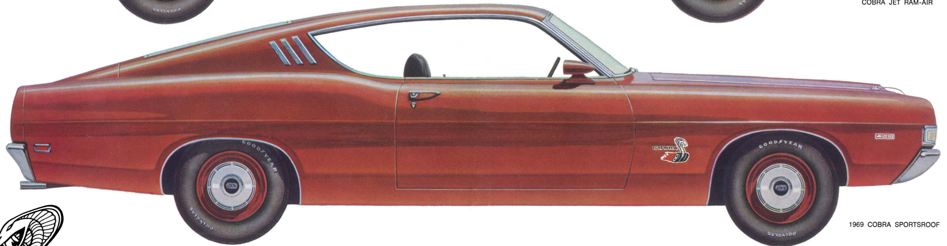
1969 COBRA SPORTSROOF