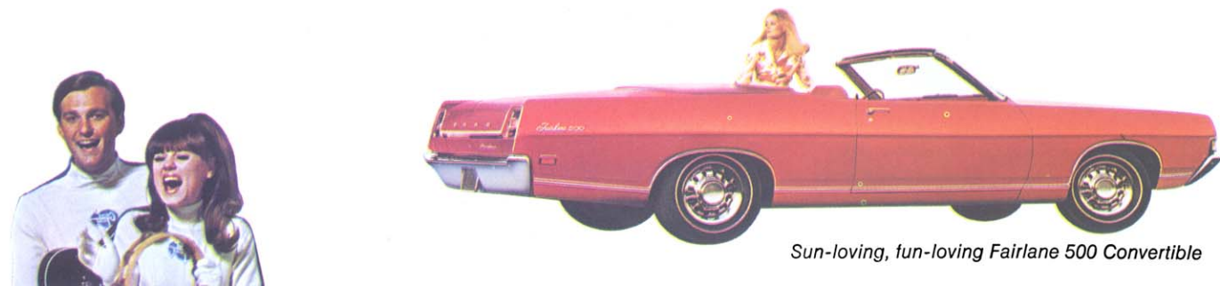
Sun-loving, fun-loving Fairlane 500 Convertible

Fairlane 500. For people who take their fun seriously.