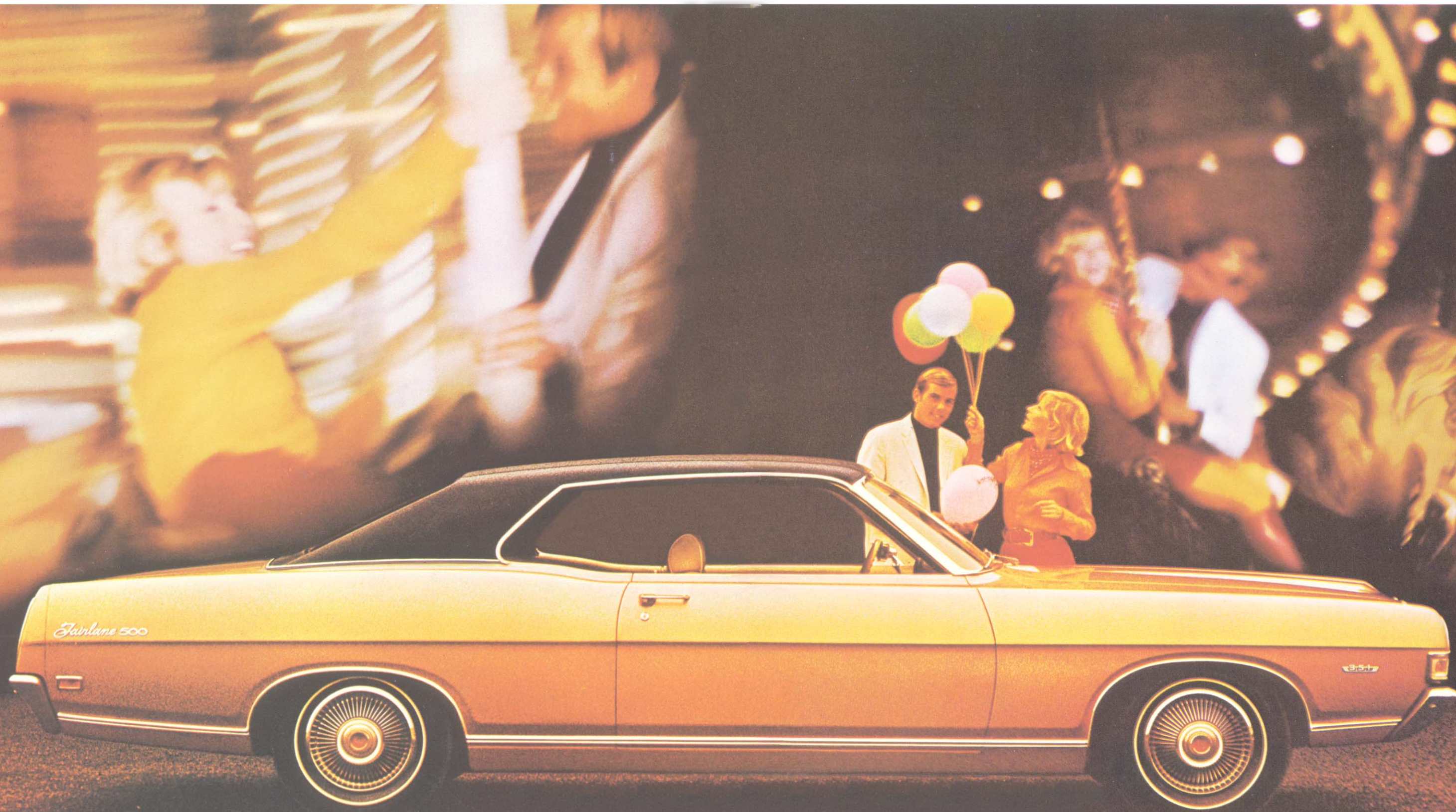
Fairlane 500 2-Door Hardtop with optional vinyl roof cover and deluxe wheel covers

Fairlane 500—the way to get to where you're going in pleasing style, luxurious comfort and at a surprisingly modest price.