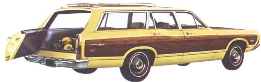
Ford Torino Squire, with Better Idea convenient two-way Magic Doorgate

1969 Ford Torino. New performance car? Or new luxury car? Yes.