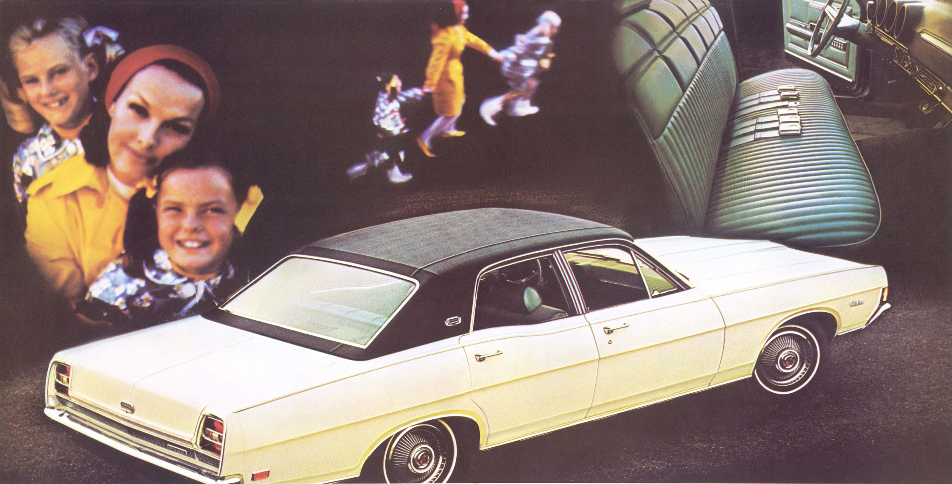
Ford Torino 4-Door Sedan—quick size, loaded with luxury, at a modest price

1969 Ford Torino. New performance car? Or new luxury car? Yes.