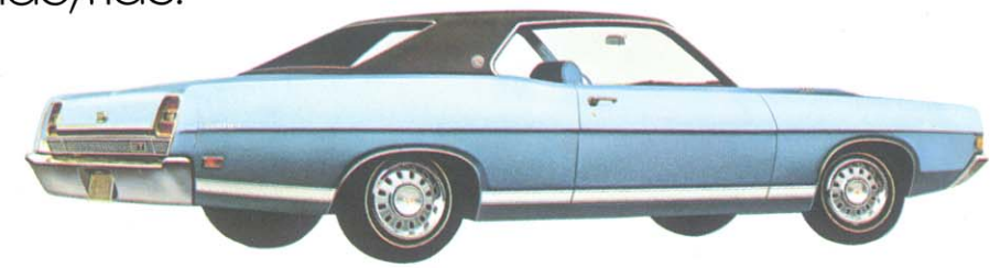
Ford Torino GT 2-Door Hardtop with luxurious leather-grain vinyl roof cover

Torino GT's—active new trio, born with a moving second-to-none approach. Two-door SportsRoof, 2-Door Hardtop, and Convertible. Take your choice.