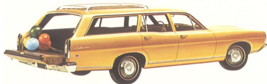
Fairlane 500 Wagon with Ford's better idea Magic Doorgate, and extra-convenient roof rack option

Everything about the Fairlane 500 says handsome, young-spirited go. Sleek lines, with bright highlights where they do the most. High-quality interiors that can take it—and keep on looking good. A good balance of power and economy under the hood. And the wagon has Ford's better idea two-way Magic Doorgate—standard!