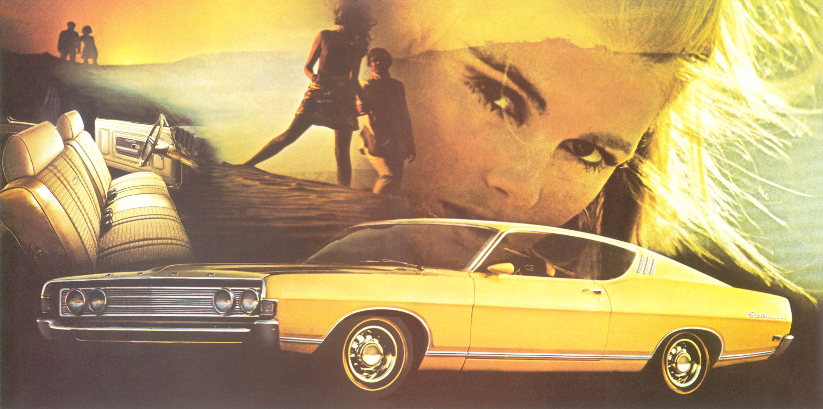
Fairlane 500 SportsRoof—striking looks, agile go, delightful comfort

Fairlane 500. More power. New style. Eager to go.