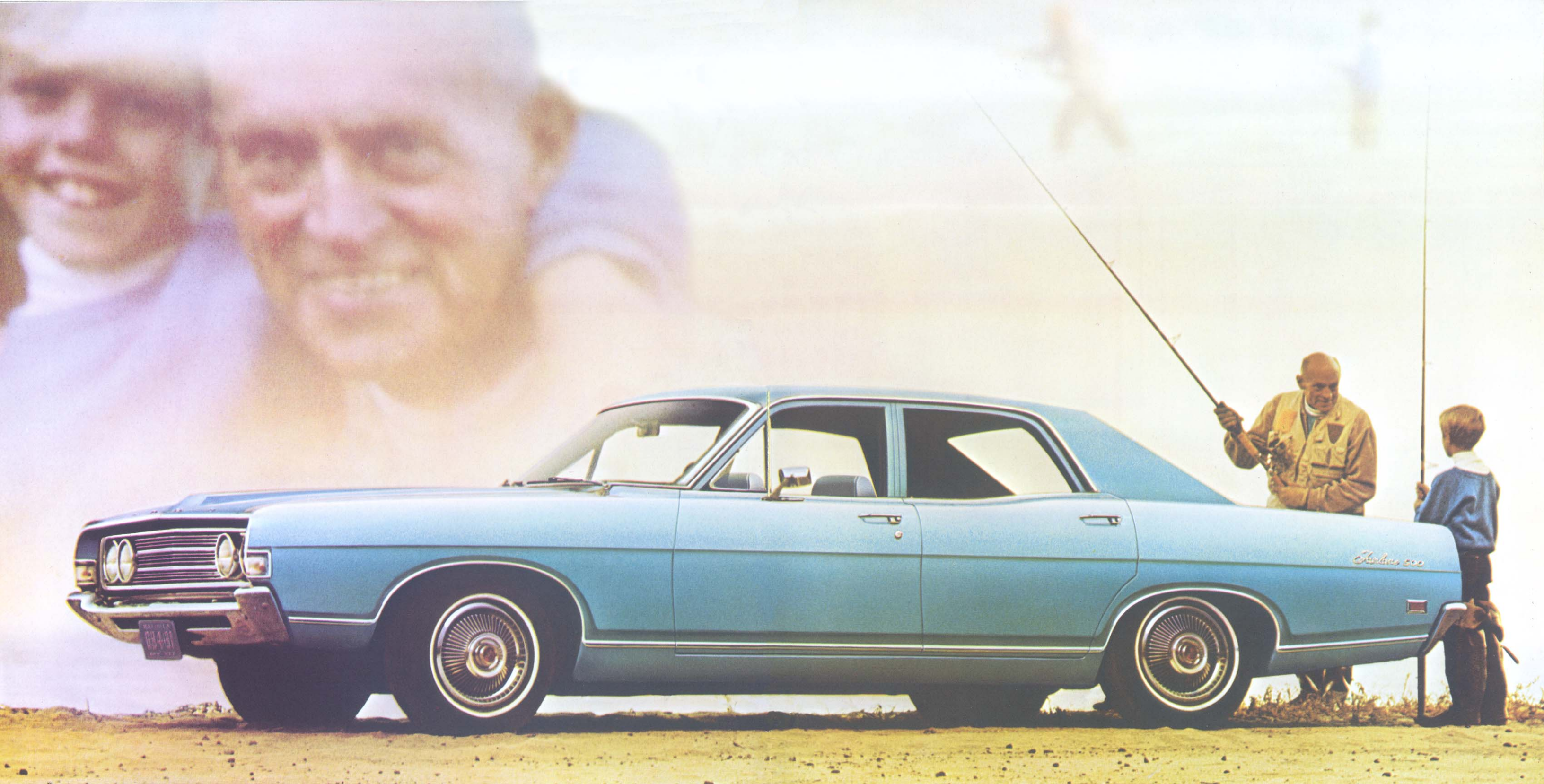
Fairlane 500 4-Door Sedan, with family convenience and country club looks

Fairlane 500. For people who take their fun seriously.