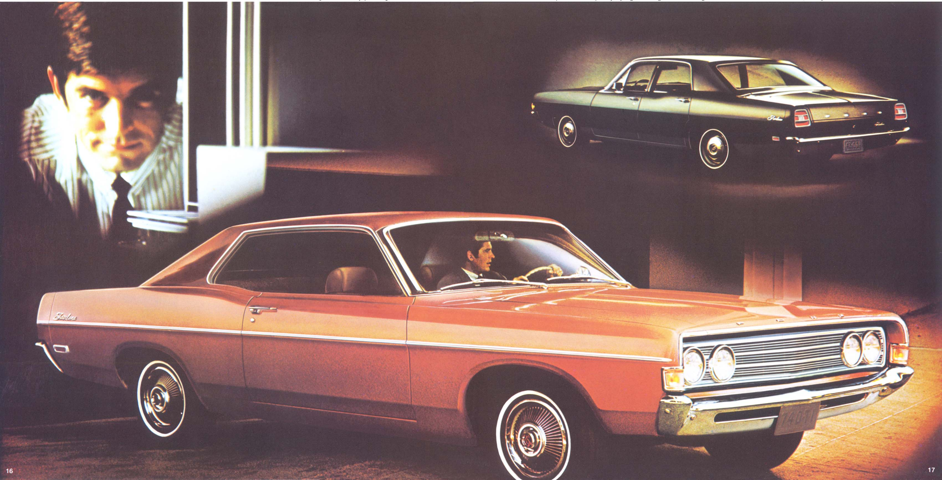
Fairlane 4-Door Sedan, roomy better idea for the value-conscious