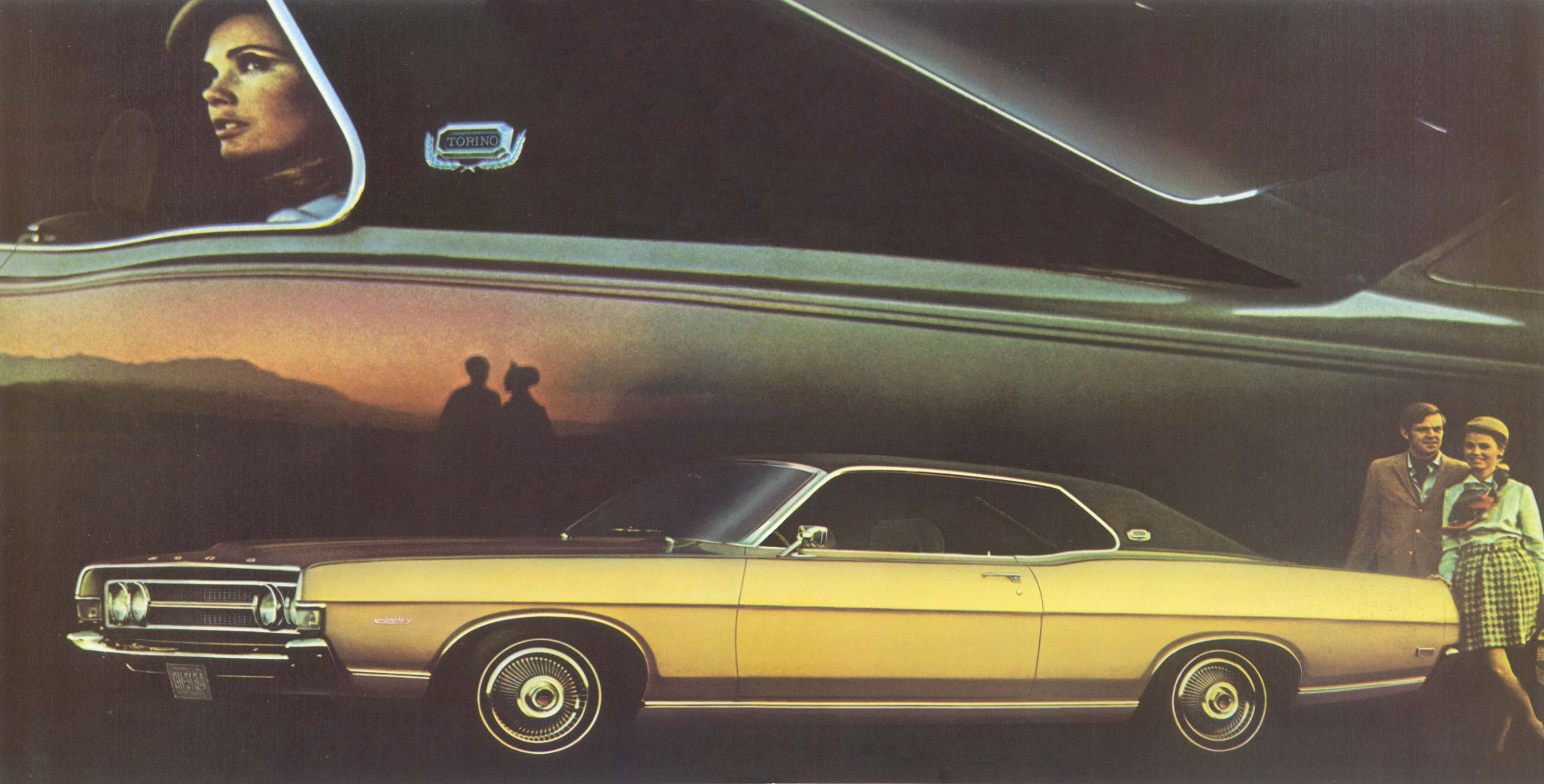
Ford Torino 2-Door Hardtop, front-runner in the intermediate field

How can anything so hot look so cool? 1969 Ford Torino.