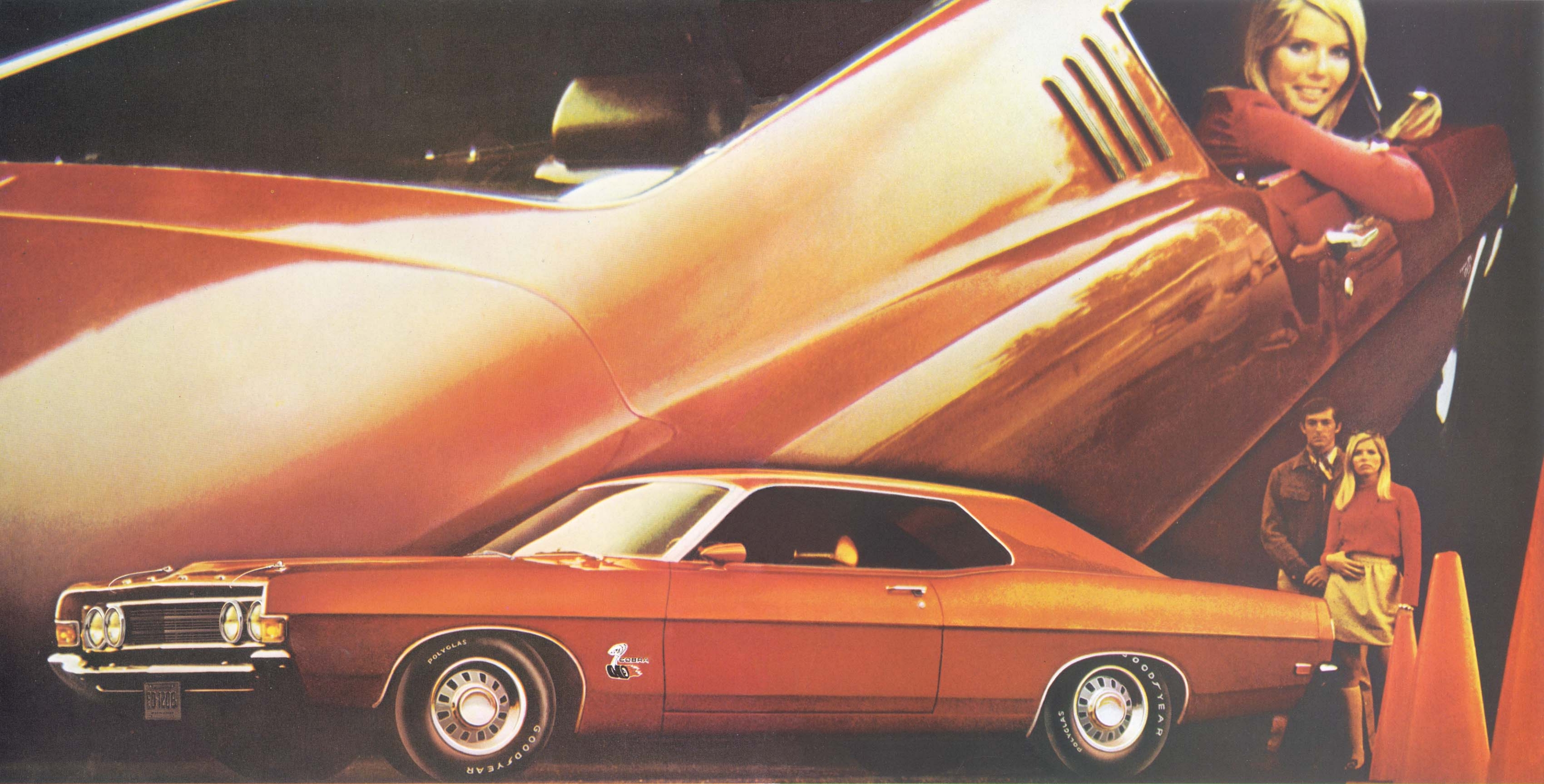
Cobra 2-Door Hardtop, born to move