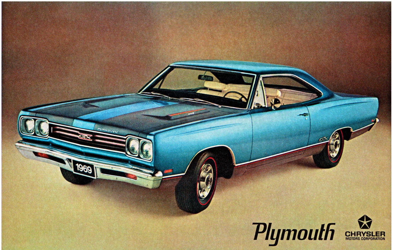
1969 Plymouth GTX

Plymouth GTX. As a member of an elite group, you crave the finer things in life. You know, the beach in the spring. The Strip. Miniskirts. Neat cars. Blood rare steaks. Things like that.