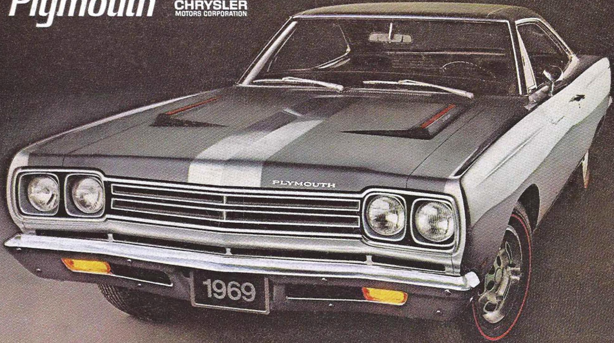
Road Runner 2-Door Hardtop