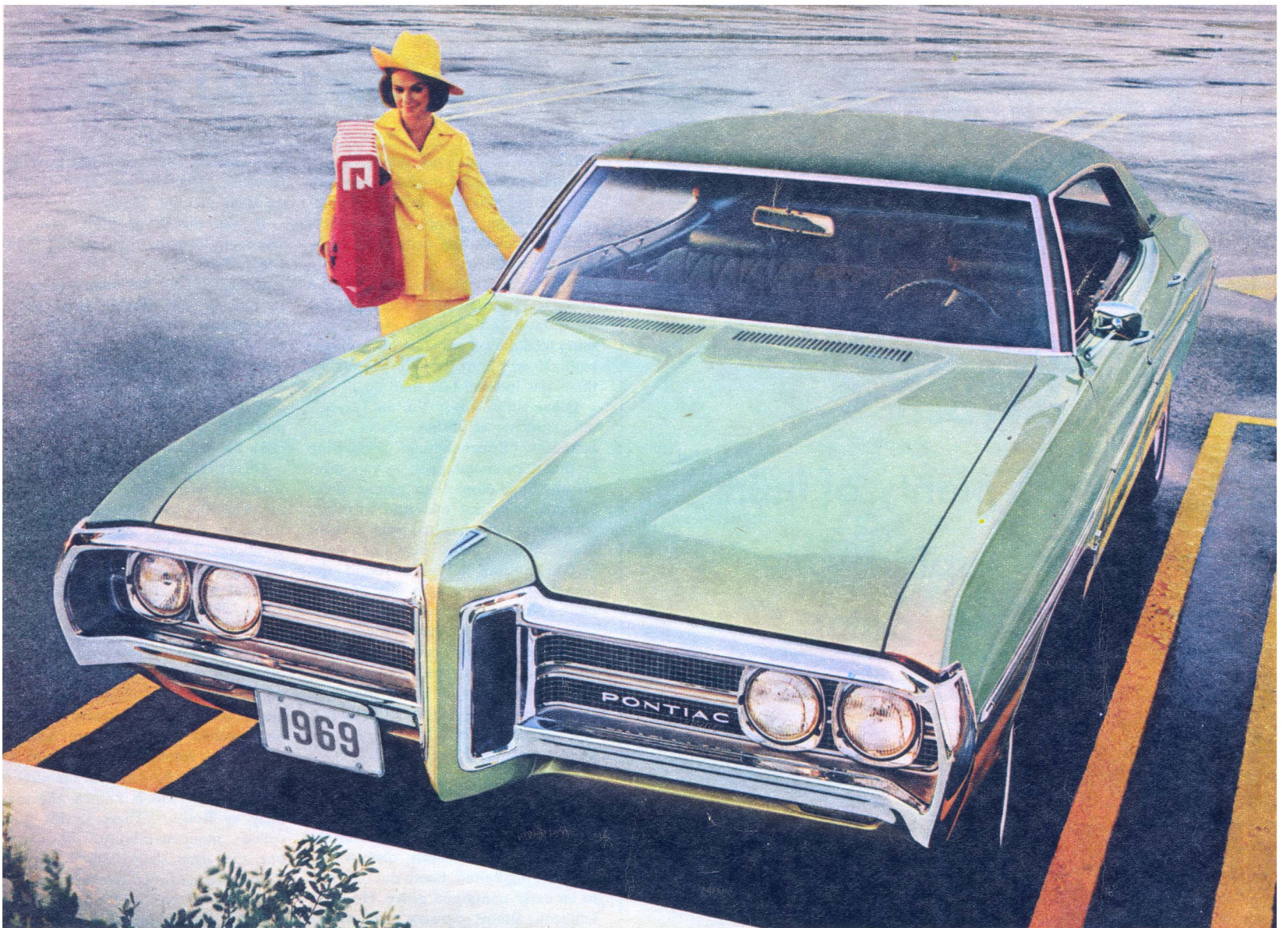
Grande Parisienne Sport Sedan with optional vinyl roof.

Pontiac introduces another first...and puts it up front where the action is.