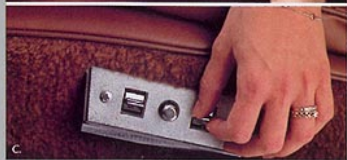
A. Limited Wagon Interior in Chelsea Leather B. Cruise Control (available w/auto transmission only) C. 6-Way Power Seat (Optional) D. Pop Up Sun Roof (Optional NA Wagon)