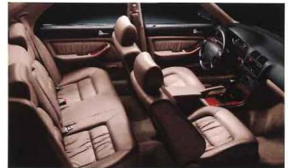
The Acura Legend interior is an intelligent environment of refined luxury and ergonomic excellence.

A driver's side air bag Supplemental Restraint System (SRS) is standard on all models, with a passenger's side air bag included on L and LS models. Air conditioning, power windows and door locks are standard. A leather-trimmed interior and burlled walnut trim is standard on LS models, with leather trim optional on L models.