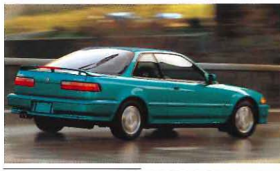
The Acura Integra 3-door GS-R in Aztec Green Pearl.

SINCE THEIR INTRODUCTION for the 1990 model year, the Integra 3-door and 4-door sports sedans have earned a reputation for stirring performance, exhilarating agility, refined road manners and intelligent ergonomics.