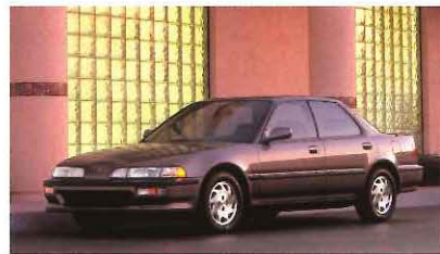
The Acura Integra 4-door GS in Rosewood Brown Metallic.