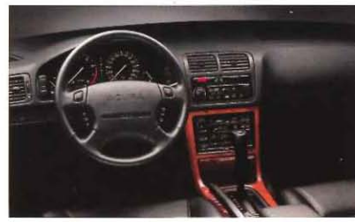
The cockpit is engineered to give information at a glance and quick, precise response to the controls.

Air conditioning, power windows and door locks and a power moonroof are also standard. The Legend Coupe LS combines an elegantly crafted leather-trimmed interior, burled walnut console and door panels, Automatic Climate Control and an acoustically tailored Acura/Bose® Music System. Leather trim is also available as an option in the comprehensively equipped L model.