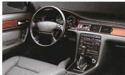
The ergonomically engineered cockpit is trimmed with warm wood accents and, in GS models, soft, supple leather.

Every Vigor is equipped with a Supplemental Restraint System (SRS) driver's side air bag, air conditioning, power windows, power door locks, cruise control, wood-trim accents, and a powerful 8-speaker AM/FM stereo/cassette music system. A luxurious, leather-trimmed interior, a power-operated moonroof and an innovative Digital Signal Processor (DSP) sound system, which electronically emulates any one of six distinct listening environments, are included in the Vigor GS model.