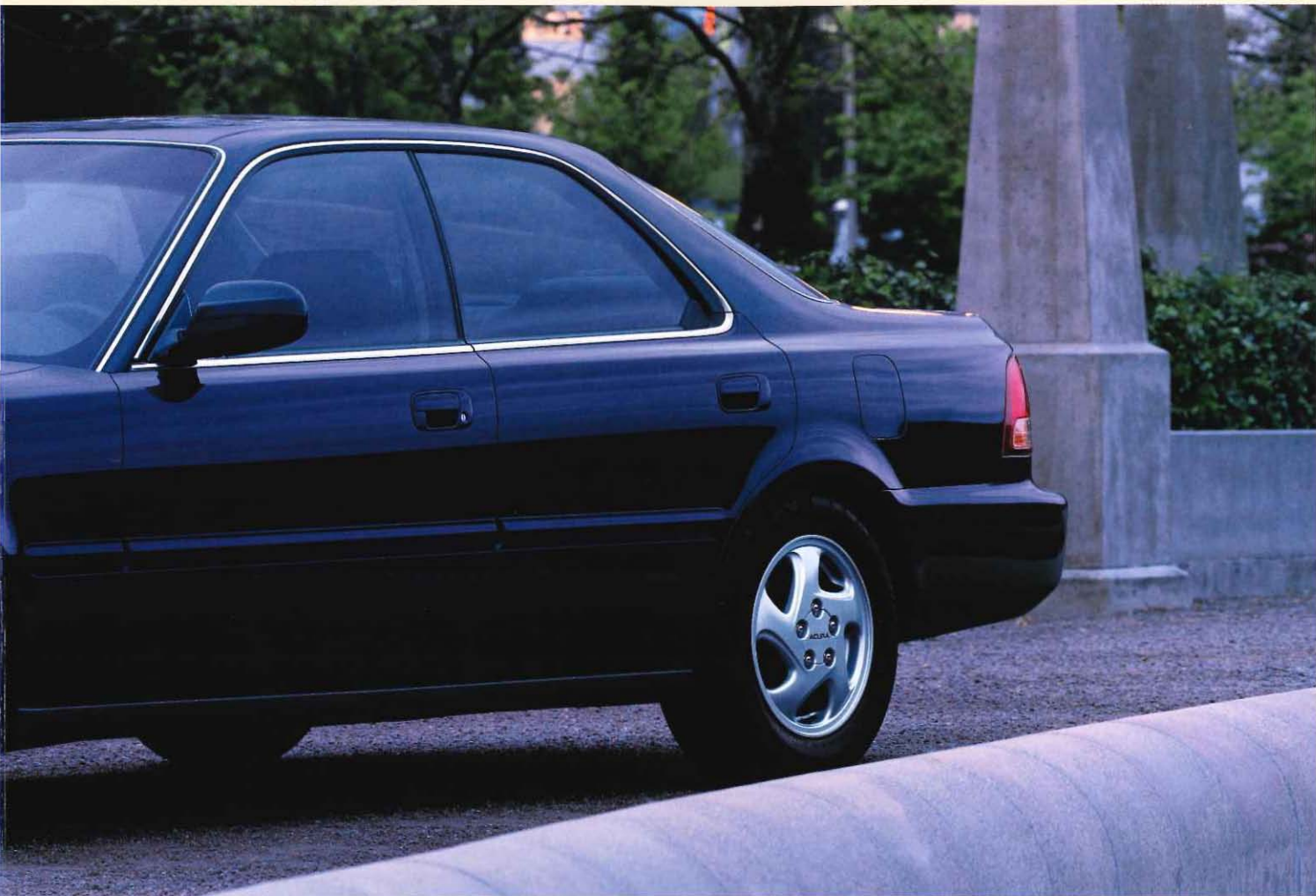
3.2TL shown in Pacific Blue Pearl