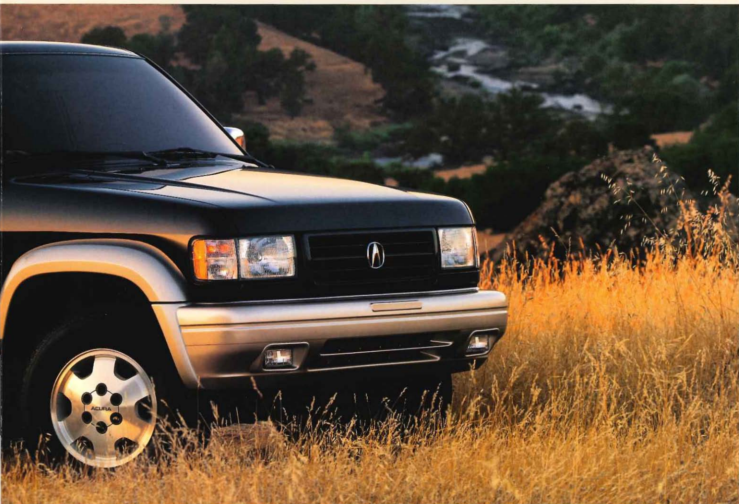
SLX with available Premium Package shown in Ebony Black