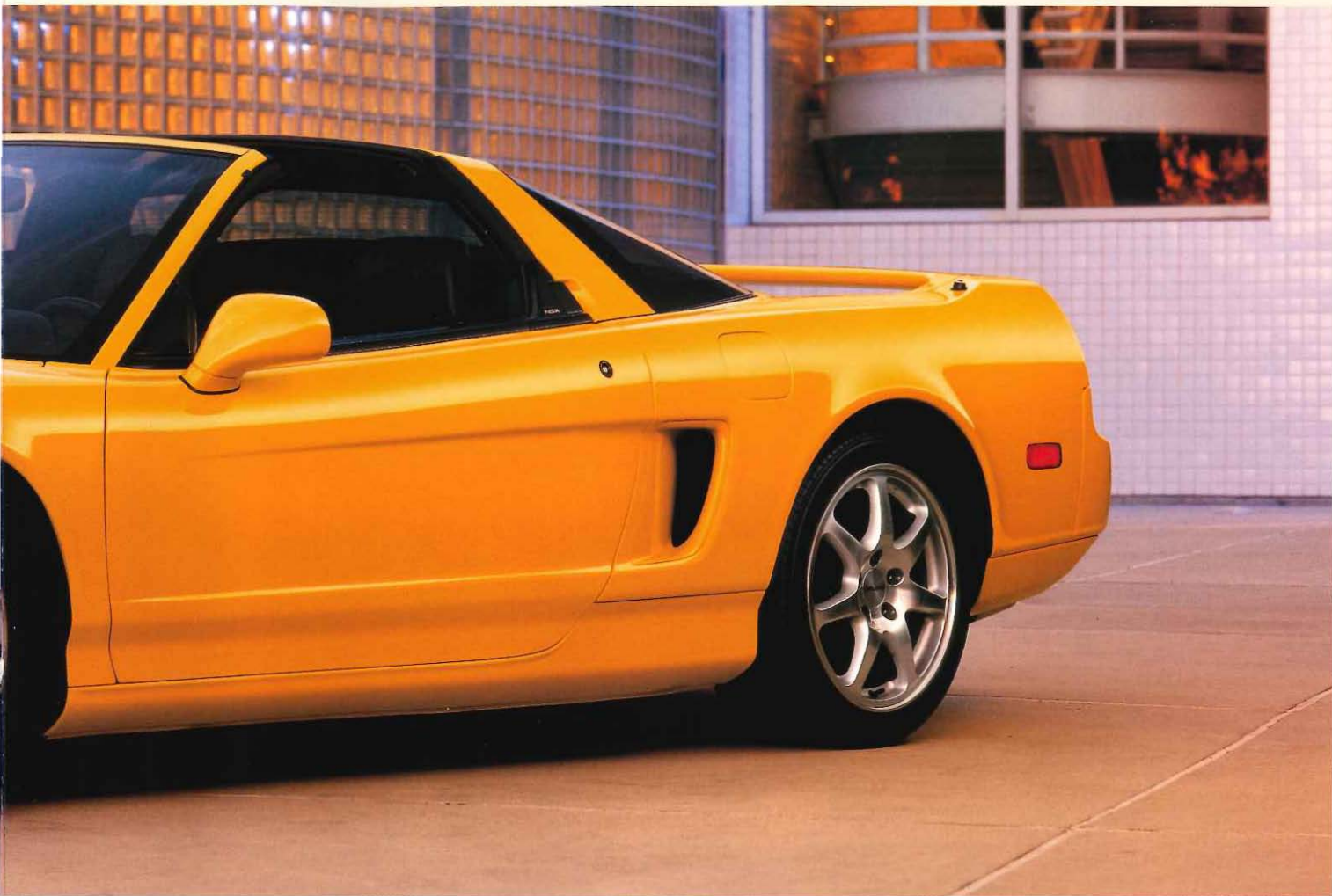
NSX-T shown in Spa Yellow Pearl