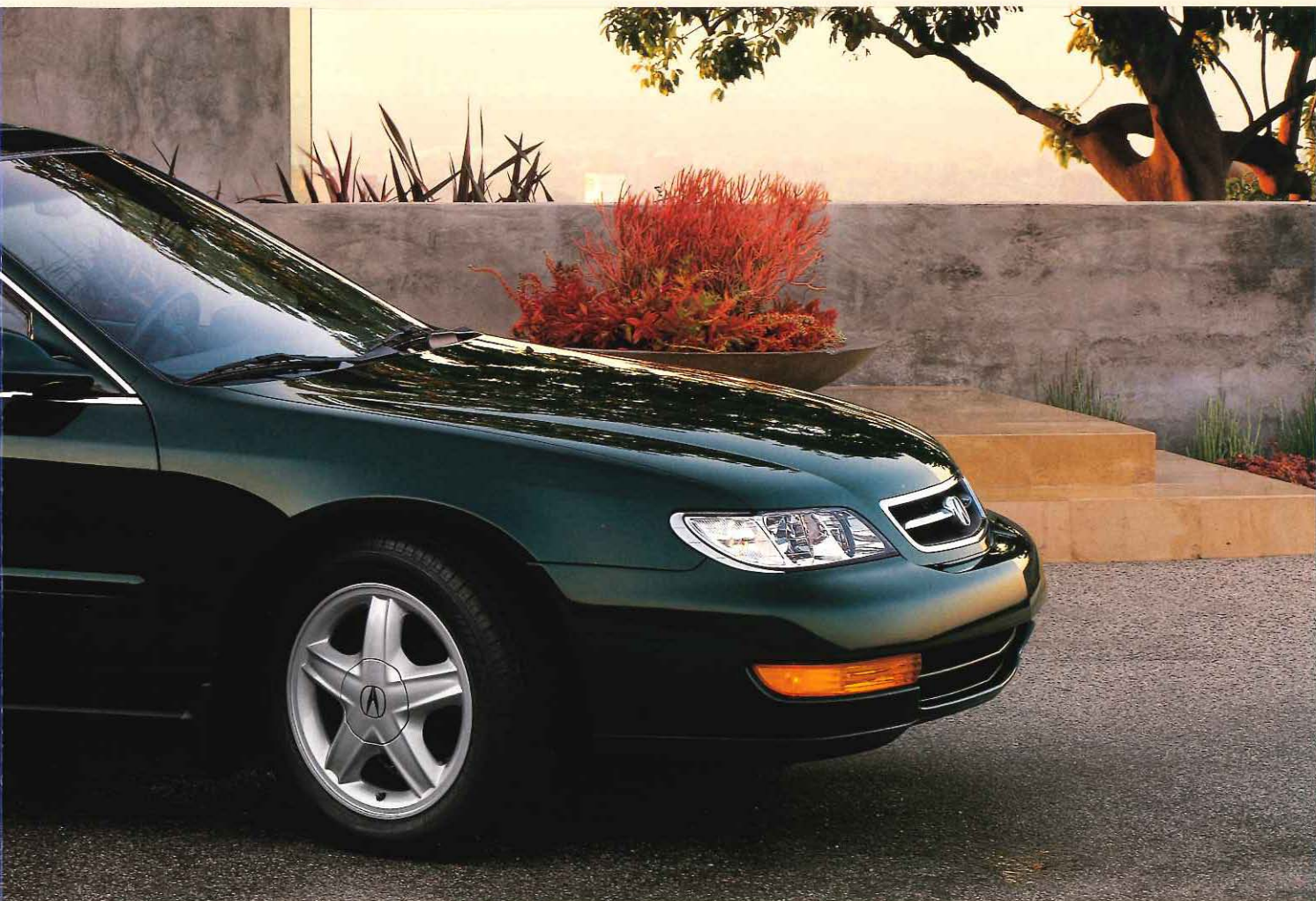
3.0CL shown in Cypress Green Pearl