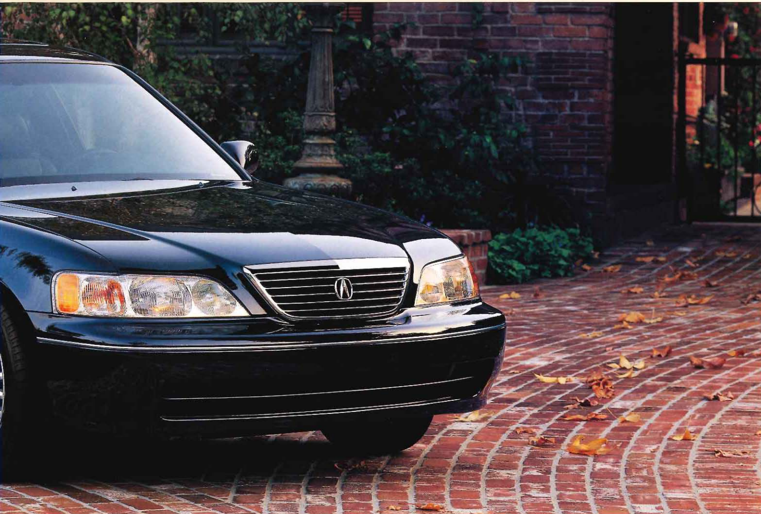
3.5RL shown in Flamenco Black Pearl