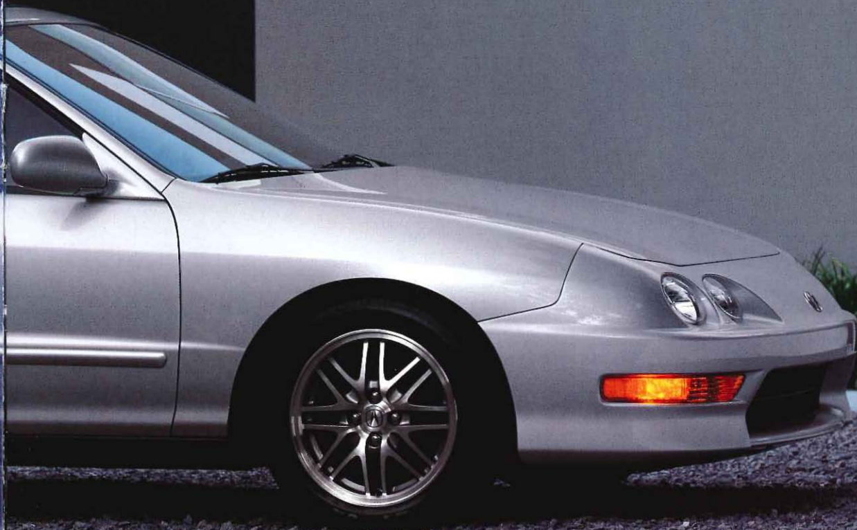
Integra GS Sports Coupe shown in Vogue Silver Metallic.

RS, LS, GS: 1.8-liter, all-aluminum, 4-cylinder, 16-valve DOHC engine, 140 hp @ 6300 rpm