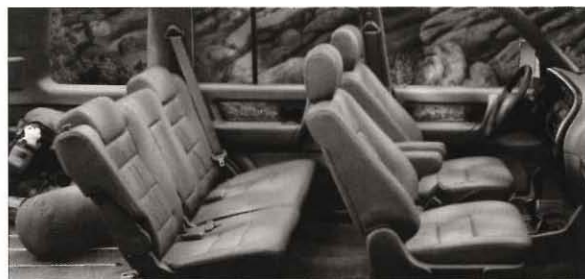
The roomy, leather-appointed interior of the Acura SLX would not look out of place in a world-class luxury sedan.

Additional Exterior Colors: Cream White, Light Silver Metallic, Ebony Black and Baltic Blue