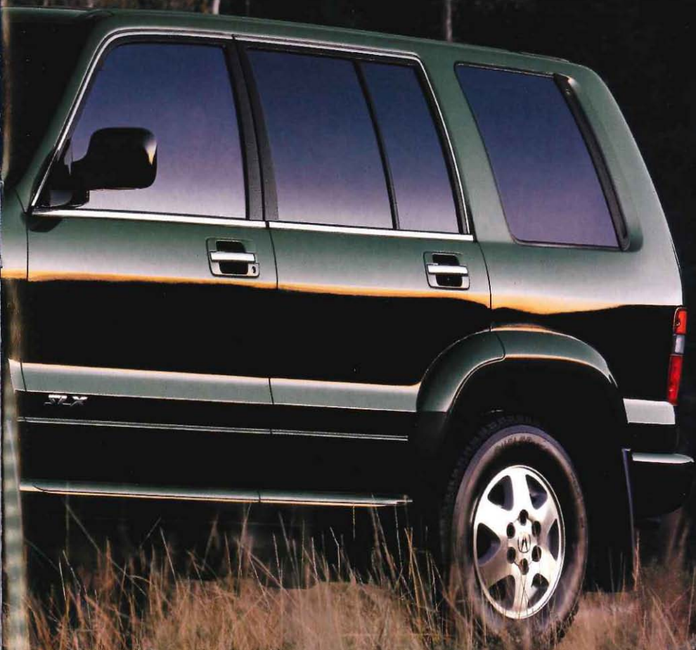
SLX shown in Fir Green Mica.

3.5-liter, DOHC, 24-valve, V-6 engine with 215 hp @ 5400 rpm and 230 lbs-ft torque @ 3000 rpm