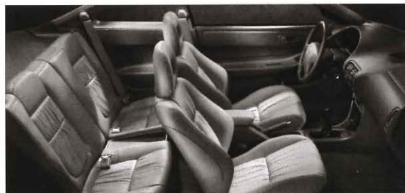
Selected Integra Sports Coupes and Sports Sedans are available with an interior appointed in supple, hand-selected leather.

*Integra Type-R available in spring 1998. †Not available on RS.