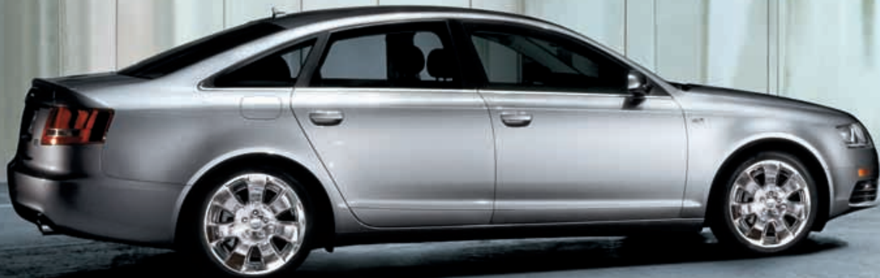
A6 3.2 Sedan & Avant A6 4.2 Sedan