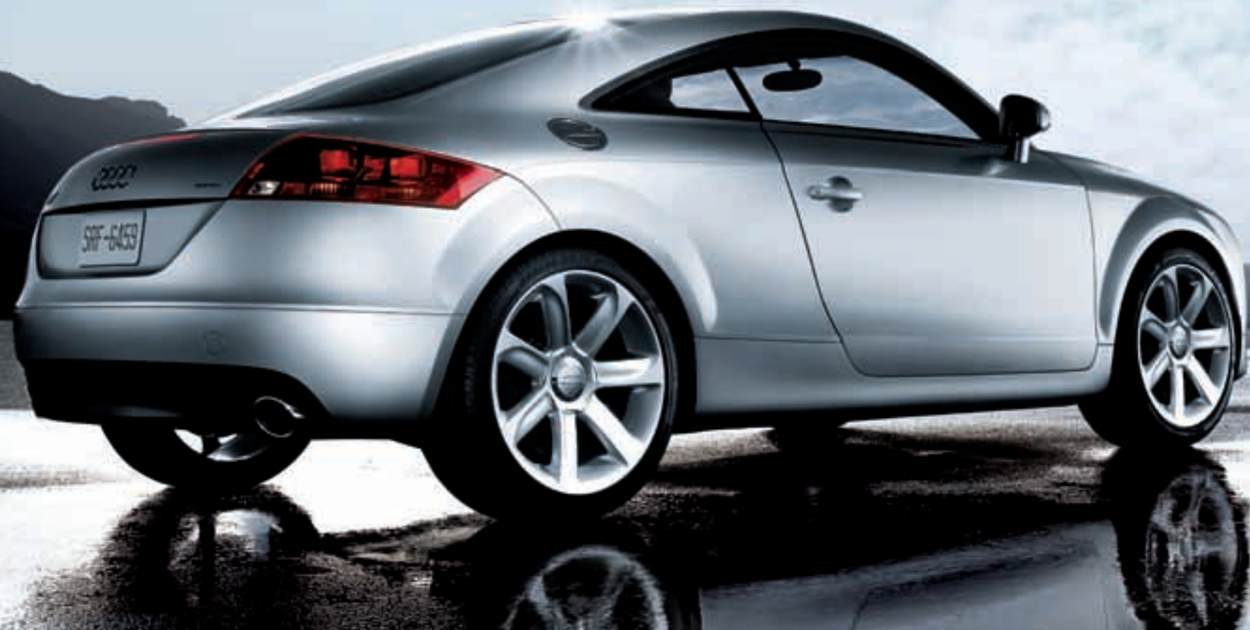
TT 2.0 TFSI Coupe & Roadster TT 3.2 Coupe & Roadster