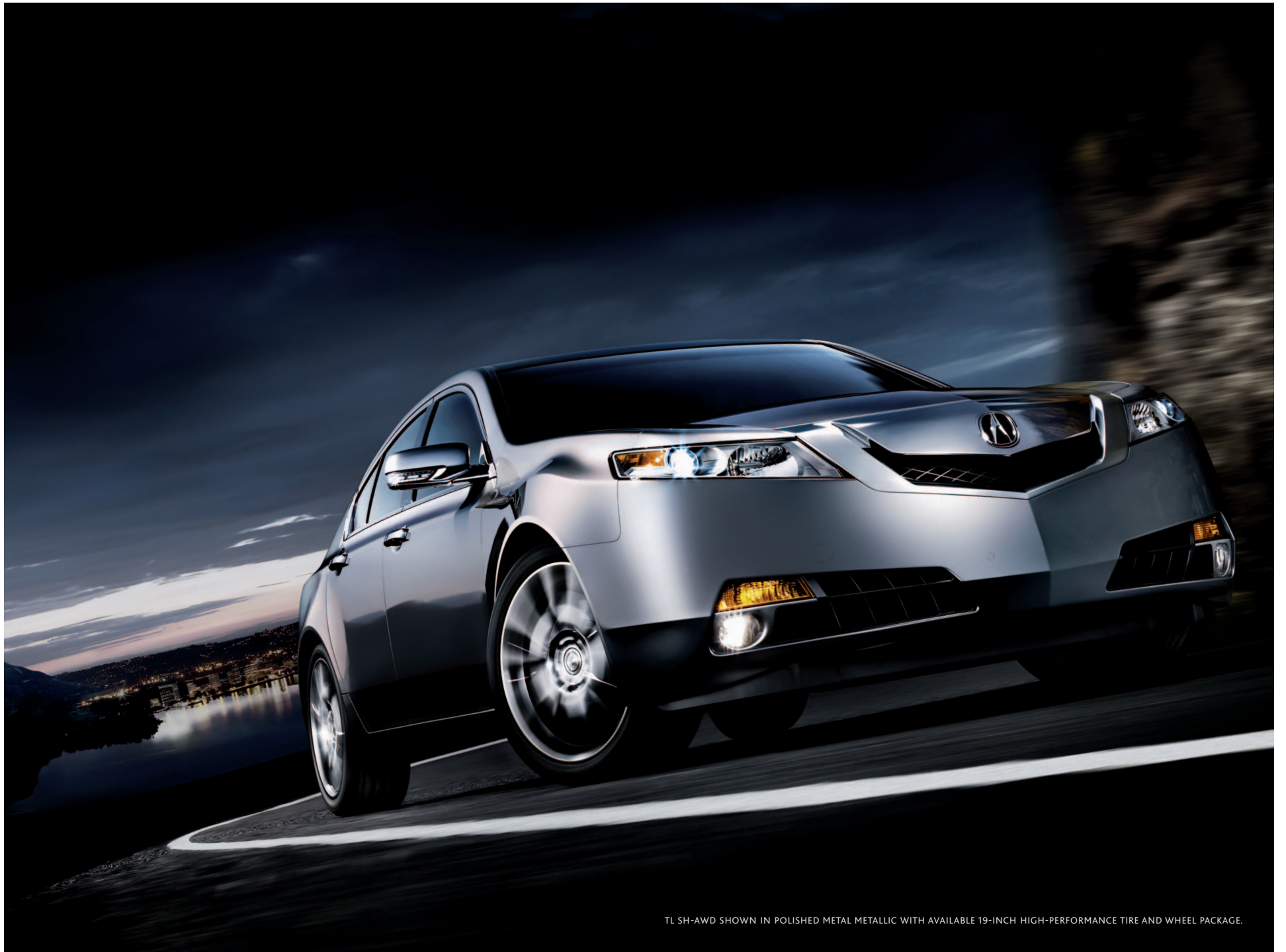
TL SH-AWD SHOWN IN POLISHED METAL METALLIC WITH AVAILABLE 19-INCH HIGH-PERFORMANCE TIRE AND WHEEL PACKAGE.