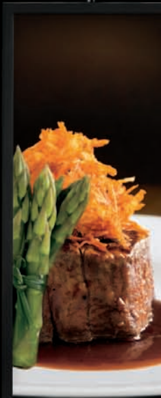
"FIND NEAREST ZAGAT RESTAURANT"