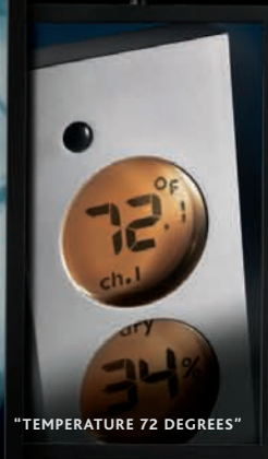
"TEMPERATURE 72 DEGREES"