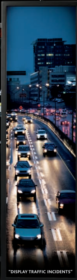
"DISPLAY TRAFFIC INCIDENTS"