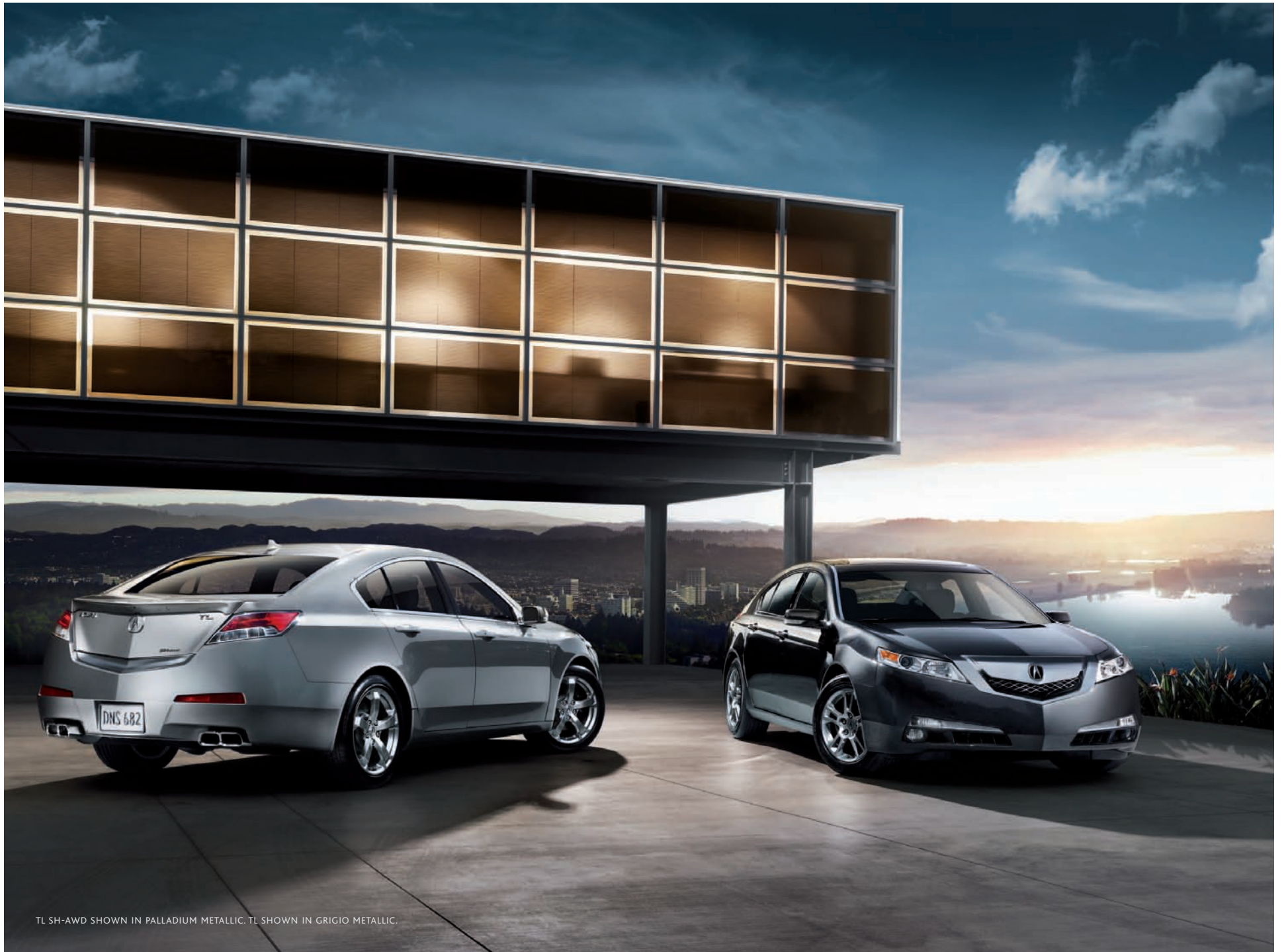
TL SH-AWD SHOWN IN PALLADIUM METALLIC. TL SHOWN IN GRIGIO METALLIC.