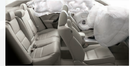
AIRBAGS INFLATED FOR DISPLAY PURPOSES.

ADVANCED AIRBAG SYSTEM DUAL-STAGE, DUAL-THRESHOLD FRONT AIRBAGS, FRONT SIDE AIRBAGS AND SIDE CURTAIN AIRBAGS ARE ONLY PART OF ACURA'S COMPREHENSIVE APPROACH TO PASSIVE SAFETY. AN OCCUPANT POSITION DETECTION SYSTEM (OPDS) IS DESIGNED TO PREVENT DEPLOYMENT OF THE FRONT PASSENGER'S SIDE AIRBAG IF A SMALL-STATURED OR OUT-OF-POSITION FRONT PASSENGER LEANS INTO THE AIRBAG'S DEPLOYMENT PATH.*