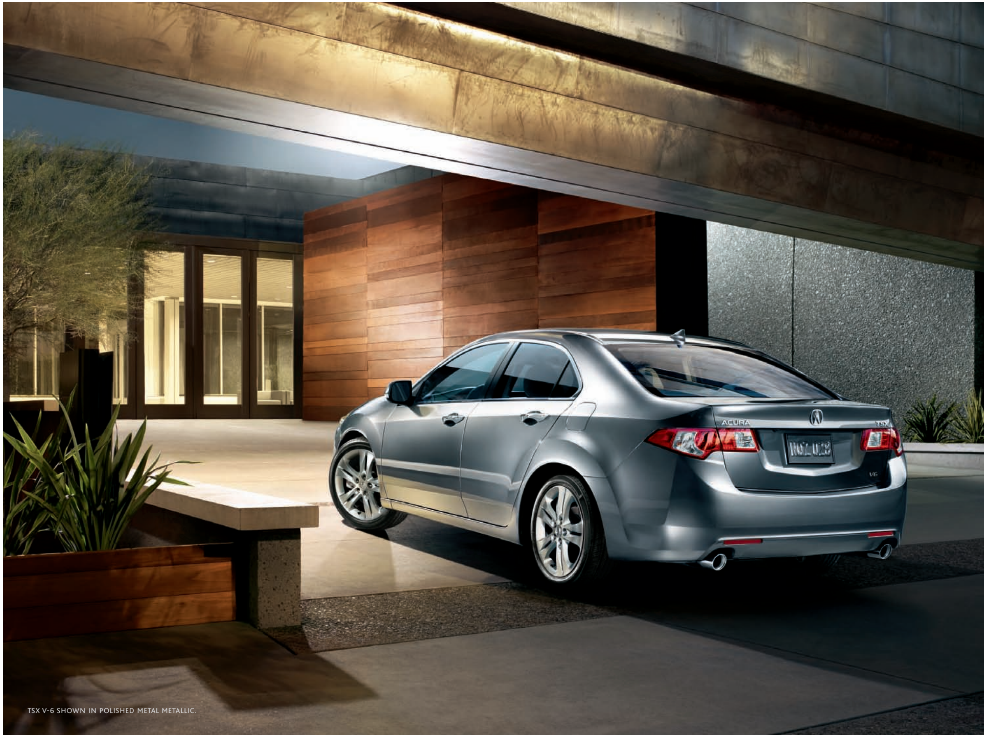
TSX V-6 SHOWN IN POLISHED METAL METALLIC.