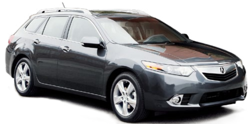
2011 TSX Sport Wagon Color preview available mid-December.