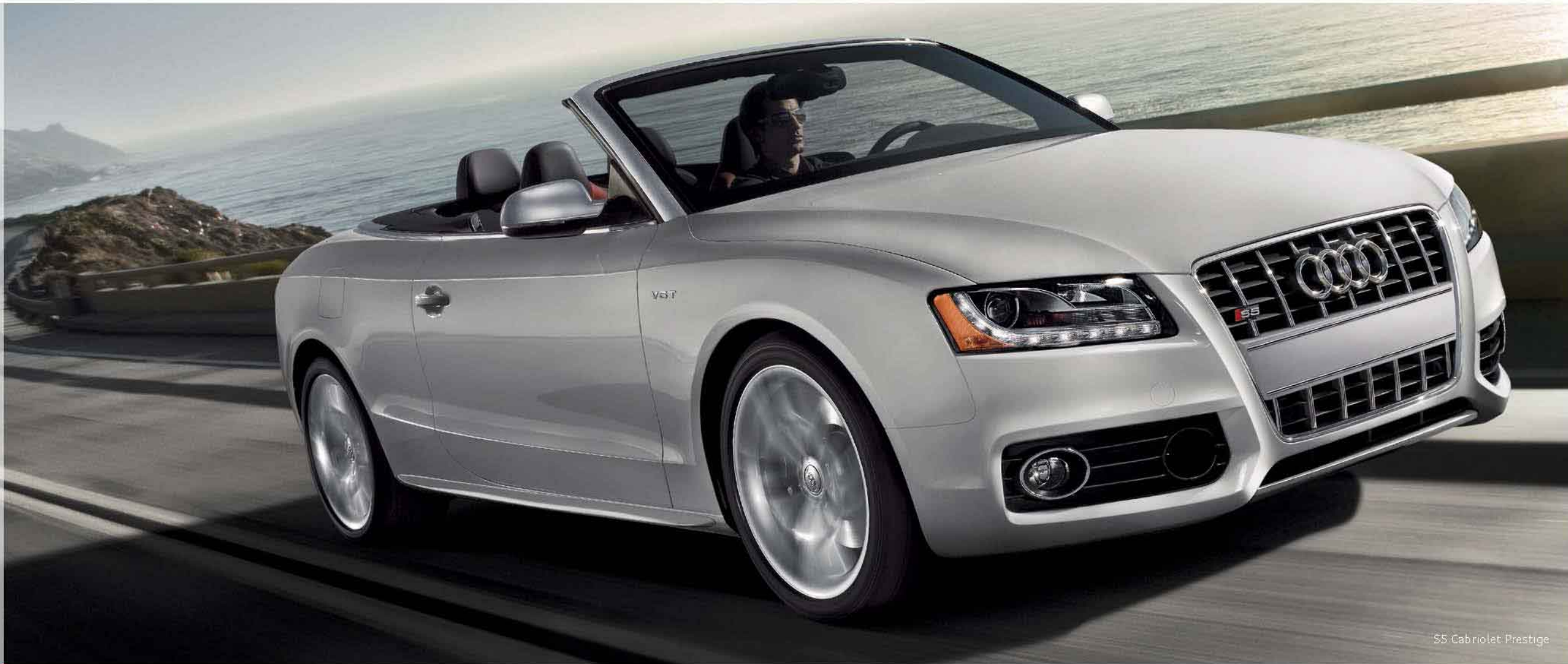
S5 Cabriolet Prestige