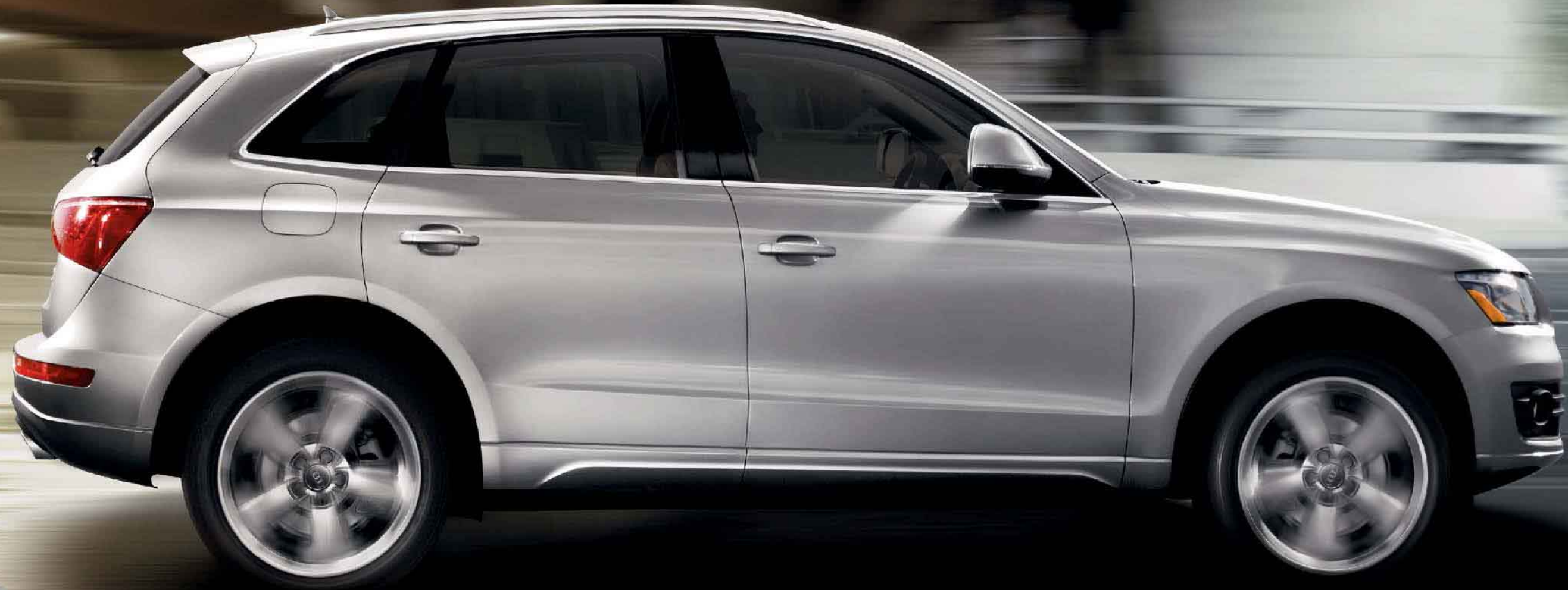
Q5 2.0T Premium Plus