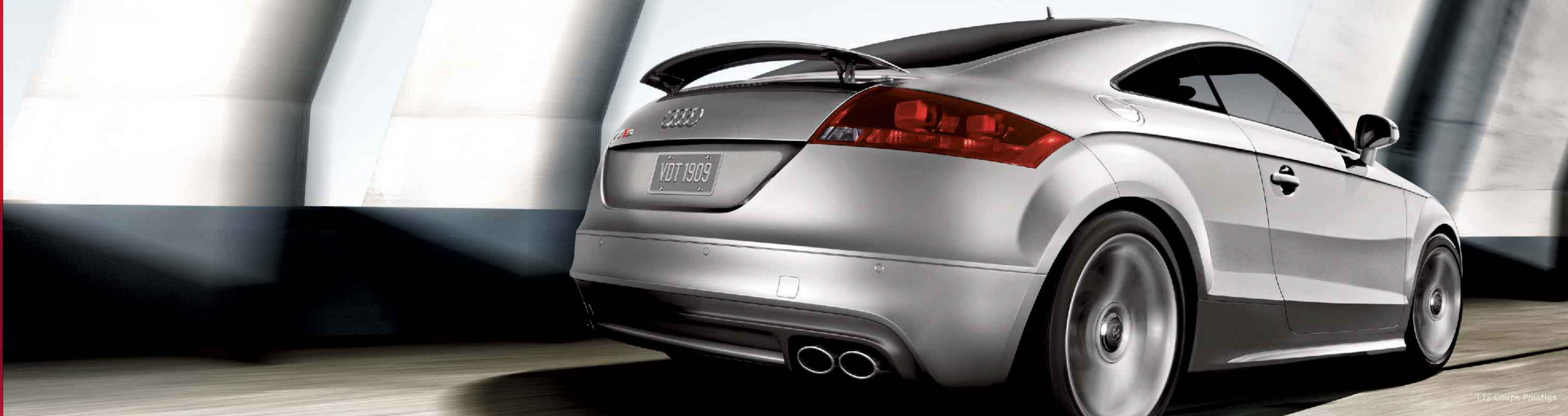
TTS Coupe Prestige