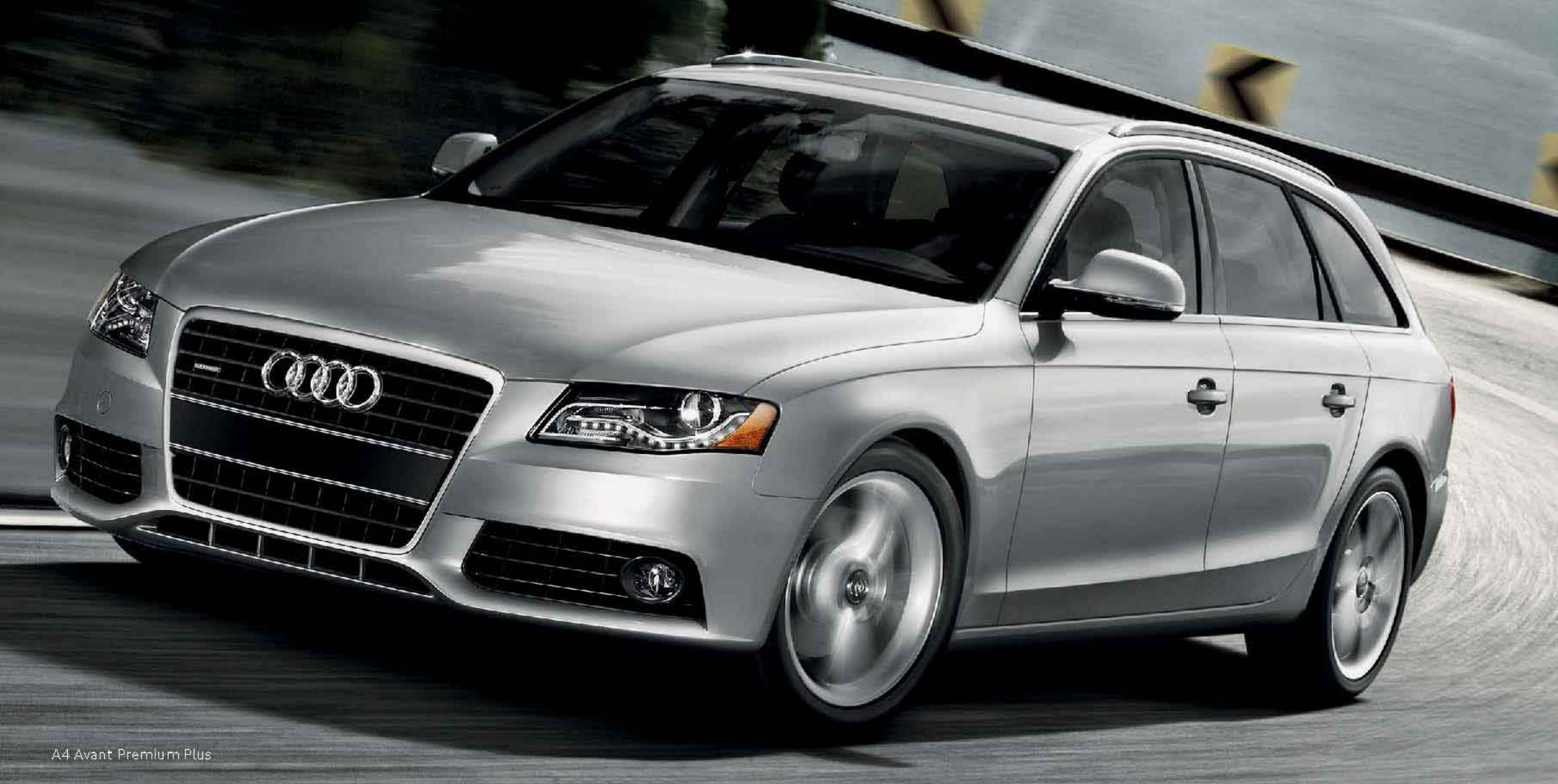
A4 Avant Premium Plus