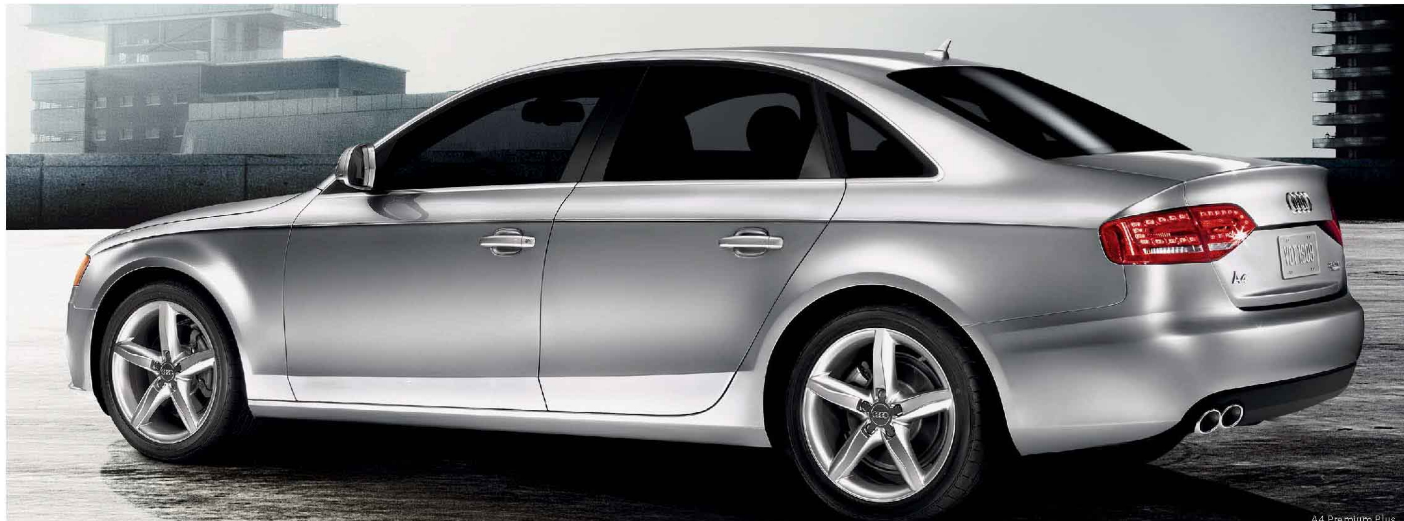
A4 Premium Plus

The Audi A4 is the biggest, fastest and most fuel-efficient vehicle in the sports sedan category.* Featuring the 2.0T engine, named one of Ward's Ten Best Engines five years in a row†, it offers six-cylinder performance with the efficiency of a four-cylinder. The A4 provides sportscar performance with unparalleled luxury and attention to detail throughout.