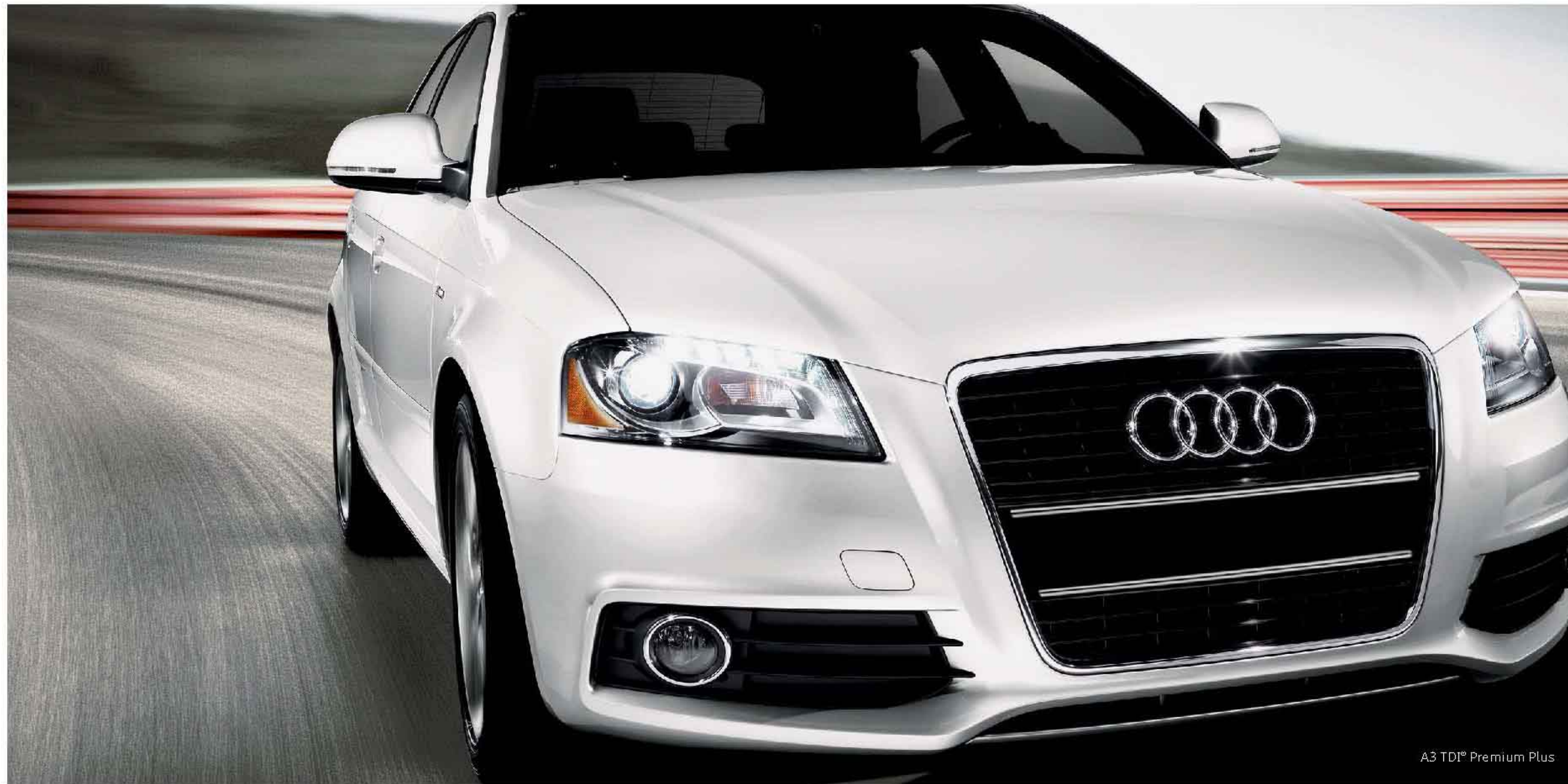
A3 TDI® Premium Plus

powerful 2.0 TDI® turbocharged diesel offering 42 MPG* highway. With either a slick shifting six-speed transmission or available S tronic® dual-clutch transmission that delivers lightning fast shifts, you are in for an unforgettable driving experience.