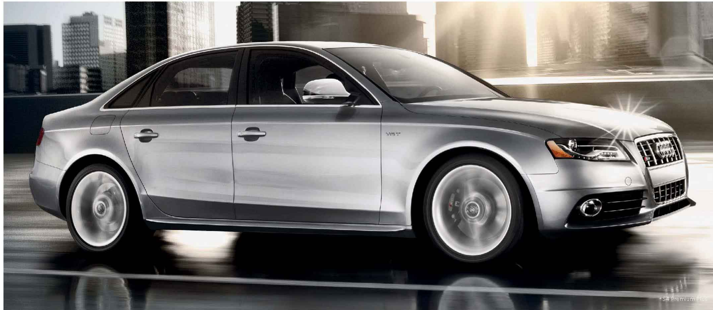
S4 Premium Plus

The S4 delivers power and then some. Its 333hp, 325 lb.-ft. of torque, 3.0T supercharged V6 can launch from a standstill to 60 MPH in an exhilarating 4.9 seconds. This is partially achieved through legendary Audi quattro® all-wheel drive with available Sport Rear Differential. It comes as no surprise then, that the Audi S4 is recognized as “Best in Test” by Car and Driver * over other German sports sedans. Unbridled performance paired with total luxury make driving the S4 an experience unlike any other.