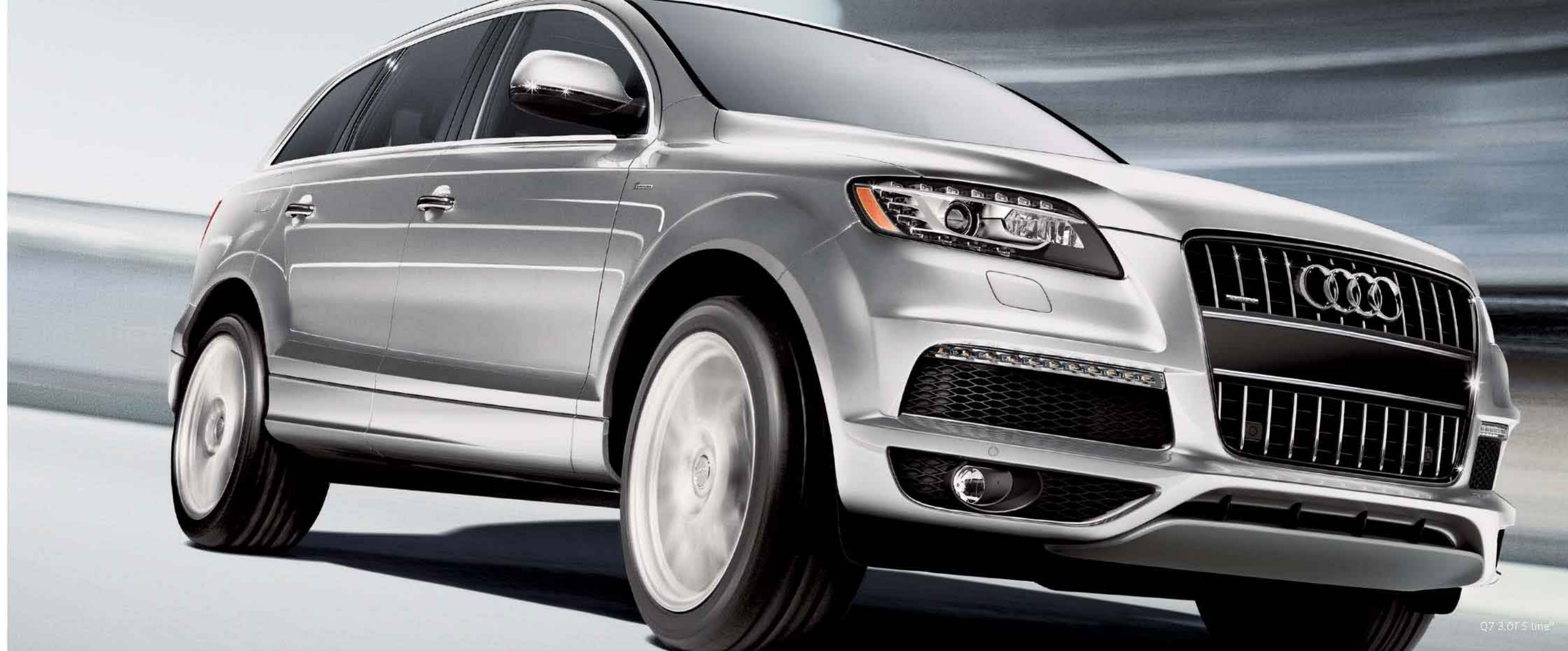
Q7 3.0T S line®

Redefining the concept of a seven-passenger SUV, the Audi Q7 offers sophisticated design, luxury and performance unlike anything else in the category. Featuring a choice of three powerful and efficient* engines, including the advanced technology of TDI® clean diesel, the Q7 offers unrivaled driving dynamics, interior functionality and style.