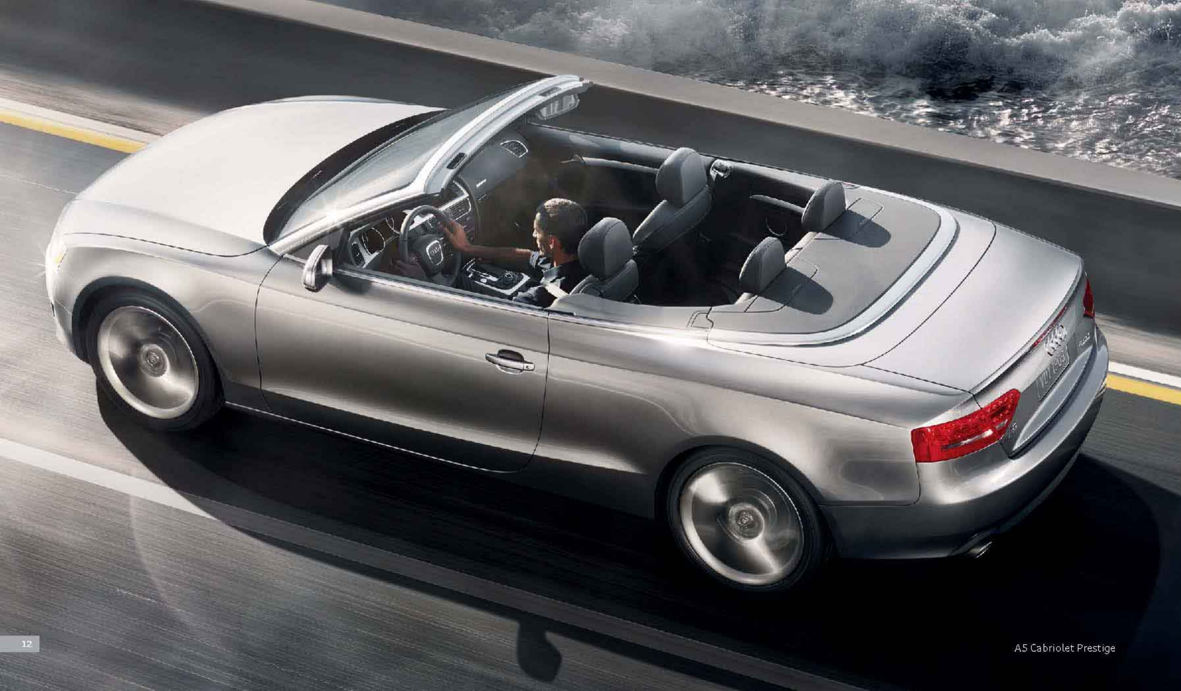
A5 Cabriolet Prestige