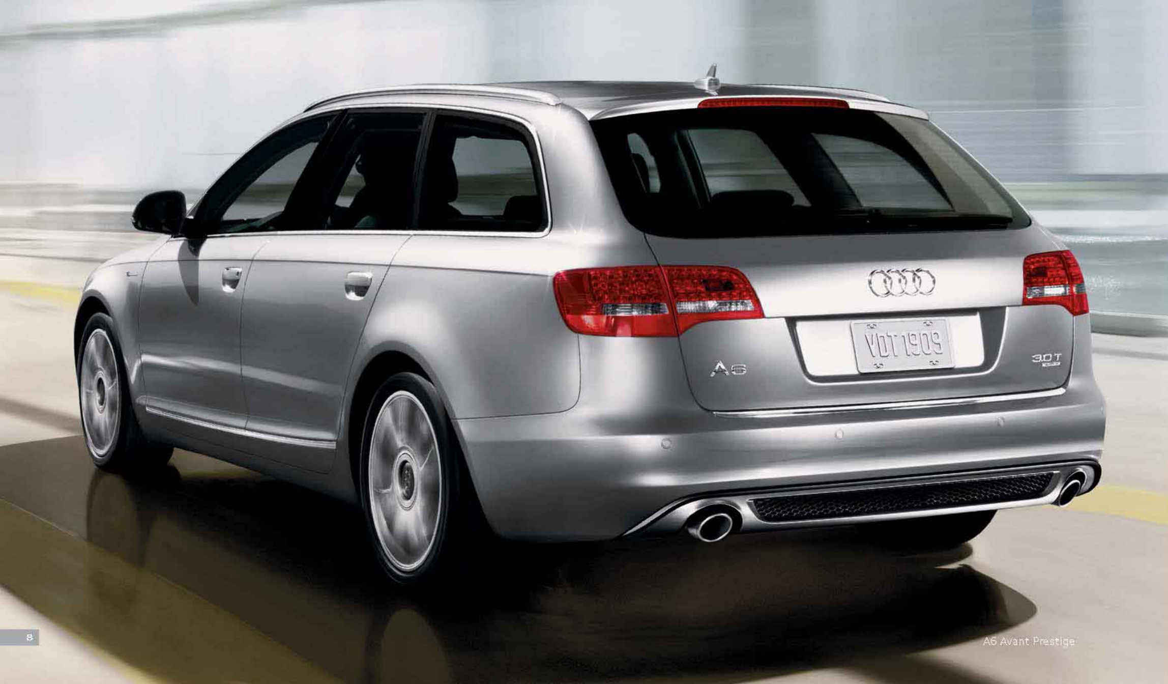
A6 Avant Prestige