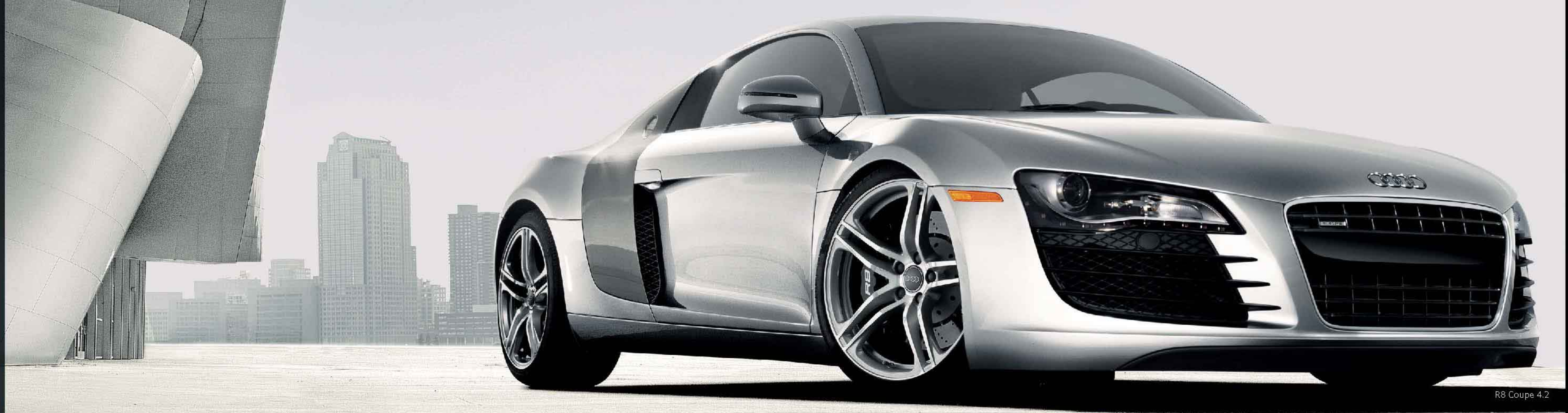
R8 Coupe 4.2