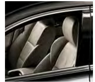
10-WAY POWER DRIVER'S SEAT features a combination of soft and dense materials to help filter out road vibration.