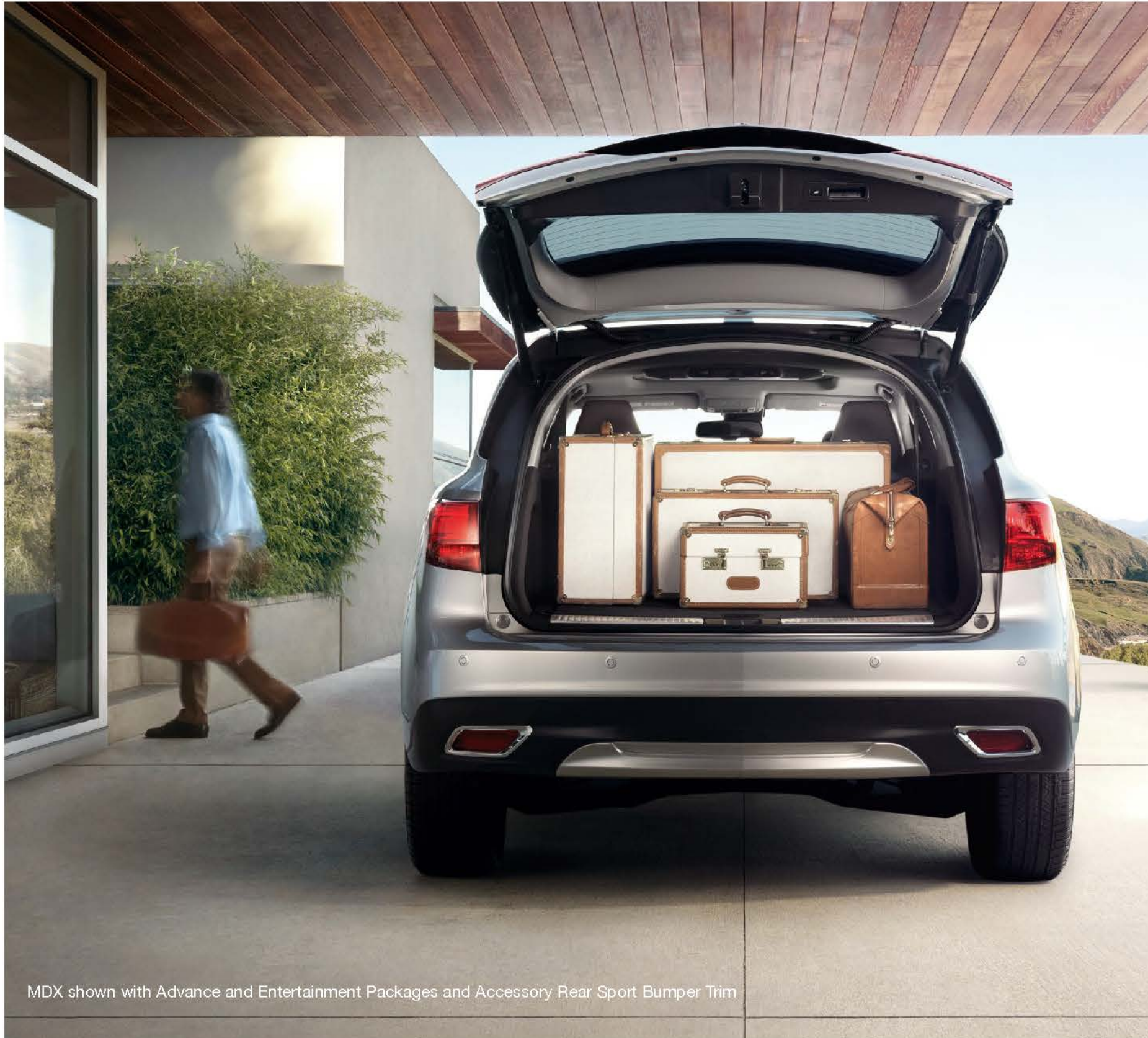
MDX shown with Advance and Entertainment Packages and Accessory Rear Sport Bumper Trim