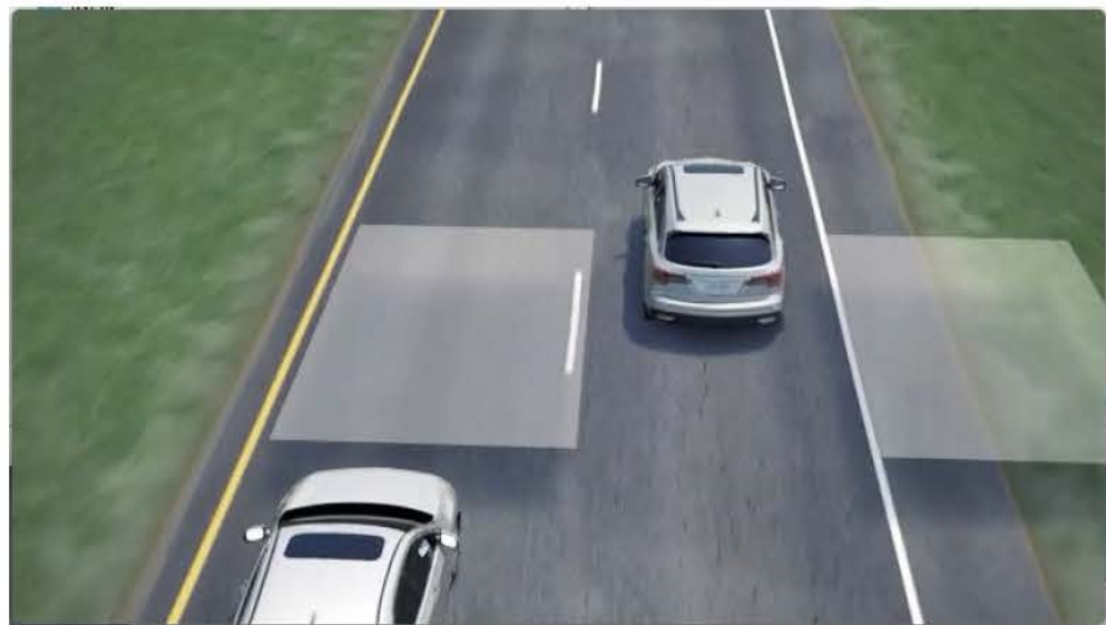
MDX shown with Advance Package