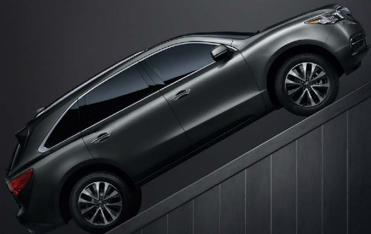
MDX shown with Technology Package and Accessory Roof Rails

It does much, so you can do less. Advanced engineering on the MDX helps make you a better driver. And most of the time, you won't even know it's happening.